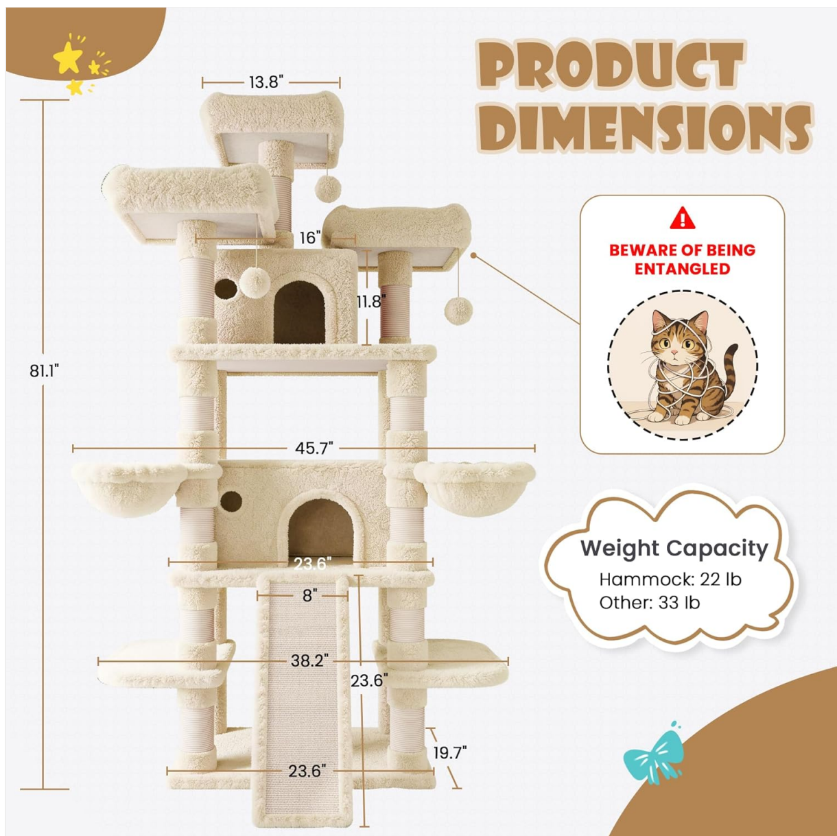
Image: A detailed diagram illustrating the overall product dimensions and individual platform weight capacities.