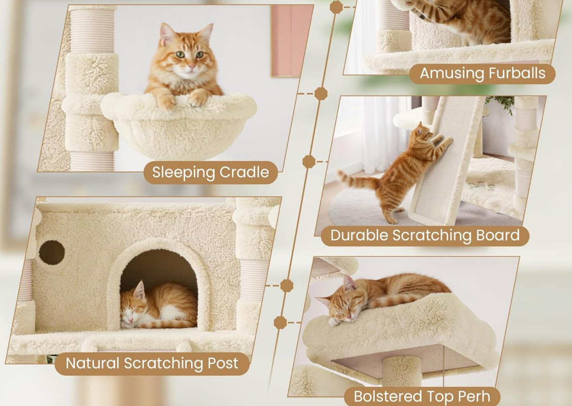
Image: A detailed view highlighting the cat tree's multiple rest and play areas, including a sleeping cradle, durable scratching board, natural sisal scratching post, and a bolstered top perch.