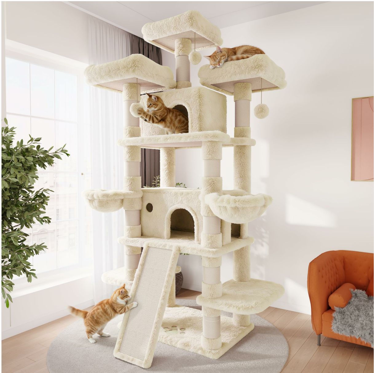
Image: The SHA CERLIN 81-Inch Extra Large Cat Tree in a living room setting, with several cats utilizing its various platforms and condos.