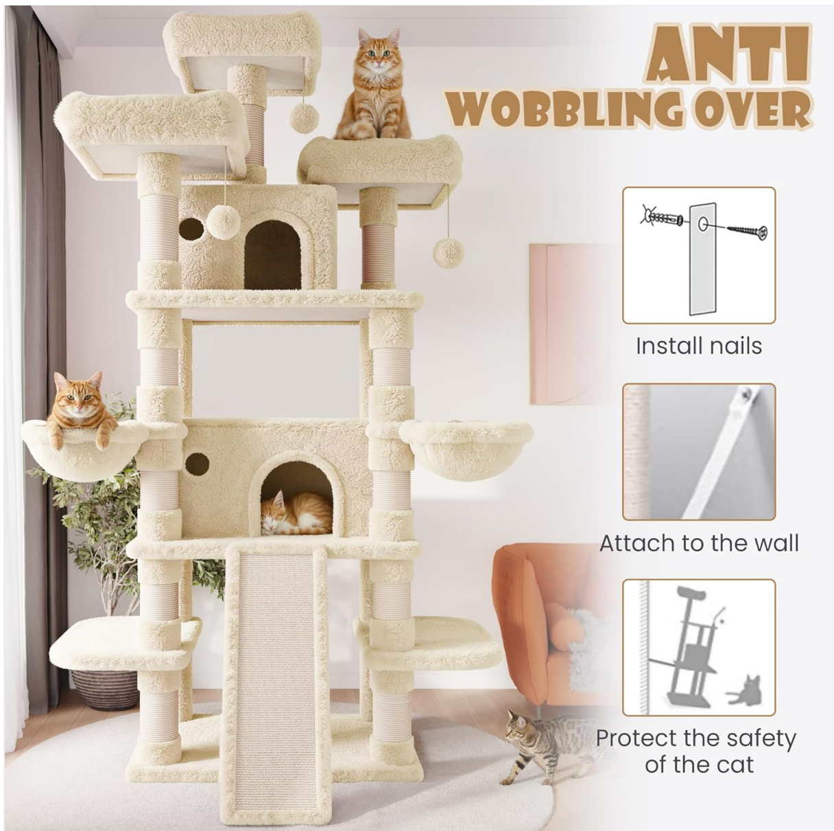
Image: Instructions for securing the cat tree to a wall using an anti-tipping strap and nails to prevent wobbling and ensure cat safety.