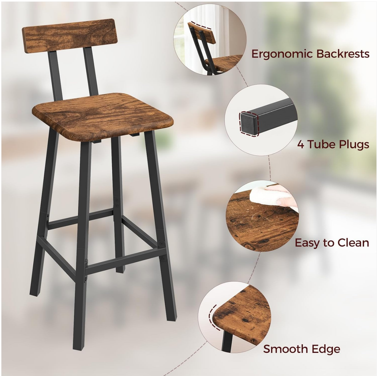
Image: Close-up view of a MAHANCRIS bar stool highlighting its ergonomic backrest, smooth edges, and easy-to-clean surface, along with protective tube plugs.