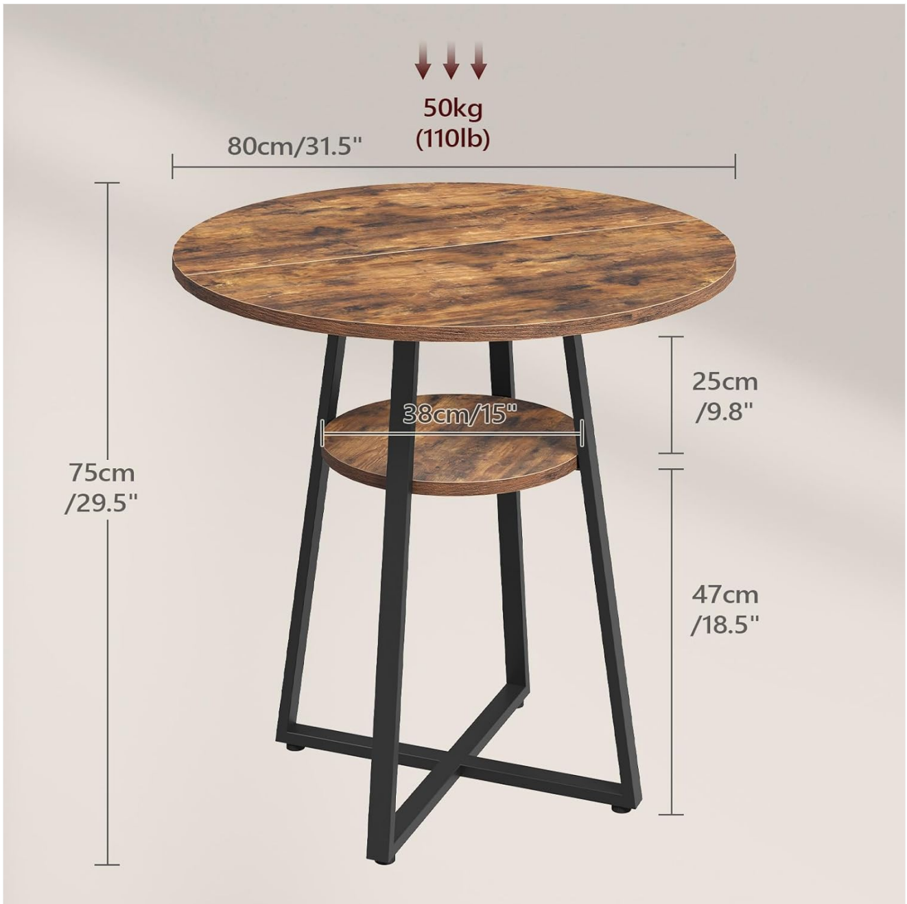
Image: Diagram showing the dimensions of the MAHANCRIS round dining table, including its 31.5" diameter and 29.5" height, along with shelf dimensions.