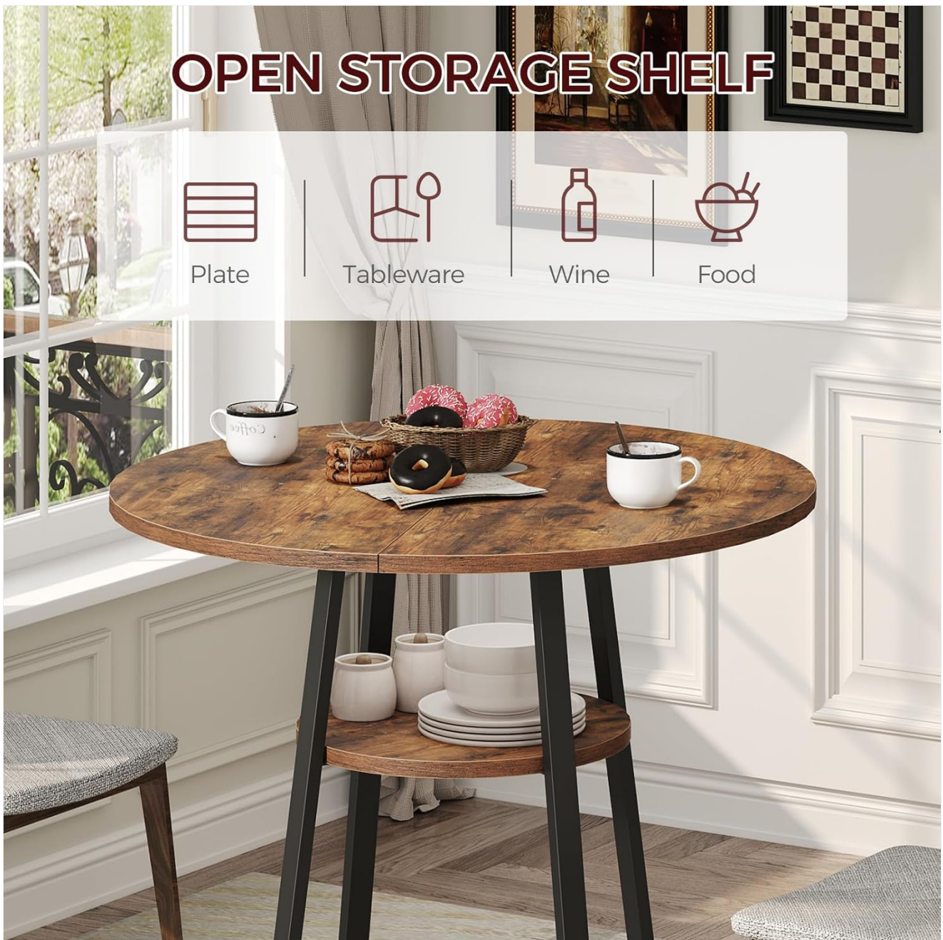
Image: The MAHANCRIIS dining table showcasing its two-tiered open storage shelf, used for holding plates, tableware, and other small items.