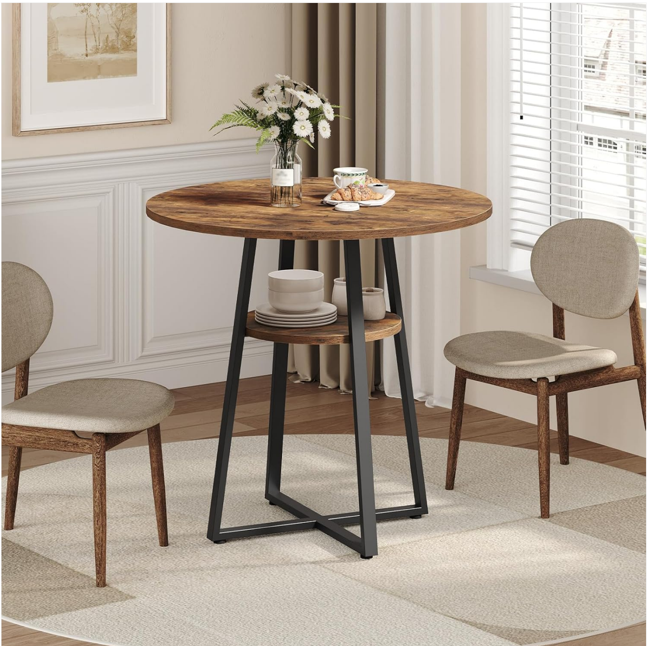
Image: Overview of the MAHANCRIIS 31.5" Round Dining Table and Bar Stools bundle, showing the table with its two-tiered shelf and two matching stools.