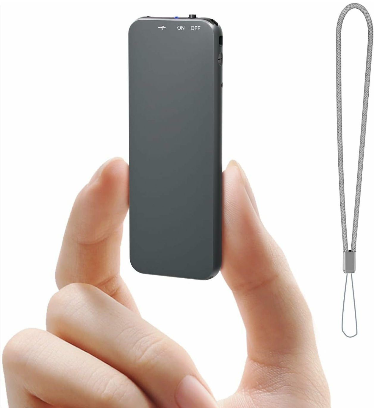
Figure 1: Vivaniir 128GB Mini Voice Recorder, showcasing its compact design and key features.