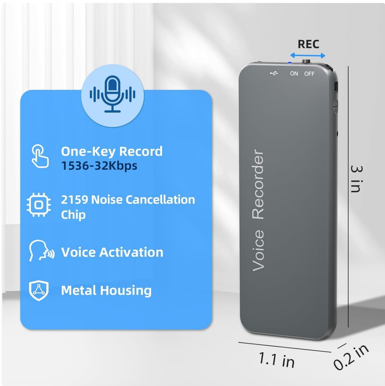
Figure 3: Dimensions and key features of the voice recorder.