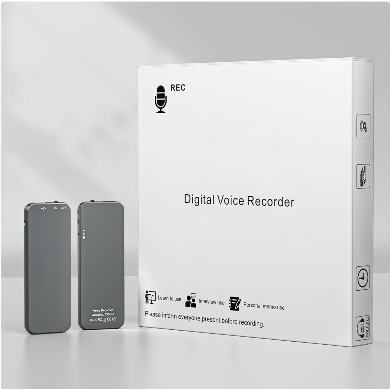
Figure 2: All items included in the Vivaniir 128GB Mini Voice Recorder package.