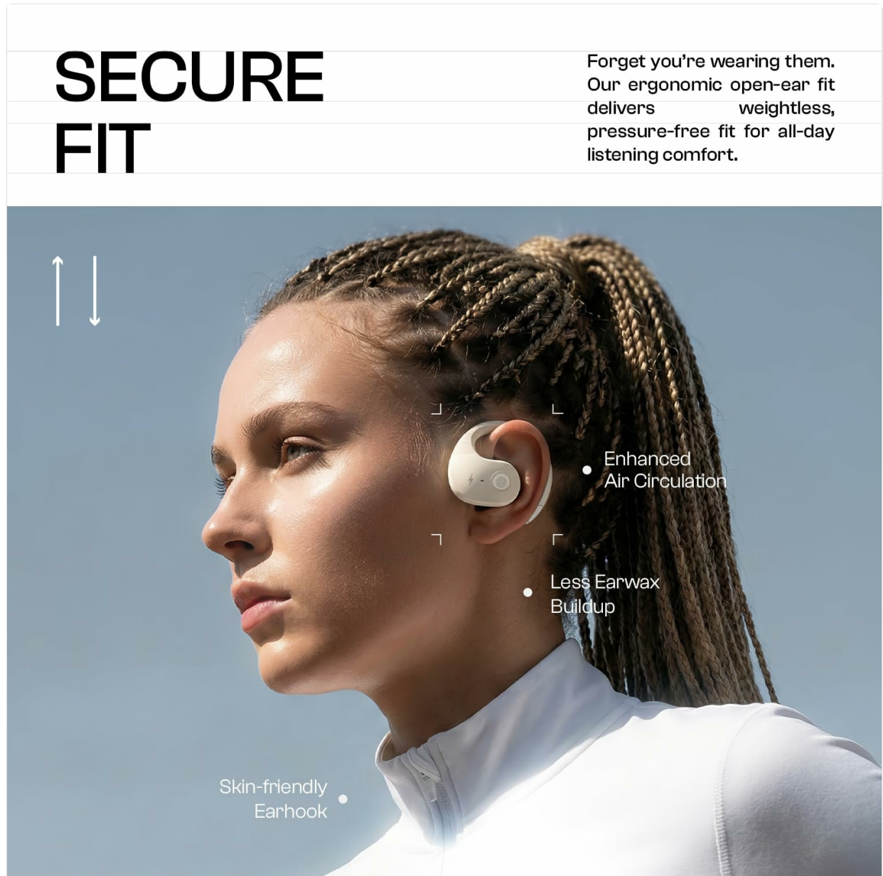
Image: Proper placement of the open-ear earbud for a secure and comfortable fit.

The Aero Glide earbuds feature an open-ear design with an earhook for a secure and comfortable fit. Gently place the earbud over your ear, ensuring the speaker is positioned near your ear canal without entering it. Adjust the earhook for stability.