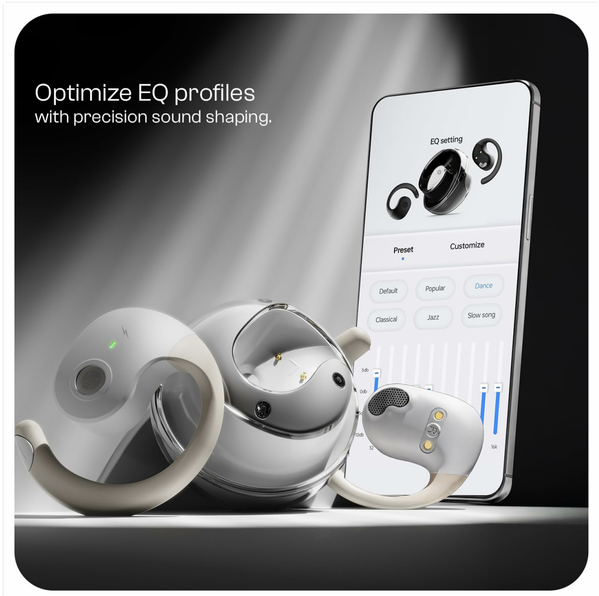
Image: The FirePods App displaying various equalizer presets and customization options.