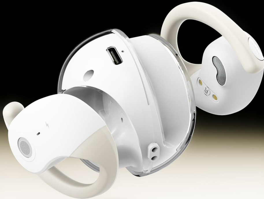
Image: Earbuds correctly placed in the charging case for power replenishment.