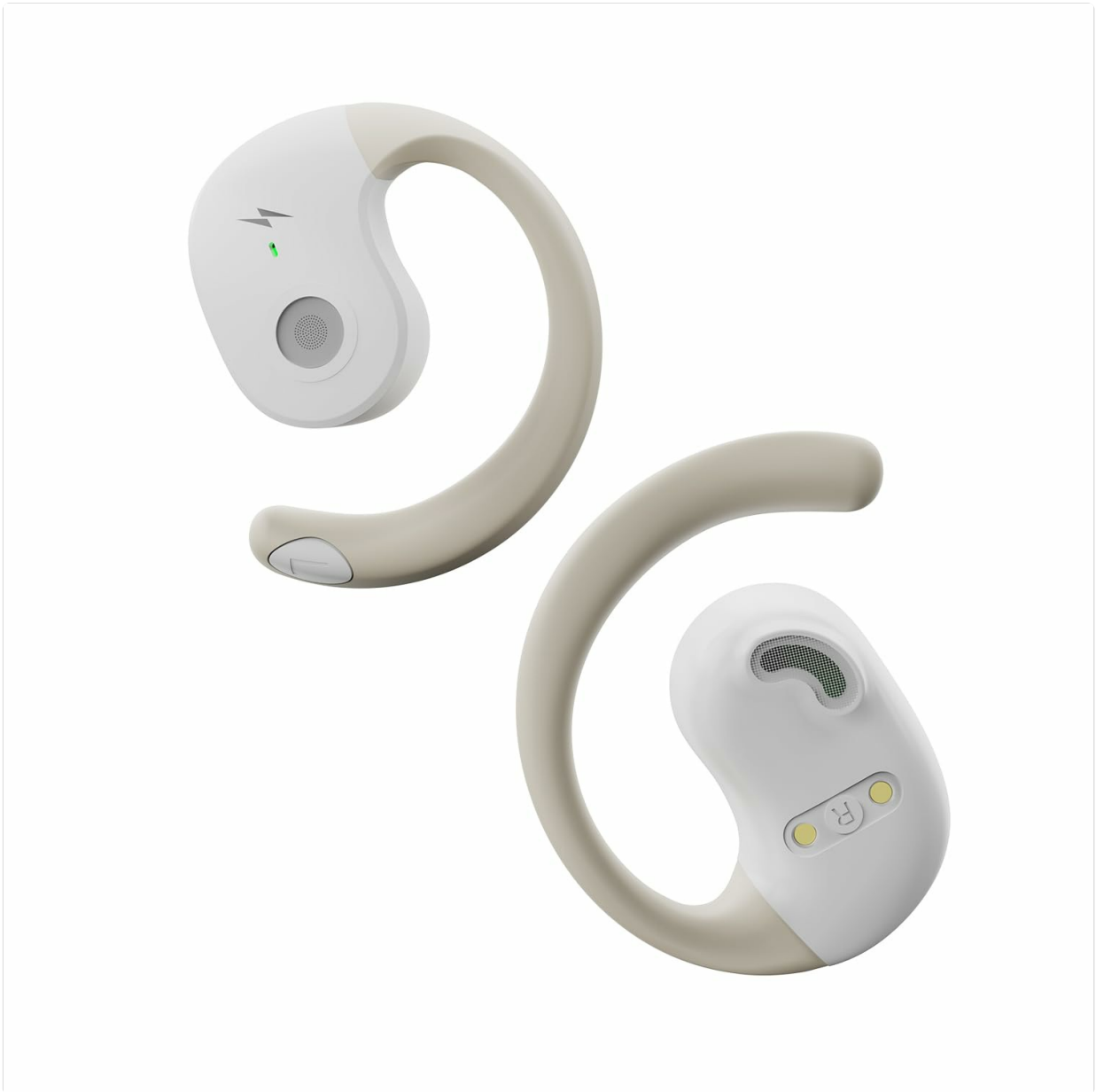
Image: Close-up of an earbud, highlighting the speaker grille and charging contacts.