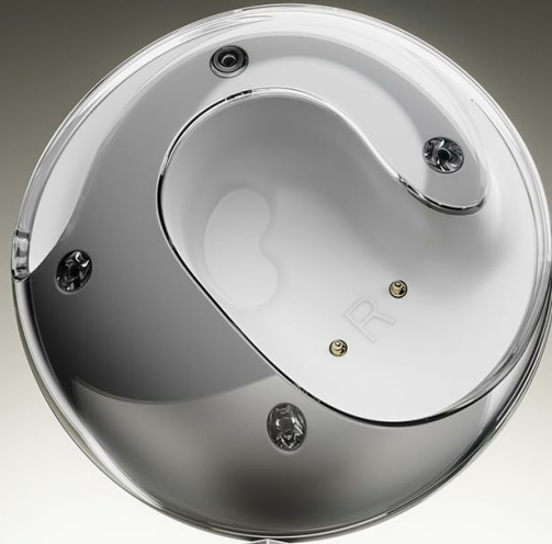
Image: Fire-Boltt Aero Glide earbuds and their compact charging case.