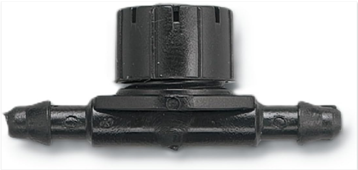
Image: A close-up view of the Orbit Inline Multi-Stream Dripper, showing its black plastic construction and barb fittings for 1/4-inch drip tubing connection.