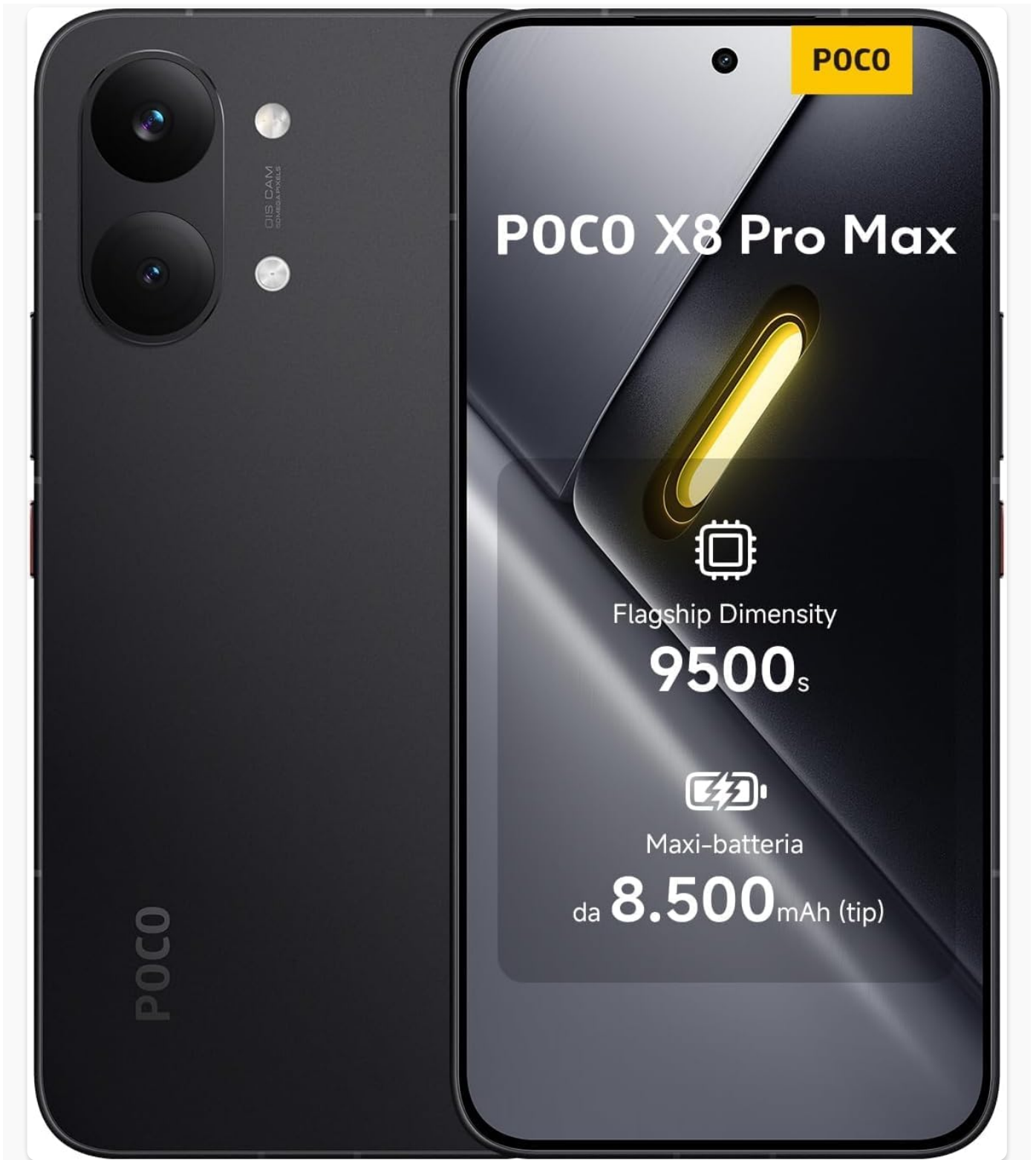
Figure 1: XIAOMI POCO X8 Pro Max 5G Smartphone (Black)