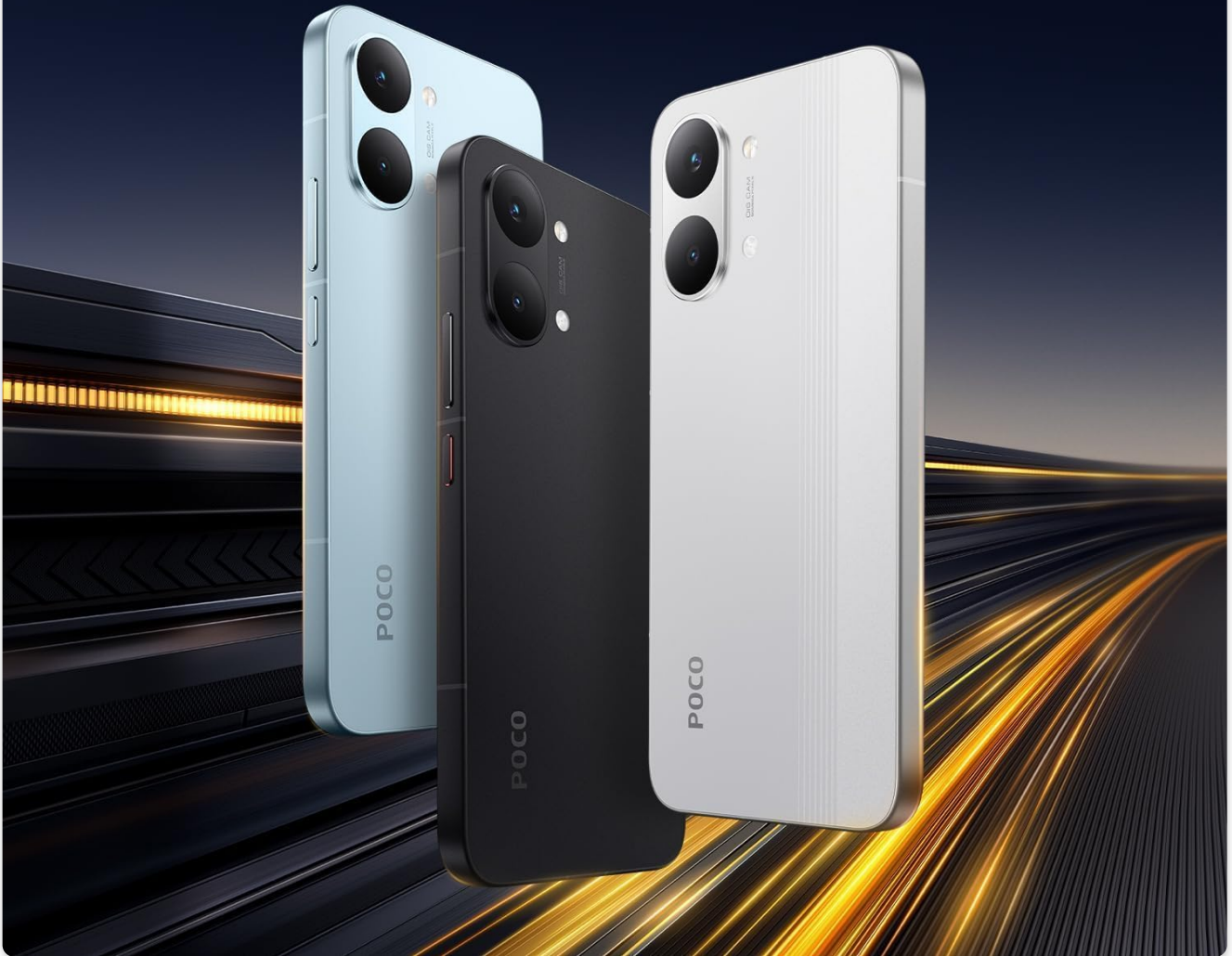
Figure 2: XIAOMI POCO X8 Pro Max 5G Smartphones (Multiple Colors)