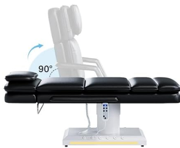
Backrest Recline Adjustment