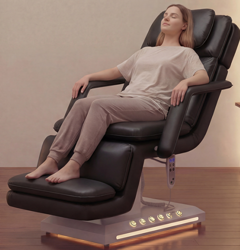
Figure 3.7: An ergonomic electric massage table featuring supportive armrests and leg section alignment, designed to promote natural body alignment and comfort during treatments.