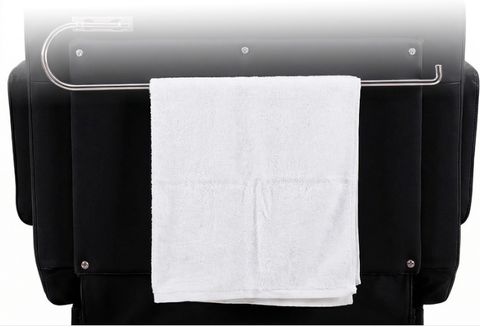
Figure 3.9: A professional spa bed featuring a rear-mounted stainless steel towel bar, designed for efficient daily workflow and convenient access to linens.

Rear-mounted stainless steel towel bar for daily workflow efficiency