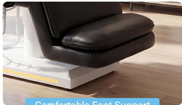
Figure 3.5: The massage table designed for flexible comfort, highlighting its removable headrest and armrests, as well as comfortable foot support for clients.