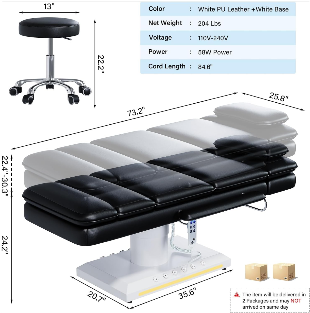
Figure 1.1: Overview of the HolaiNail Electric Massage Table and included rolling stool, showing key dimensions and specifications such as color, net weight, voltage, power, and cord length. The table is shown in black with a white base, and the stool is black.