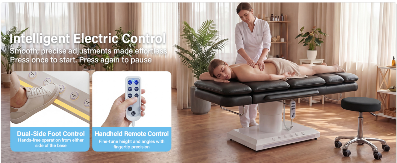
Figure 3.4: An electric spa bed demonstrating control options, including dual-side foot pedals for hands-free operation and a handheld remote for precise adjustments, enhancing efficiency during treatments.