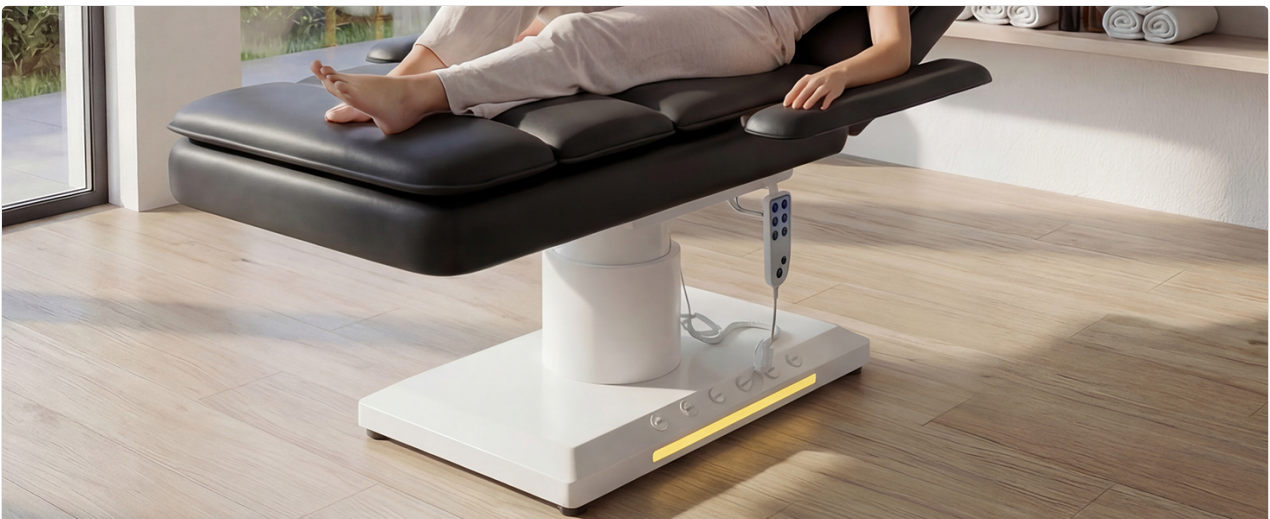
Figure 1.2: An extra-wide electric massage table designed for full body relaxation and premium client comfort, featuring a plush black surface.