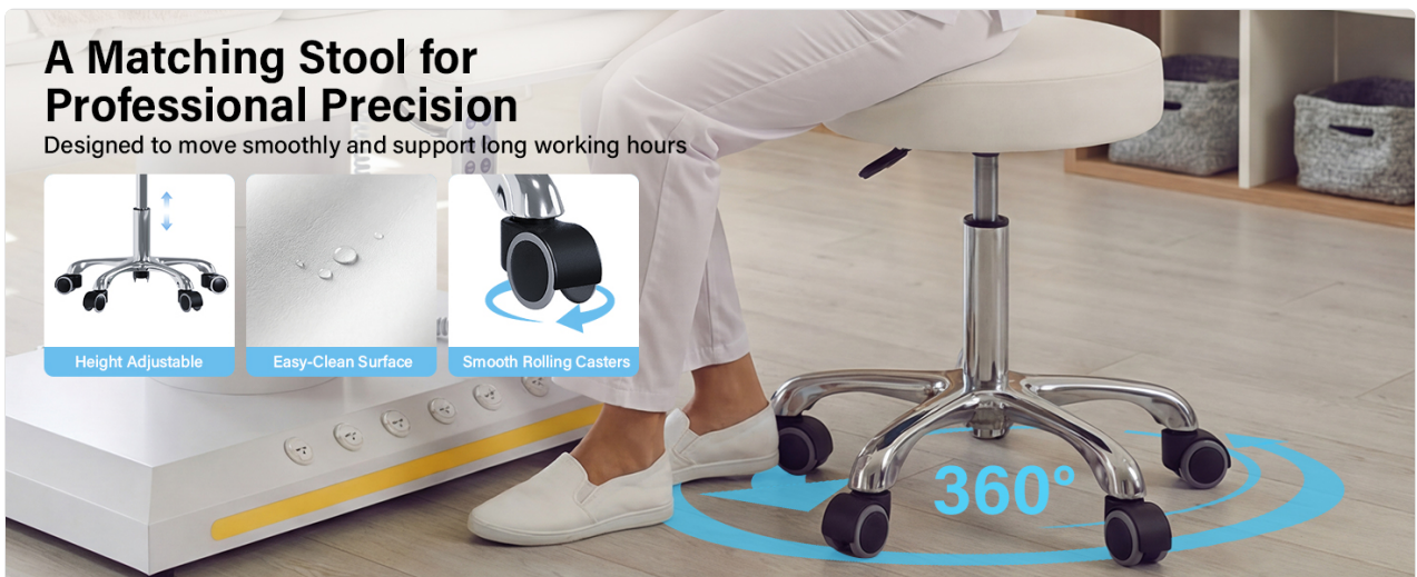
Figure 3.8: A height-adjustable rolling stool designed for esthetician comfort and precise spa work, featuring smooth casters for mobility and an easy-clean surface.