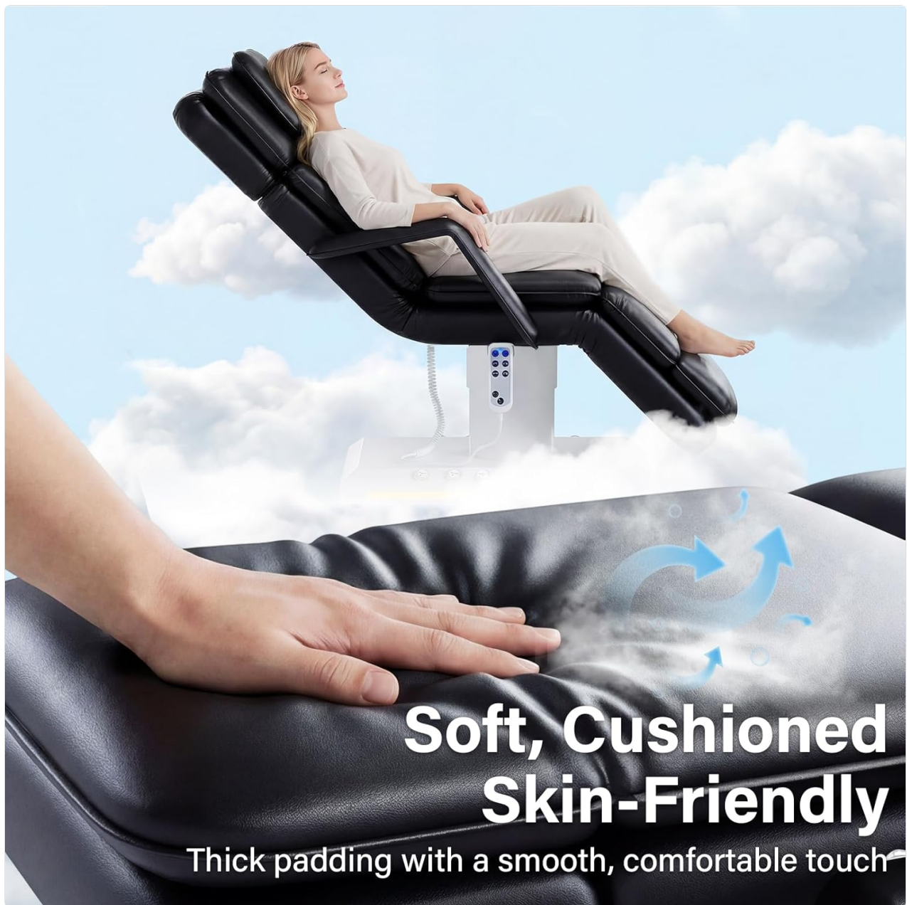
Figure 4.1: Close-up of the soft, cushioned, and skin-friendly surface of the massage table, highlighting its thick padding and smooth, comfortable touch, which is also easy to clean.