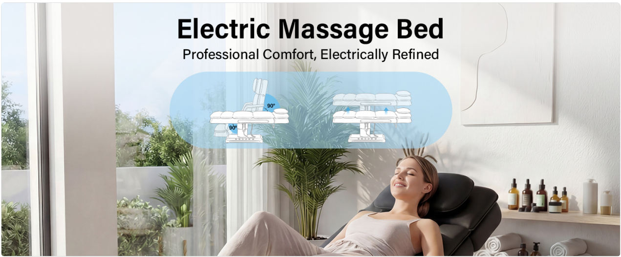
Figure 3.2: An electric massage bed shown with adjustable height and backrest, suitable for professional spa and salon use. The image highlights the bed's versatility in positioning.

Professional Comfort, Electrically Refined