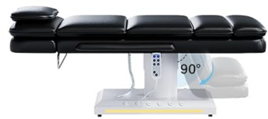
Leg Angle Adjustment