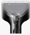
Standard Stain Brush x1