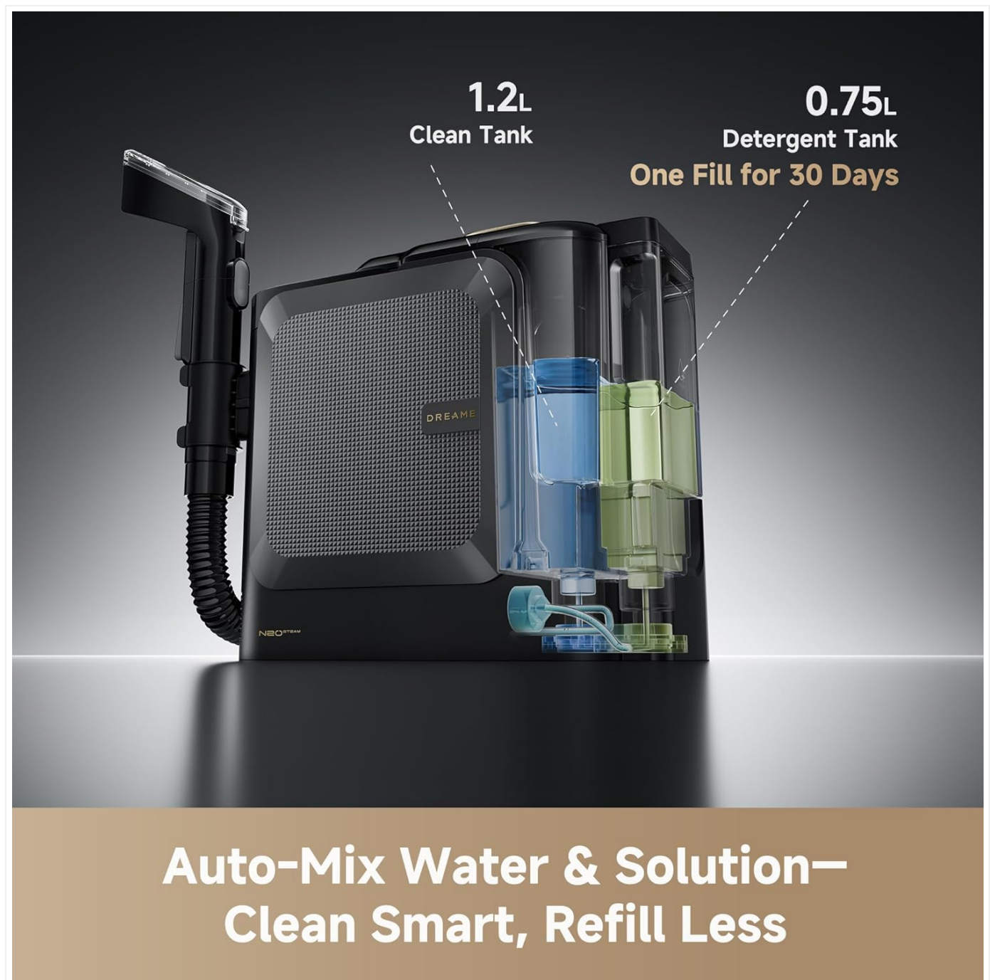
Image: The DREAME N20 unit showing the separate clean water and detergent tanks, ready for filling.