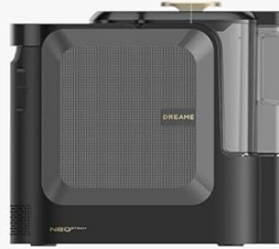
Main Body x1