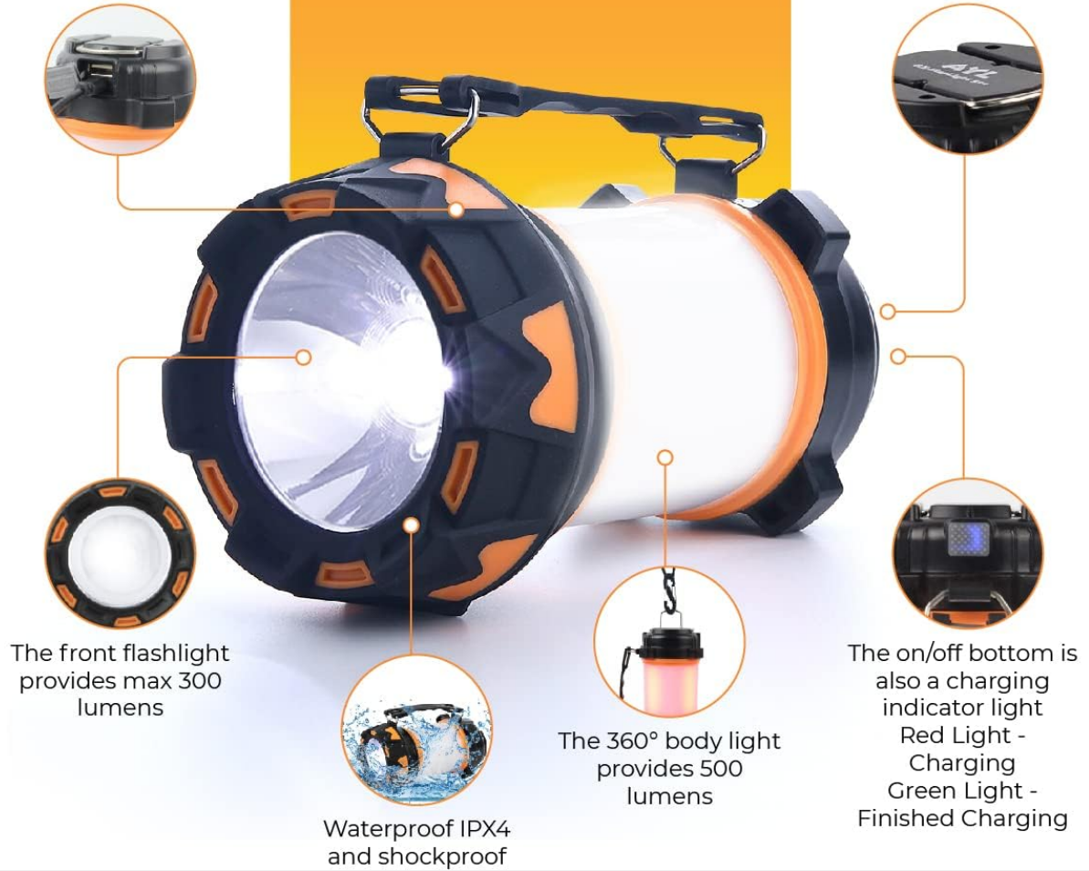
Figure 2: The lantern's versatile carrying and hanging options.

It has built-in 4000mAh rechargeable battery