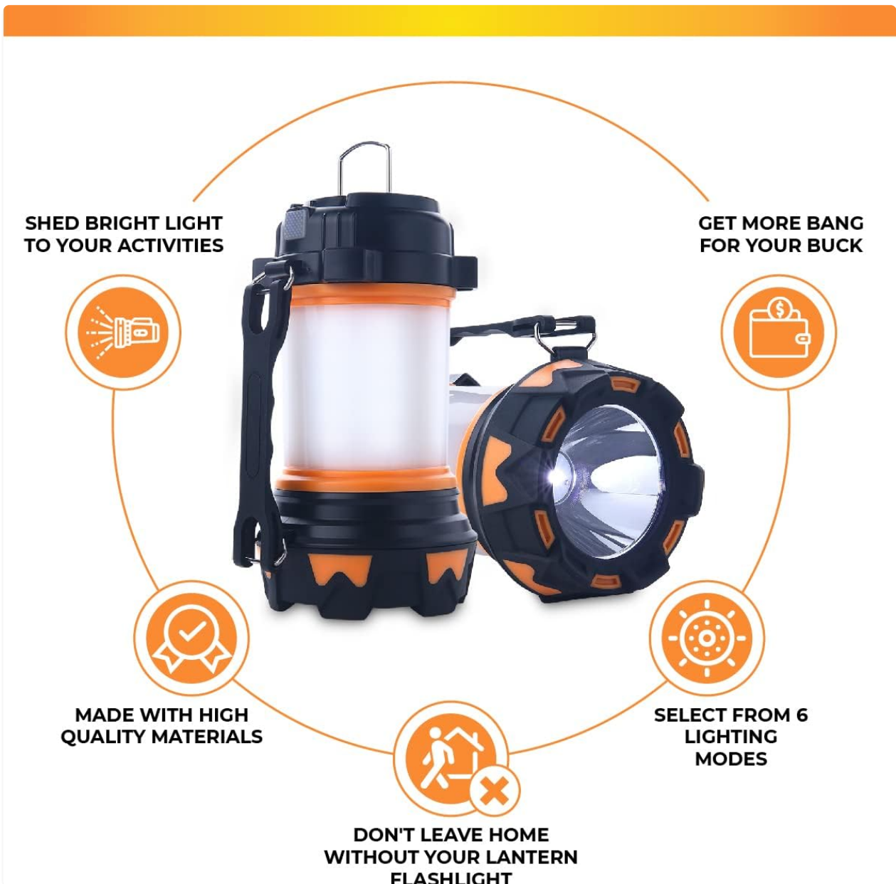
Figure 4: Demonstrating the flashlight and lantern illumination.

Your browser does not support the video tag. This video demonstrates the various lighting modes and features of the AYL LED Camping Lantern, including its foldable panels and power bank function.