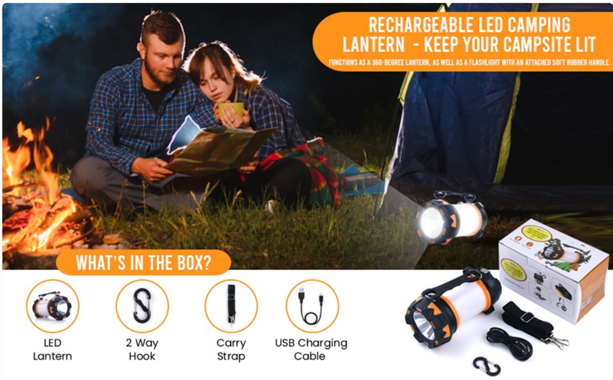
Figure 1: Included items in the AYL LED Camping Lantern package.