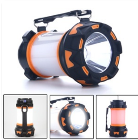
Figure 6: Using the lantern as a power bank.