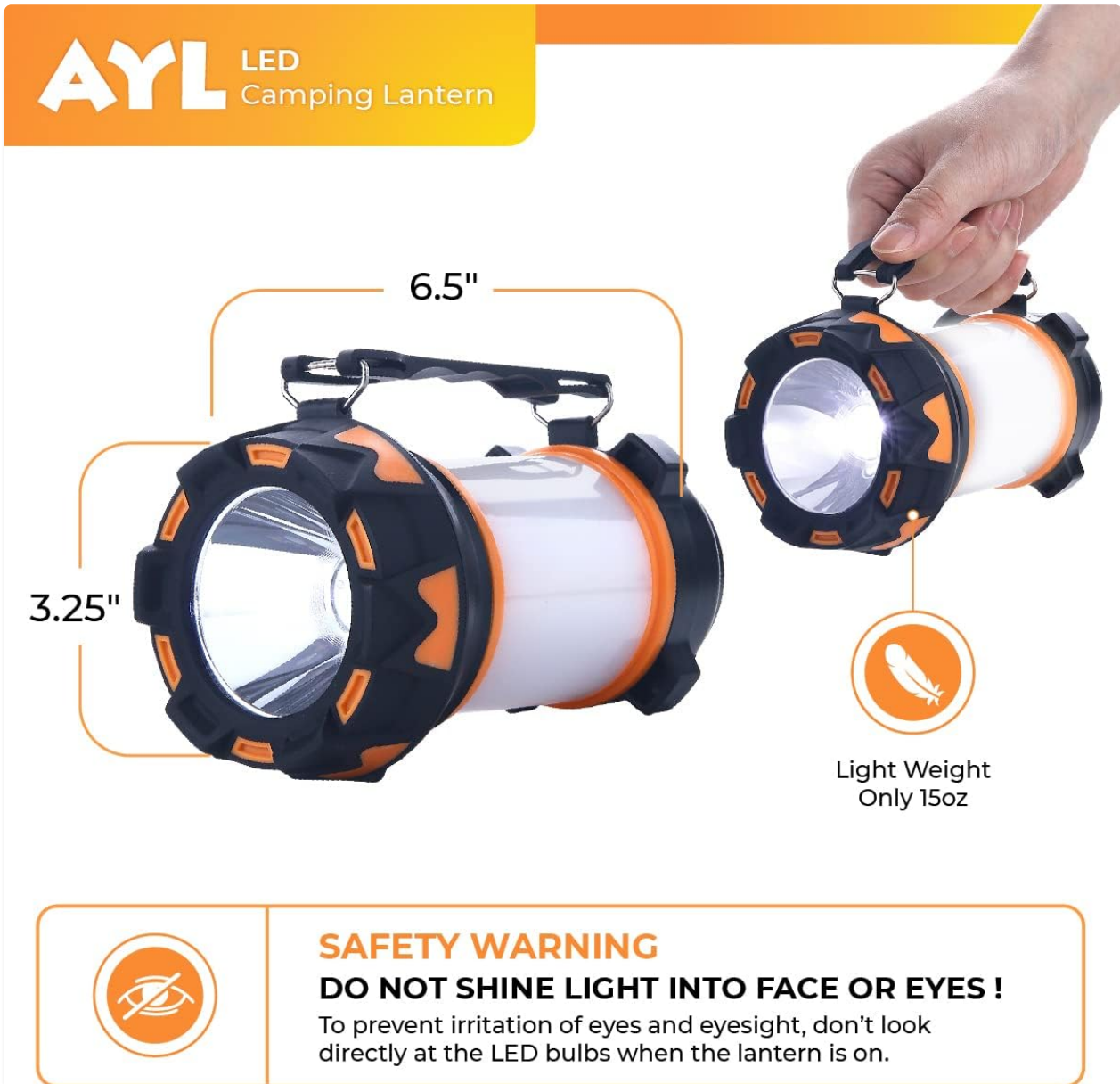
Figure 3: Compact design and dimensions of the lantern.