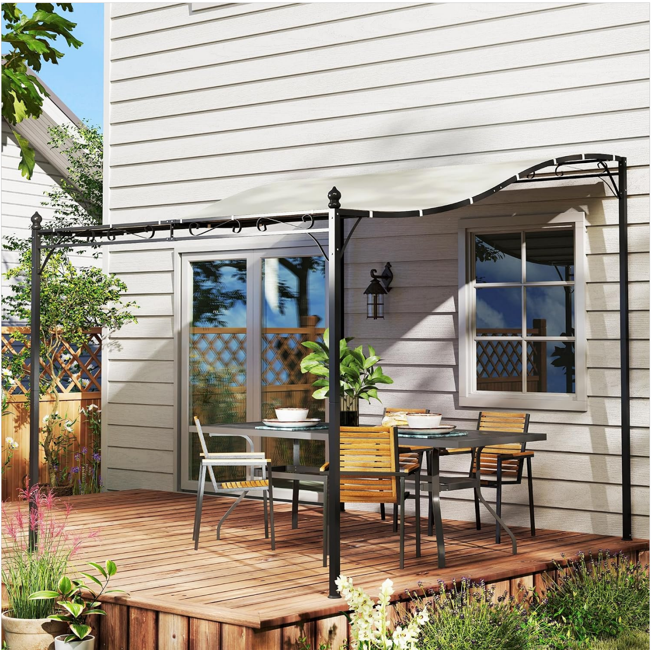
Image 4.3: The pergola creating a comfortable outdoor dining area.