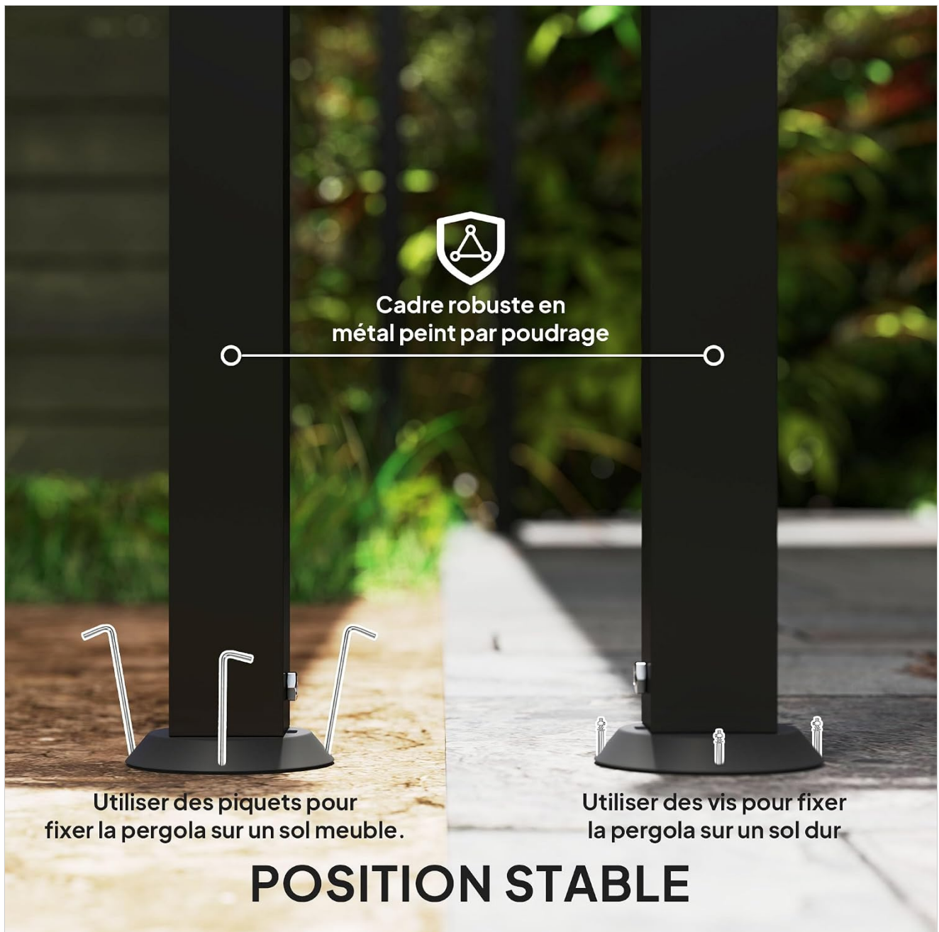
Image 2.1: Illustration of stable positioning using ground stakes for soft ground and expansion screws for hard ground.