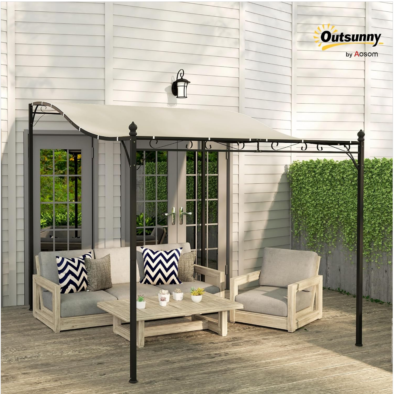
Image 1.1: The Outsunny Garden Pergola providing shade over a seating area on a wooden deck.