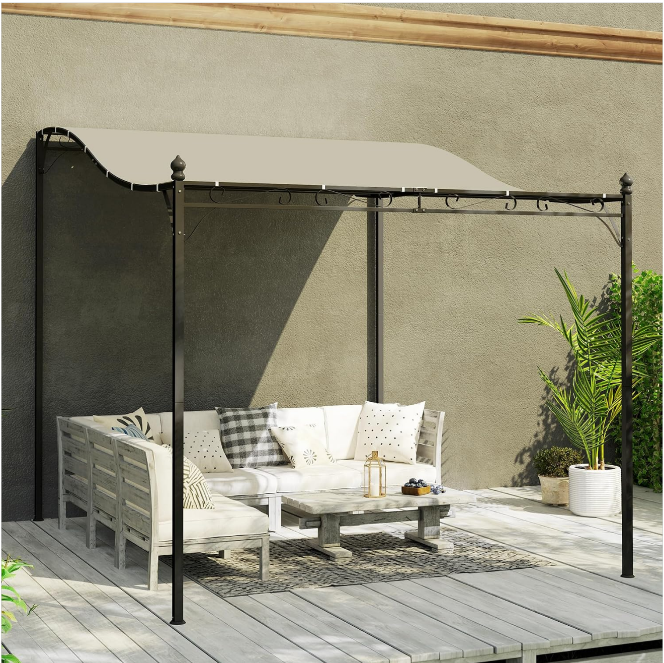
Image 1.2: Another view of the Outsunny Garden Pergola enhancing an outdoor living space.