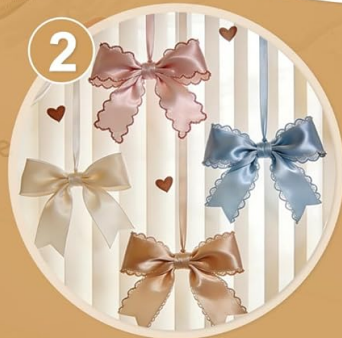
- Ribbons -