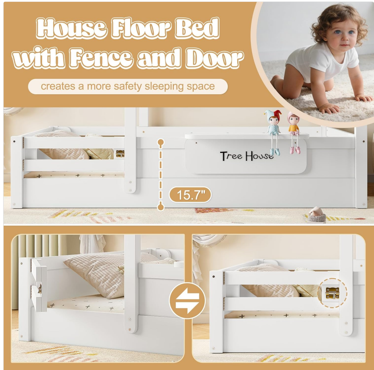
Image 3.1: Angled view of the bed frame, highlighting the roof and fence components.

Ensure all screws and bolts are securely tightened after each step. Do not overtighten to avoid damaging the wood.