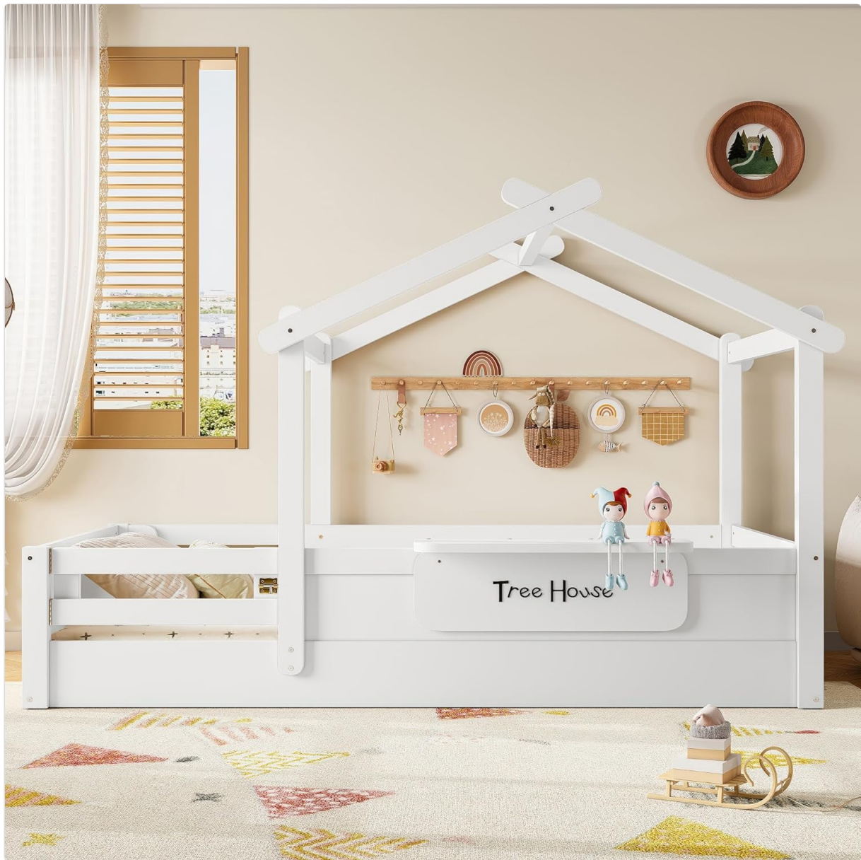
Image 2.1: Side view illustrating the safety fence and low profile of the bed.