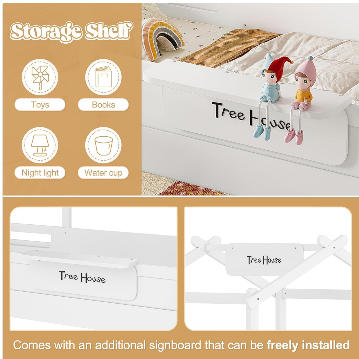
Image 4.2: The bed's playhouse design, showing potential for decoration.