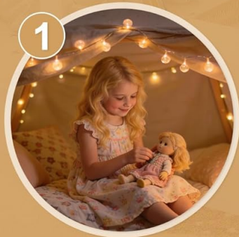
- Tent -