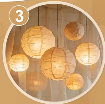
- Lanterns -