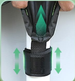
Anti-Slip Straps Widened 2.5cm

Helps distribute weight and reduce strain.