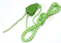
4x Locking Ratchet Pre-installed the Cover