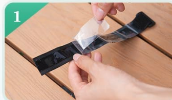
Remove Plastic Film