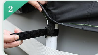
Tie-Down Anti-Slip Straps