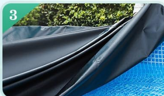
Cover The Pool