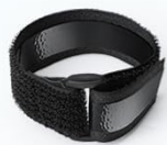
12 x Anti-slip Straps