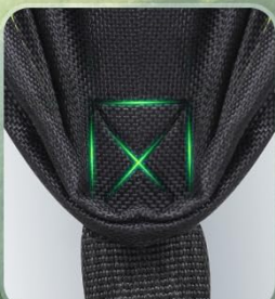
Tear-Resistant Reinforced Seams