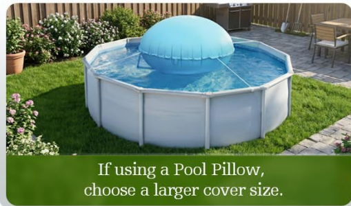
If using a Pool Pillow, choose a larger cover size.

Image: This image illustrates the UV-resistant and fade-resistant properties of the pool cover, showing how it prevents the pool from turning green and reduces water evaporation.