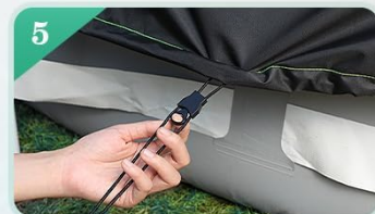
Tighten the Drawstring

Image: A step-by-step visual guide demonstrating the installation process of the pool cover, from attaching anti-slip straps to tightening the drawstring and ratchet locking.