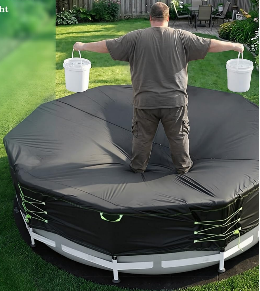
Image: This image illustrates the heavy-duty load-bearing capability of the cover, highlighting the anti-slip straps and tear-resistant reinforced seams, which are important for maintenance checks.