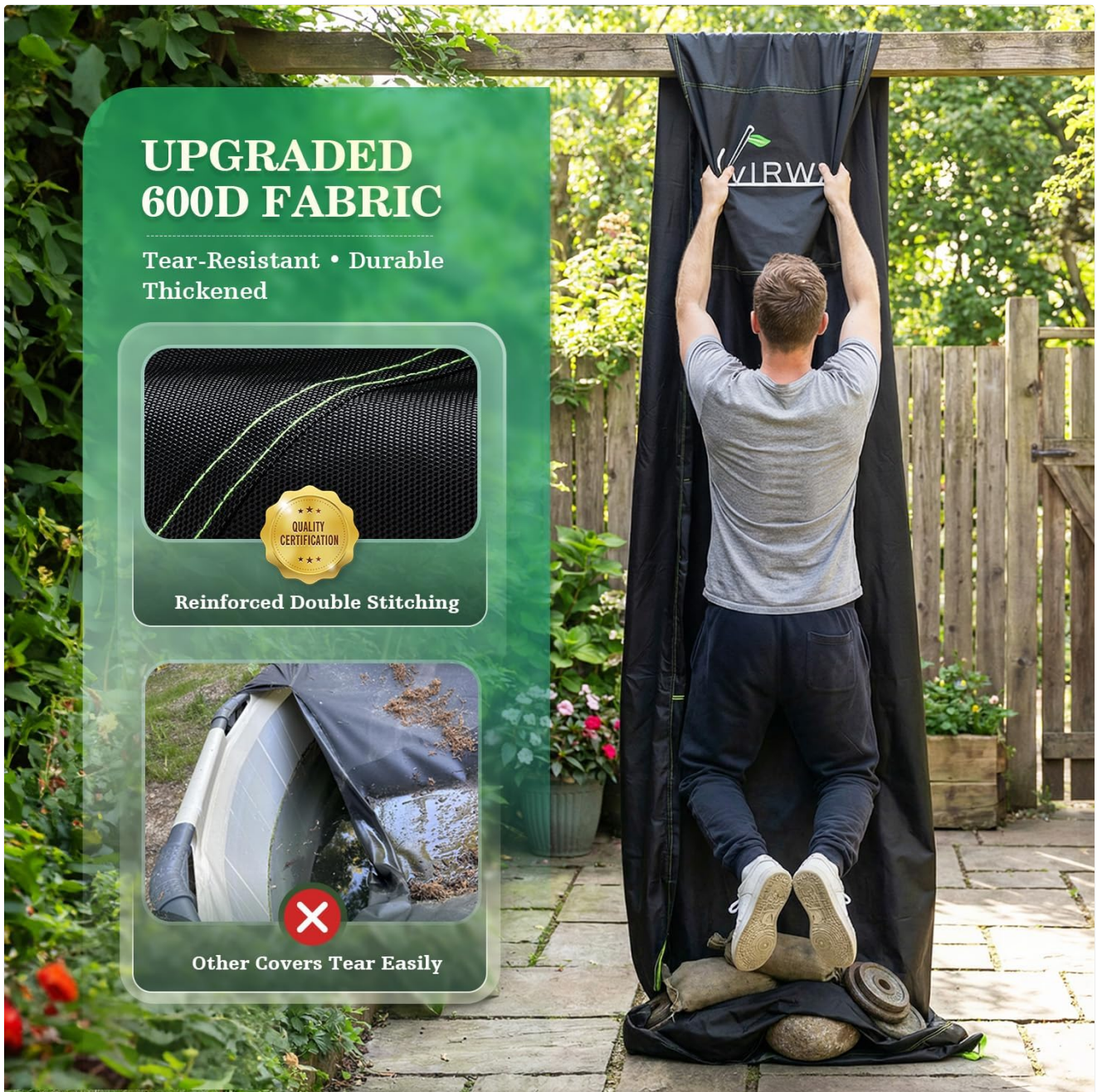
Image: The Uirway 600D pool cover highlights its upgraded 600D fabric, tear-resistant properties, and reinforced double stitching for durability. It contrasts with a torn cover, emphasizing its strength.

Your browser does not support the video tag.