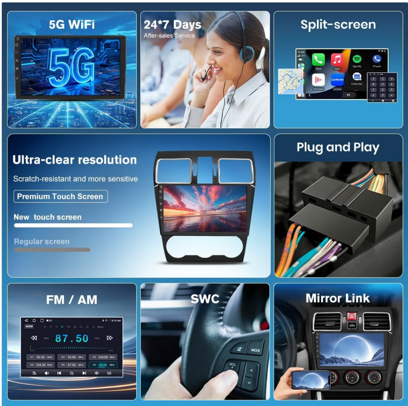
Image: Diagram illustrating how steering wheel controls can be used to manage various functions of the car radio stereo.

Your browser does not support the video tag.