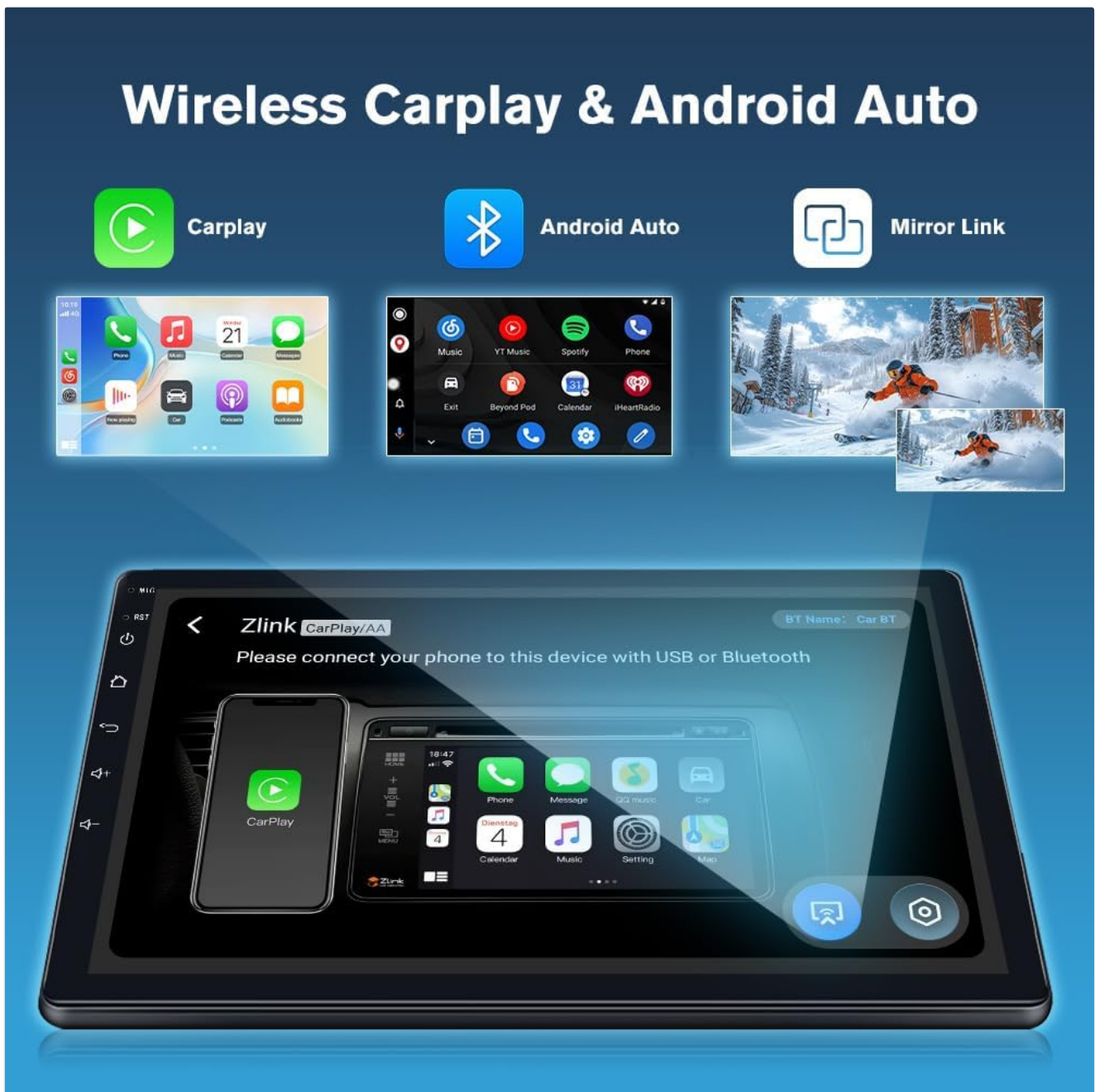
Image: Display showing the Wireless CarPlay and Android Auto interfaces, along with Mirror Link functionality, on the Junsun car radio stereo.

Your browser does not support the video tag.