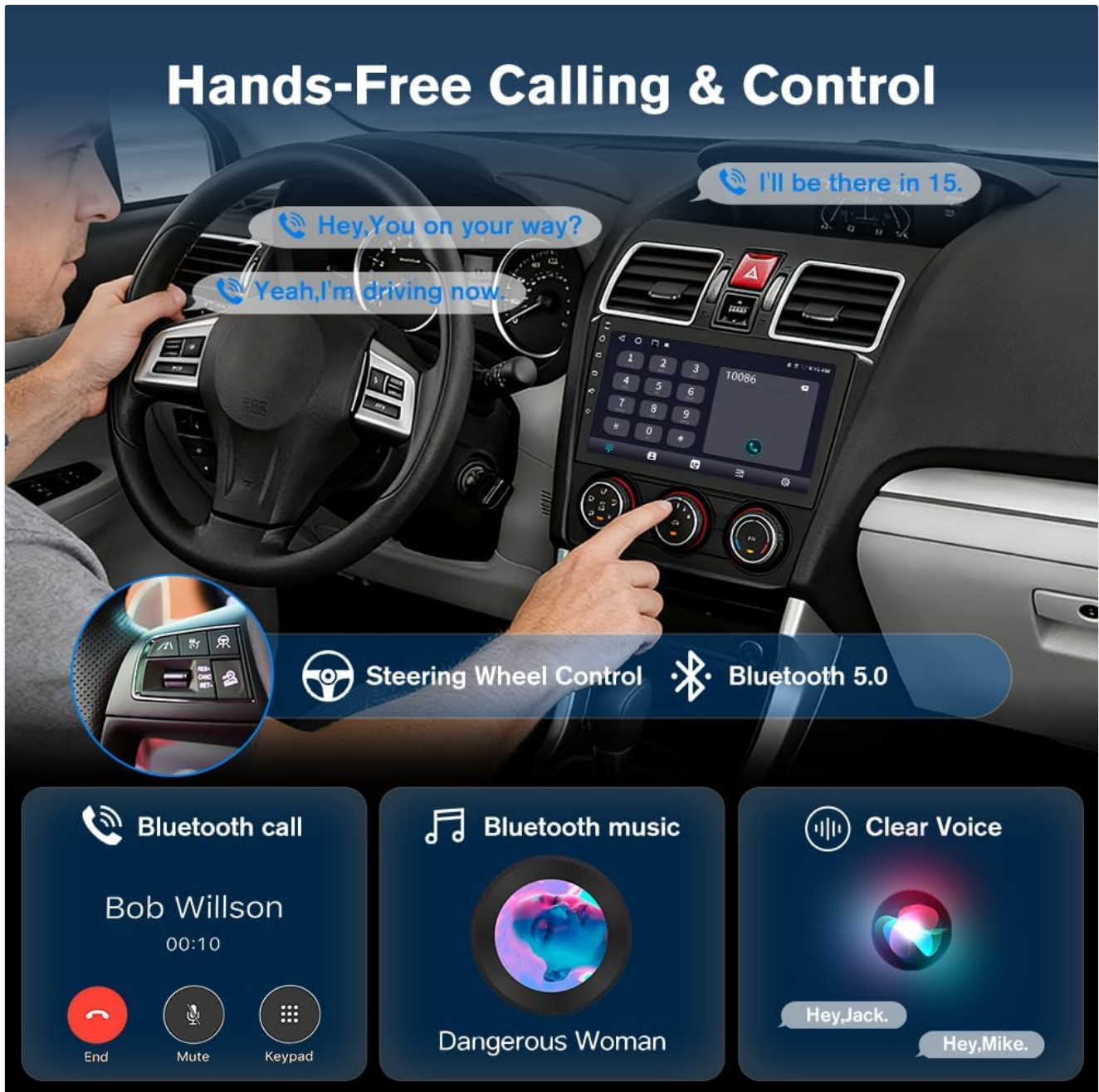
Image: Illustration of hands-free calling and music control using Bluetooth 5.0, integrated with steering wheel controls.

Your browser does not support the video tag.