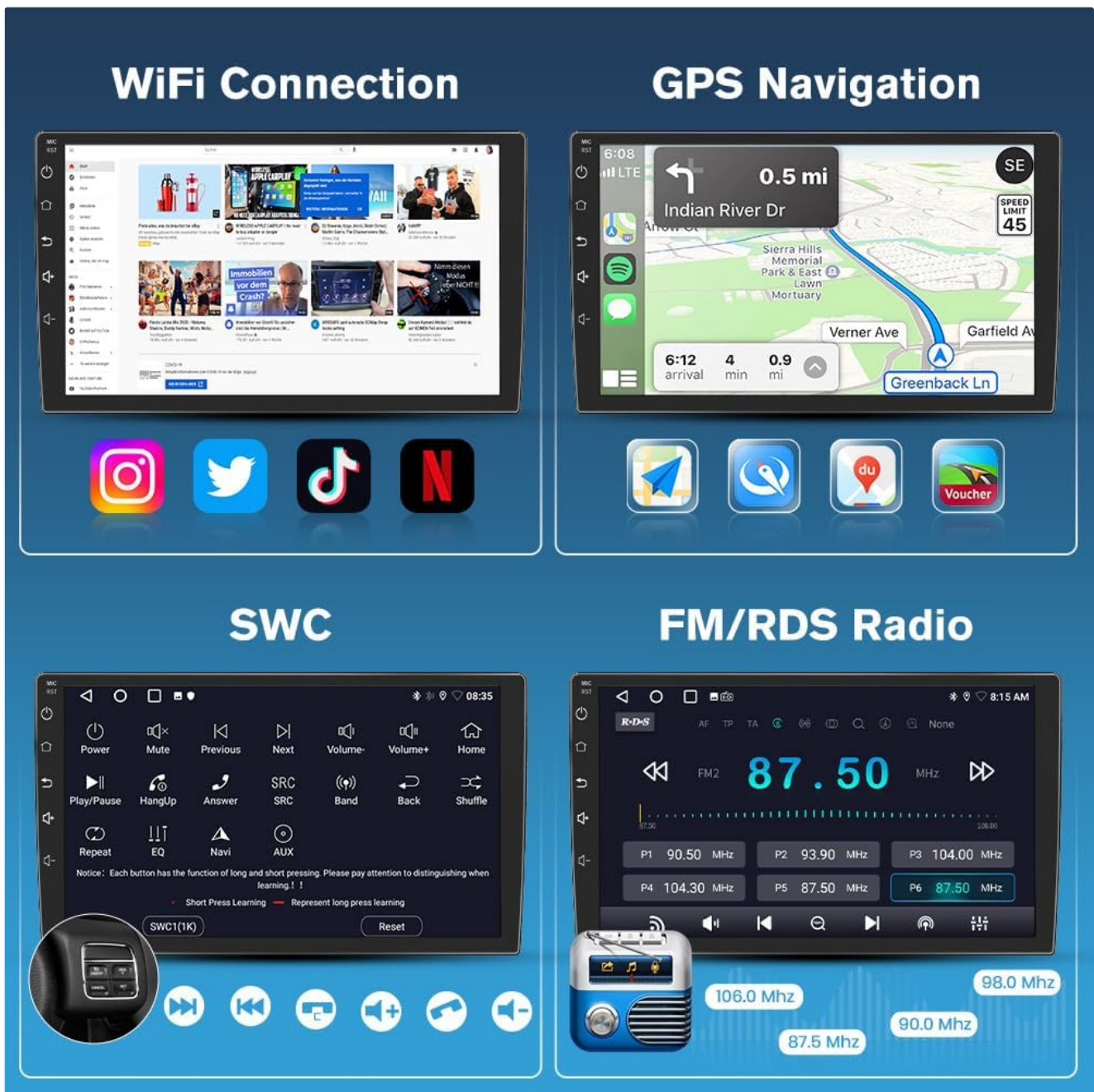
Image: Display showing WiFi connection status and GPS navigation interface with map and route details.

The integrated GPS module supports online navigation and can provide live traffic information. You can also use offline map options.