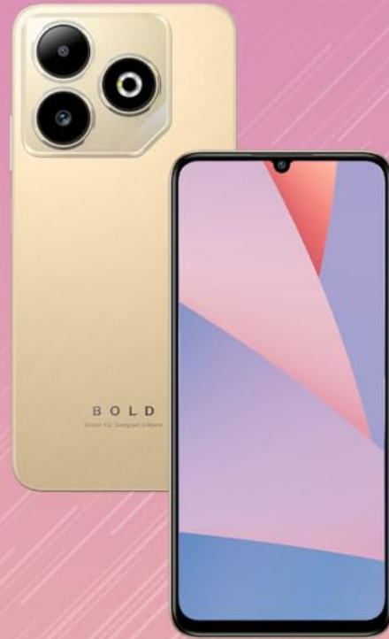
Image: Key specifications of the BLU Bold K12.