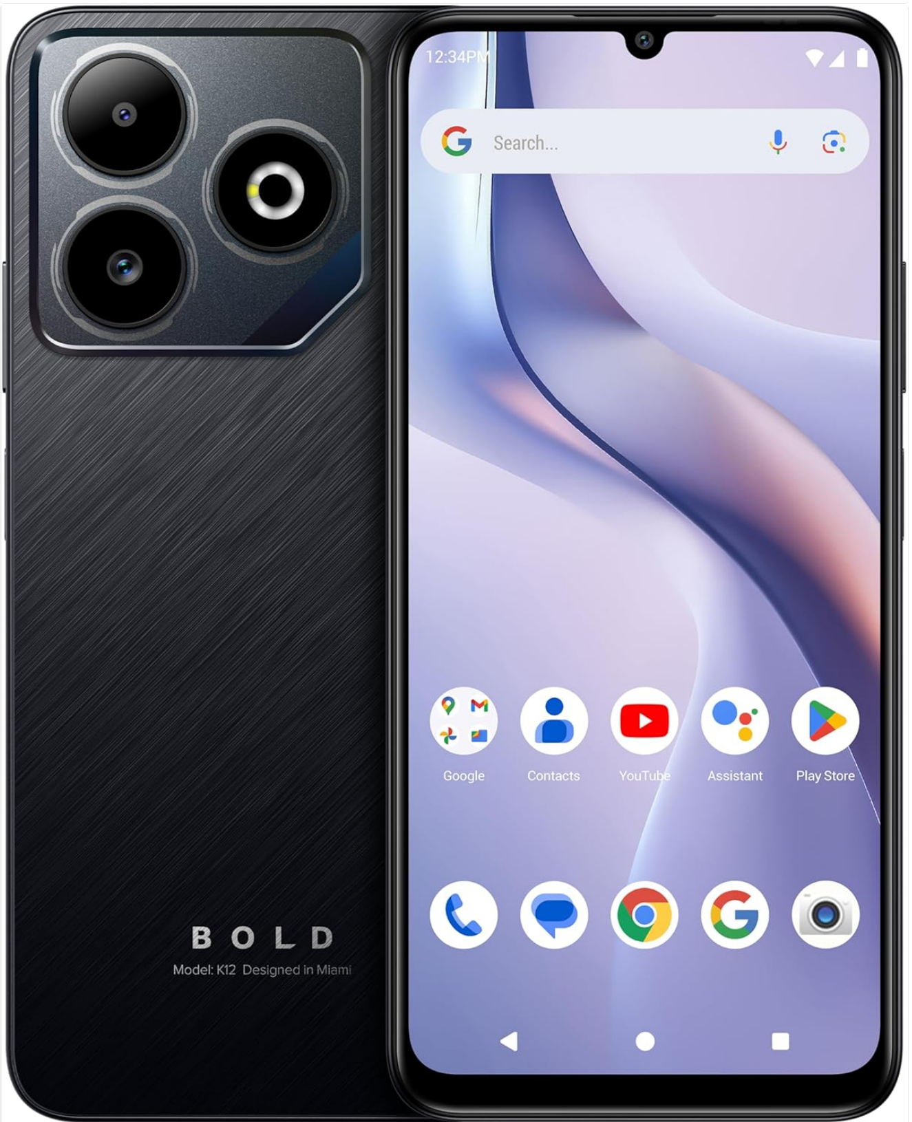
Image: Front and rear view of the BLU Bold K12 smartphone.