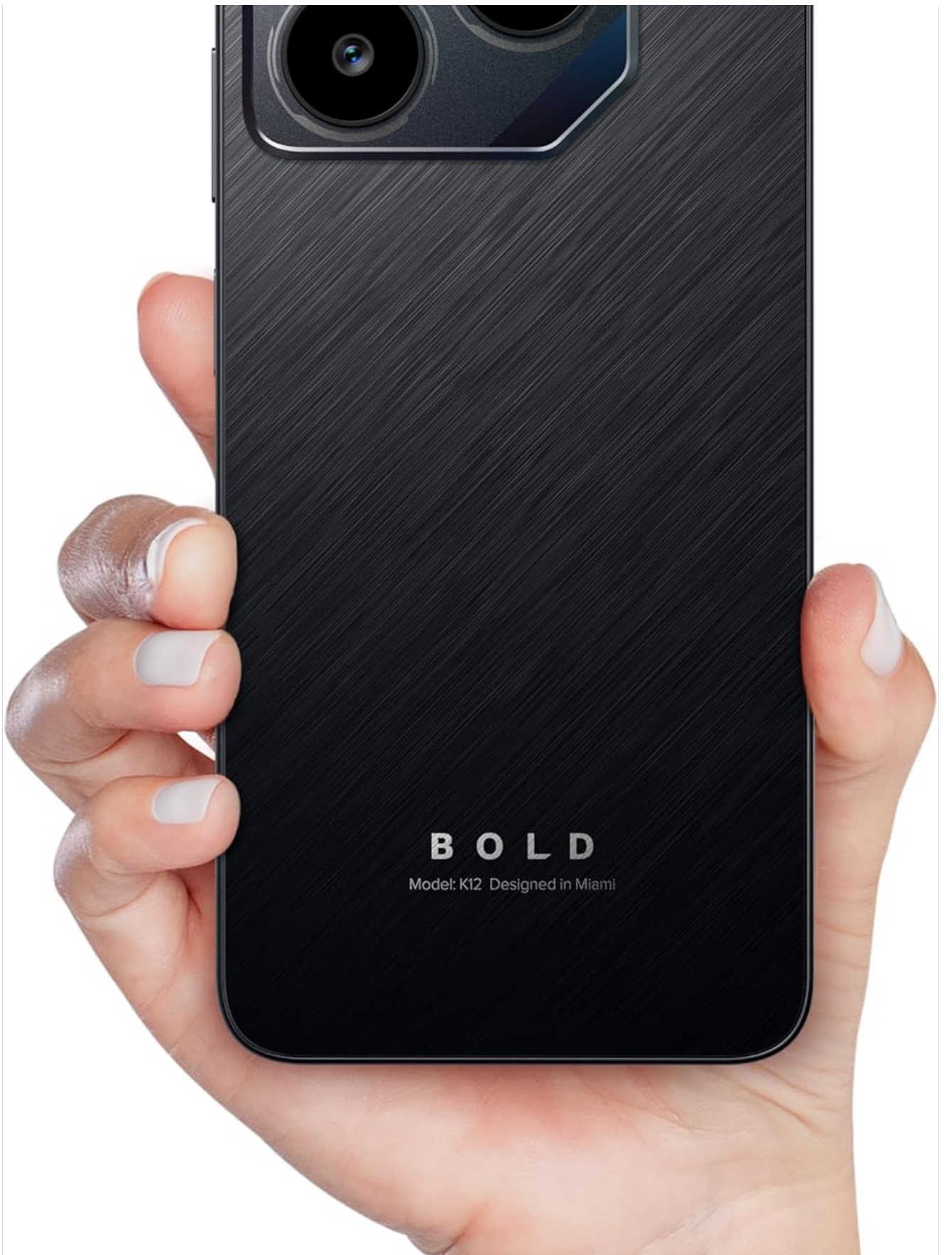
Image: The BLU Bold K12 smartphone comfortably held in a user's hand.