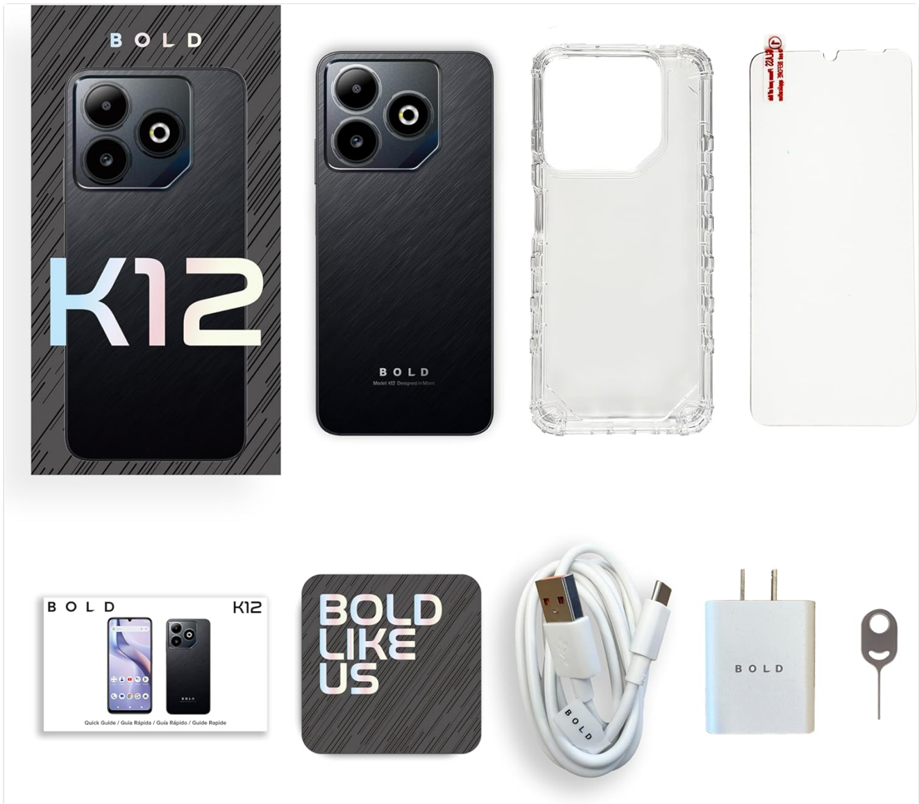
Image: All items included in the BLU Bold K12 retail packaging.