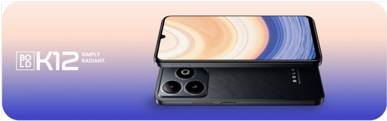
Image: The BLU Bold K12 with its display and rear design.