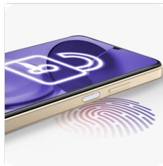
Image: Side-mounted fingerprint sensor icon.

Unlock your phone quickly and securely using the side-mounted fingerprint sensor. You can also set up a PIN, pattern, or password for additional security.