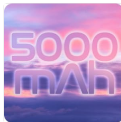
Image: 5000mAh Battery Icon.