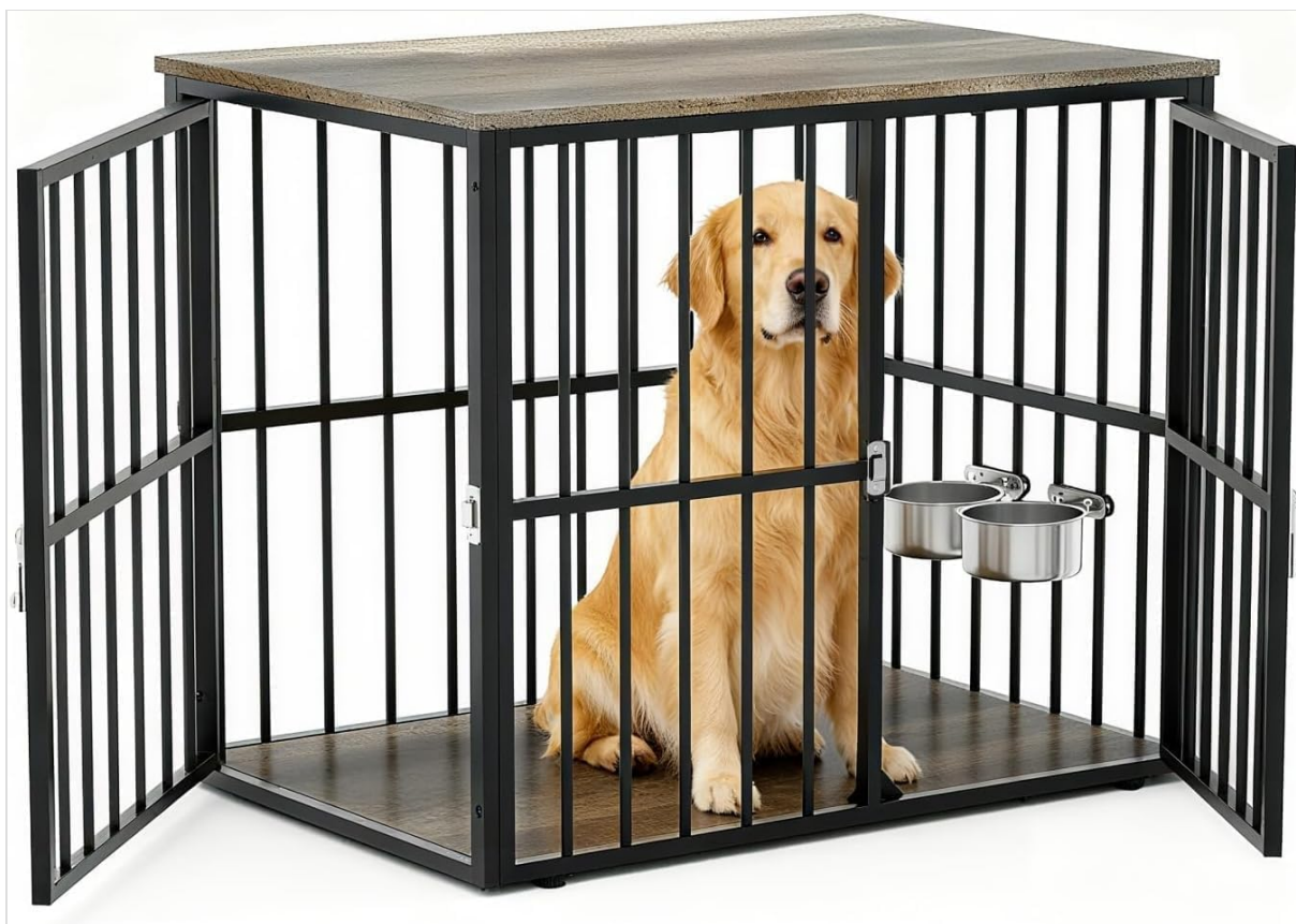
Figure 6: Interior space of the crate with a Golden Retriever.