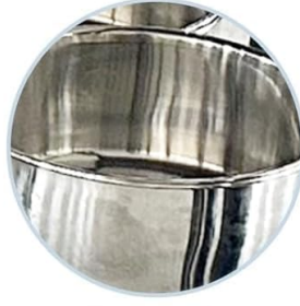
Durable and sturdy