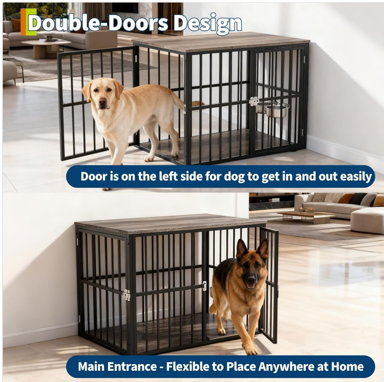
Figure 3: Double-Door Design for easy access and flexible placement.