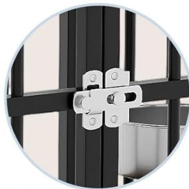
Advanced Security Door Lock