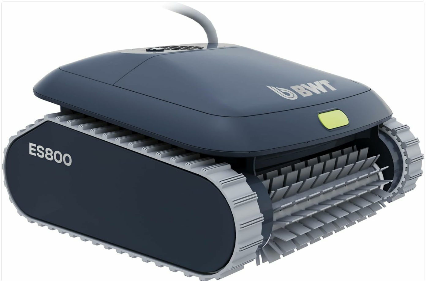
Image: The BWT ES800 Robotic Pool Cleaner submerged in a pool, ready for operation.

Gently lower the BWT ES800 into the pool. Allow it to sink to the bottom. Ensure that all air trapped inside the cleaner is released by gently rocking it from side to side until no more bubbles emerge. Spread the floating cable evenly across the pool surface to prevent tangling.