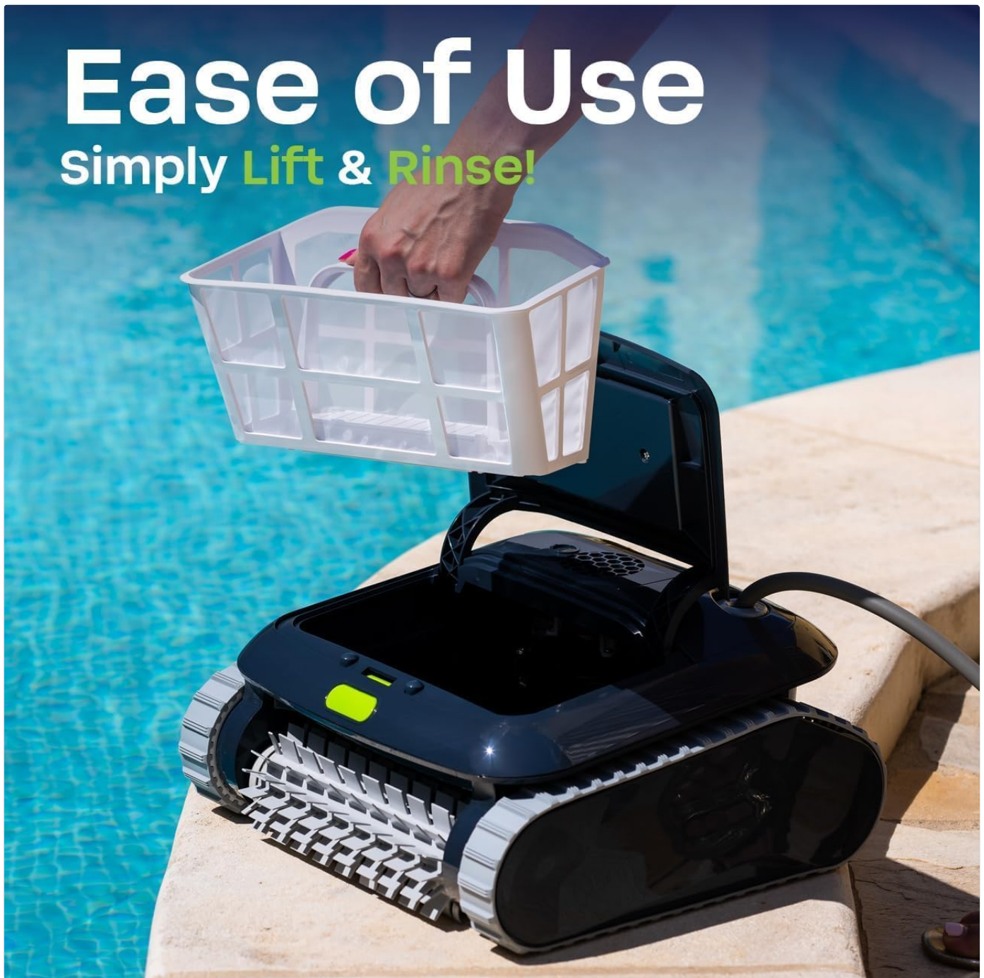
Image: A hand lifting the filter basket from the BWT ES800, illustrating the "Lift & Rinse" ease of use.

5. Reinsert the clean filter basket and close the cover securely.