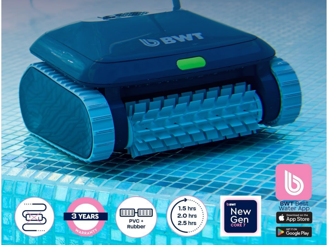
Image: A detailed view of the BWT ES800's PVC brush, designed for effective scrubbing.