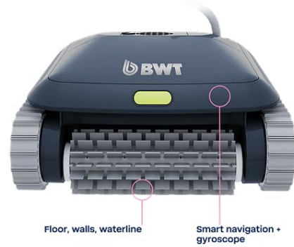
Image: The BWT ES800 Robotic Pool Cleaner highlighting its key features and specifications.