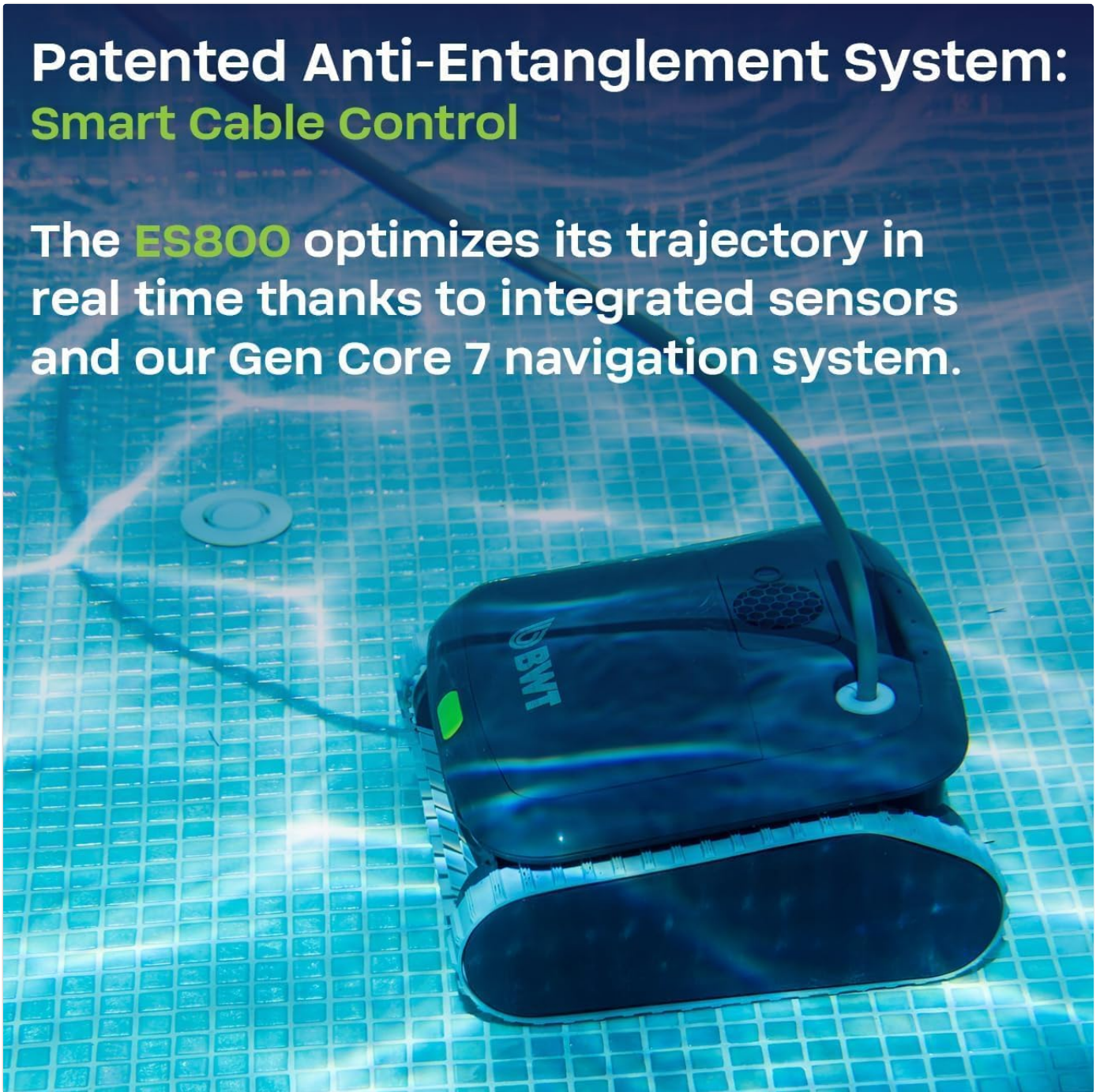
Image: The BWT ES800 cleaner ascending a pool wall, demonstrating its smart cable control and anti-entanglement system.

The ES800 optimizes its trajectory in real time thanks to integrated sensors and our Gen Core 7 navigation system.