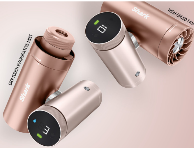
Image: An exploded view of the Shark ChillPill, illustrating the main unit, fan cap, and dry-touch misting pod.