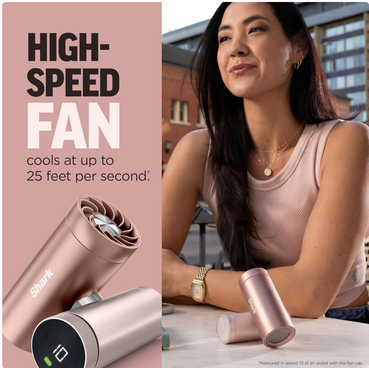
Image: A person using the Shark ChillPill with the fan cap attached, demonstrating its high-speed airflow.

There are 10 speed settings available. Higher speeds provide stronger airflow but may generate more noise.