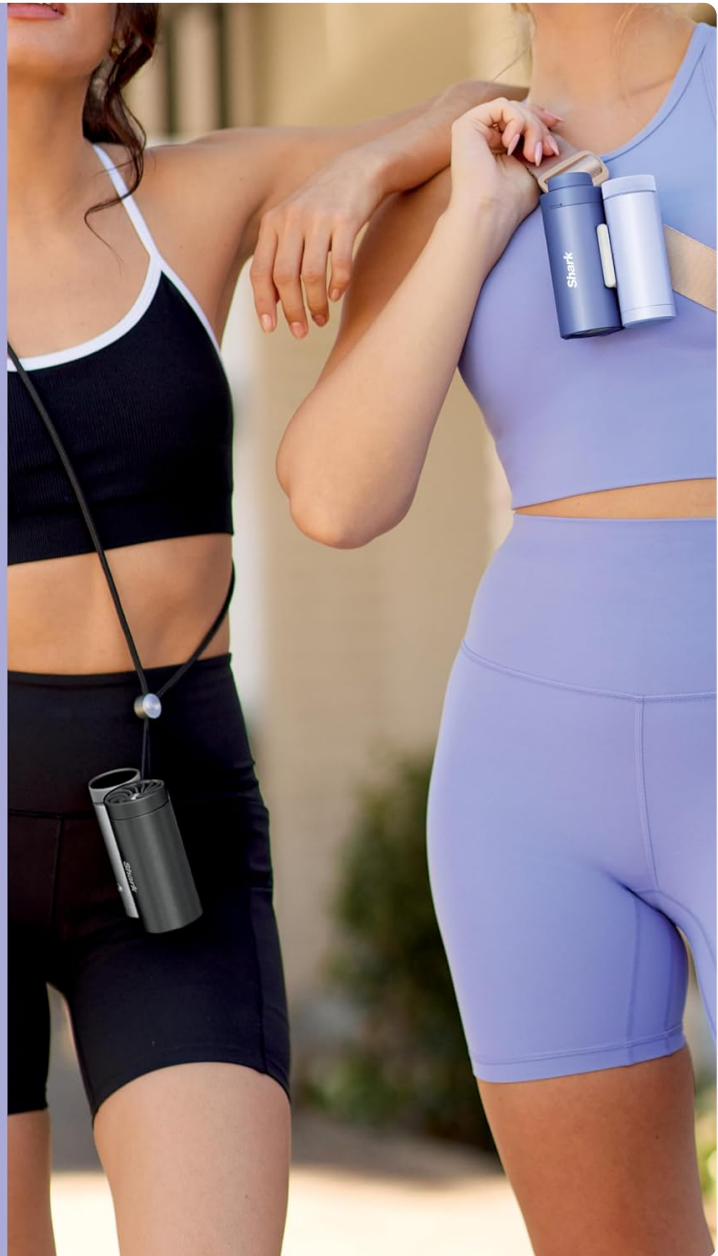
Image: Individuals demonstrating different hands-free methods of carrying the Shark ChillPill, including wearing it and attaching it to clothing.