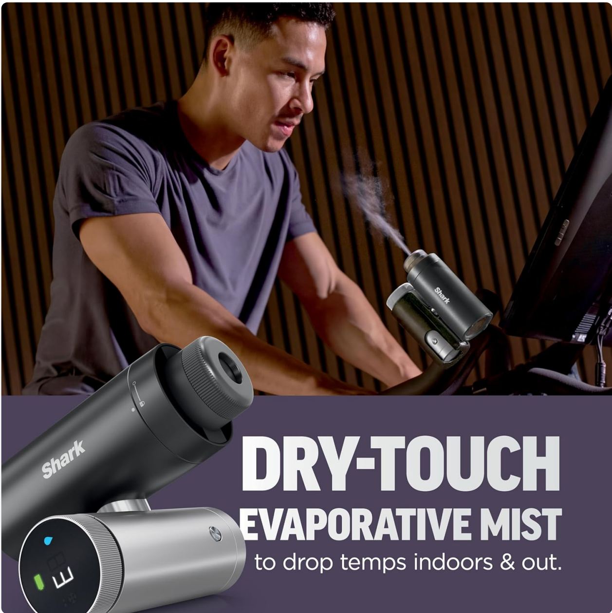
Image: A person using the Shark ChillPill with the dry-touch misting pod, showing the fine mist being emitted.