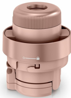
Image: The Shark ChillPill device in Rose Gold, showcasing its compact design.