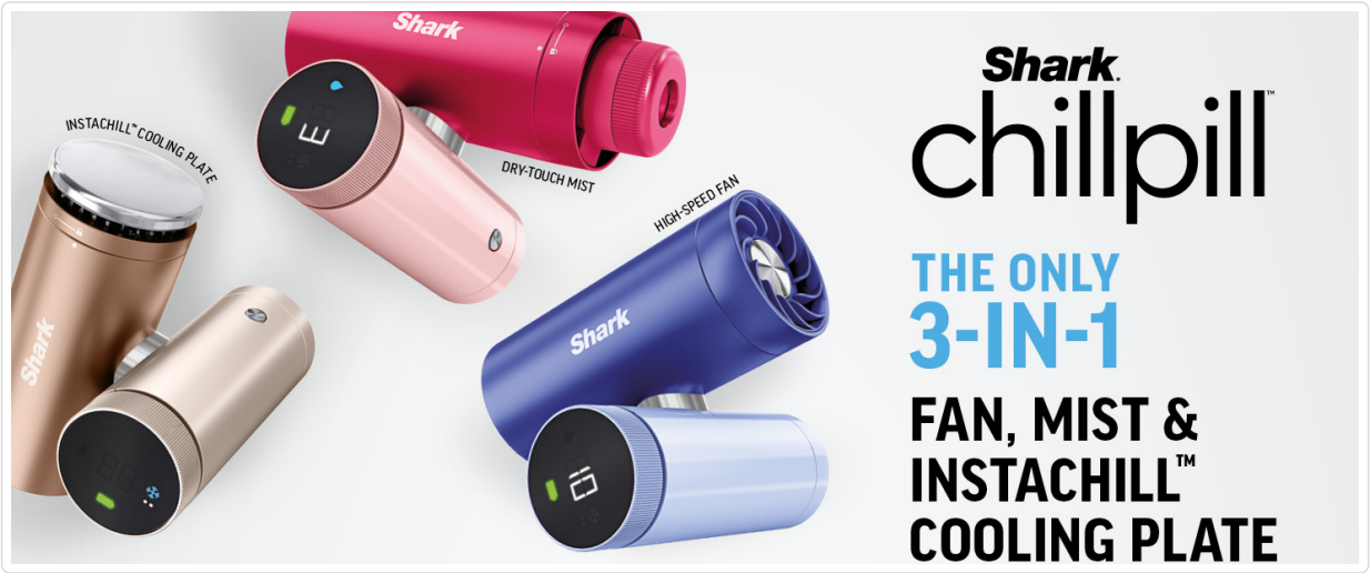
Figure 2: Visual representation of the three core cooling functions.