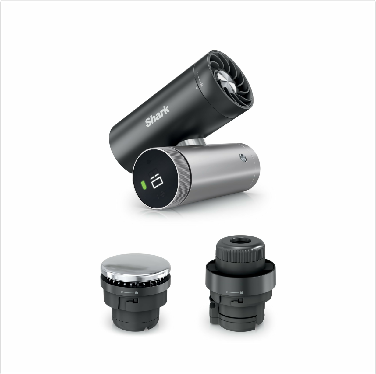
Figure 1: The Shark ChillPill 3-in-1 Personal Cooling System.