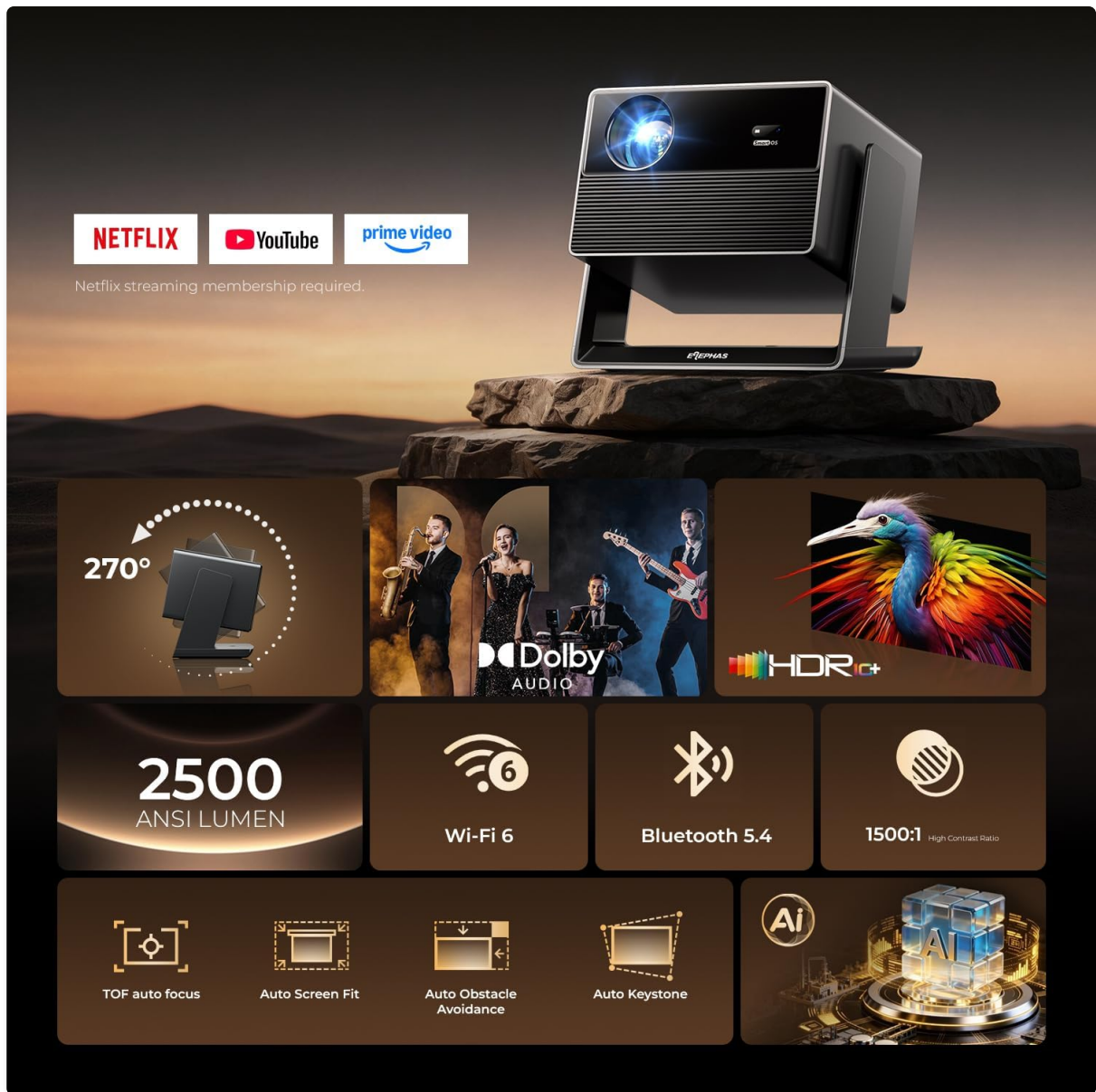
Image 1.1: The ELEPHAS AC401 projector highlighting its 270° rotatable design and smart features.