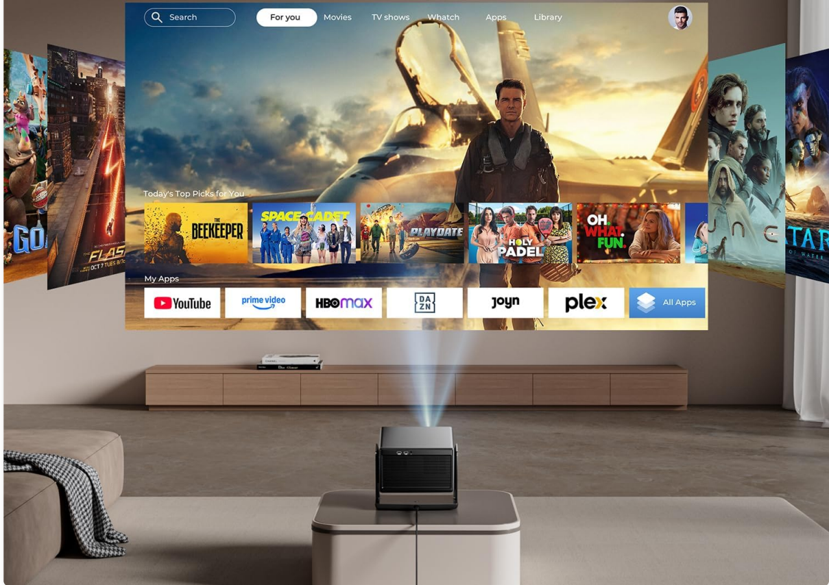
Image 5.1: The projector's smart streaming interface, showing direct access to popular apps.