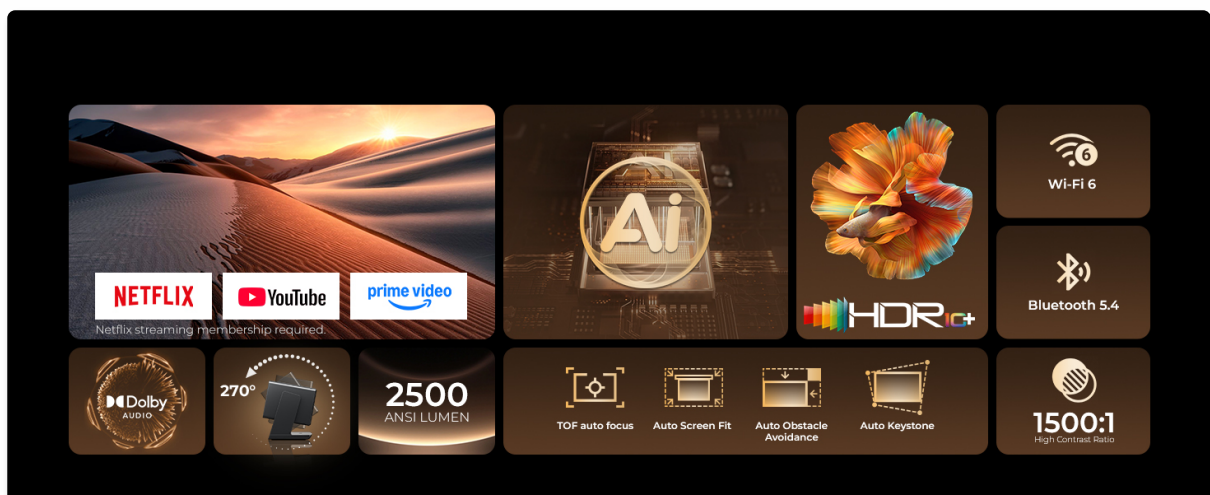
Image 3.1: Key features of the ELEPHAS AC401, including 4K support, AI auto-focus, and 270° rotatable design.