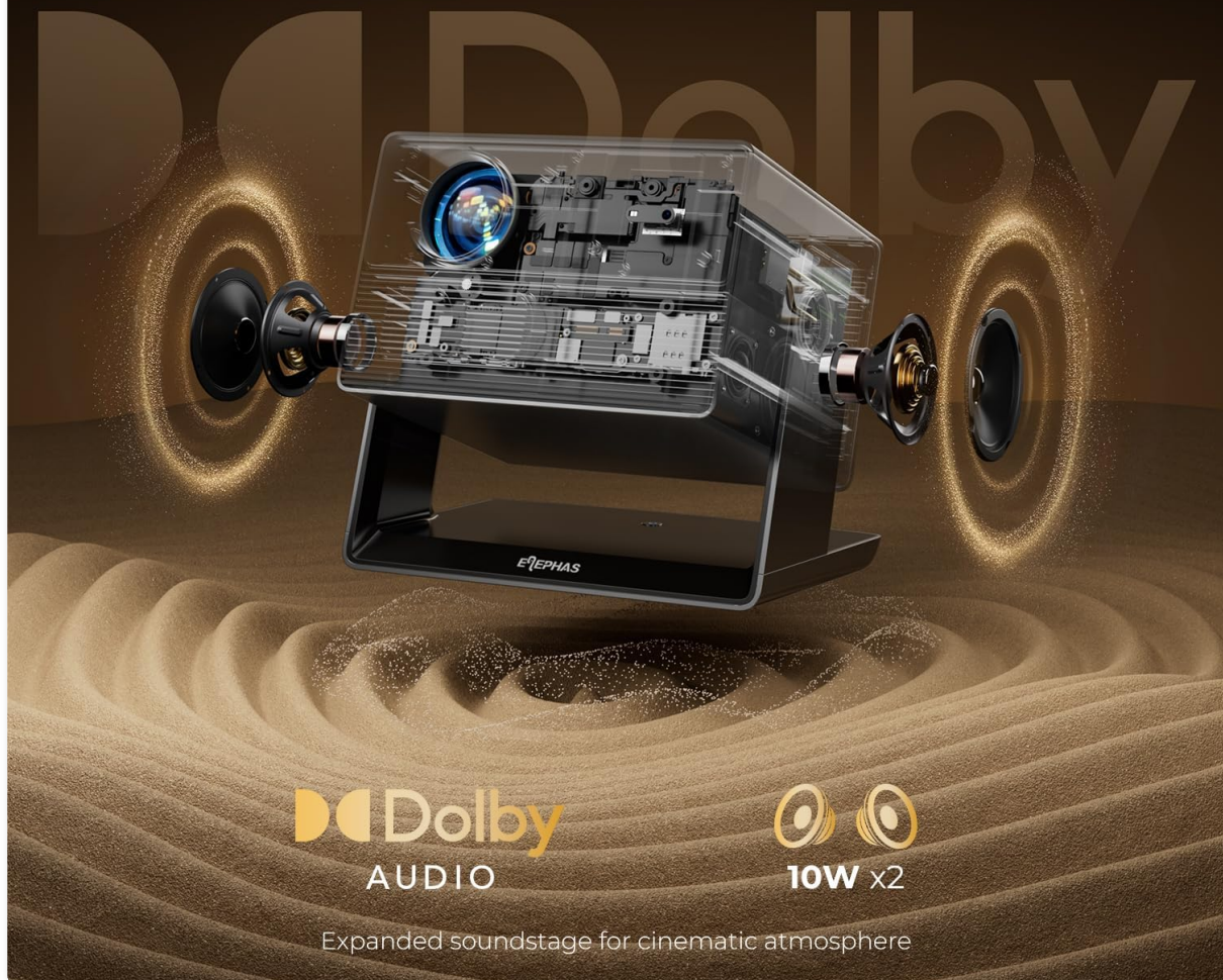
Image 7.1: The projector's internal speaker system with Dolby Audio and dual 10W speakers.

Dual 10W speakers deliver richer sound detail