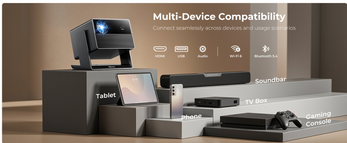
Image 6.1: Overview of multi-device compatibility and connectivity ports.