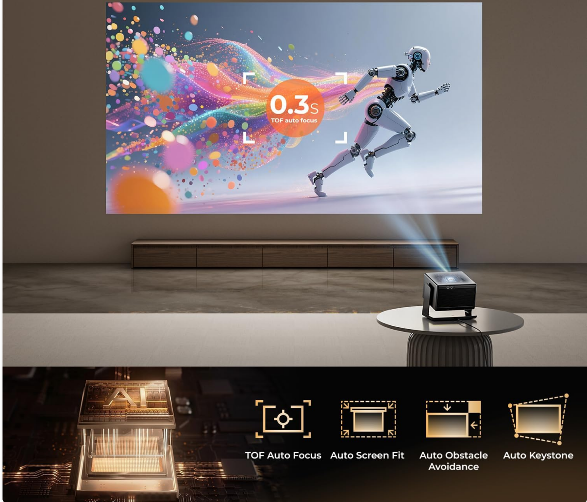
Image 8.1: Visual representation of the AI intelligent algorithm for auto-focus and keystone correction.

Crystal-clear image in just milliseconds