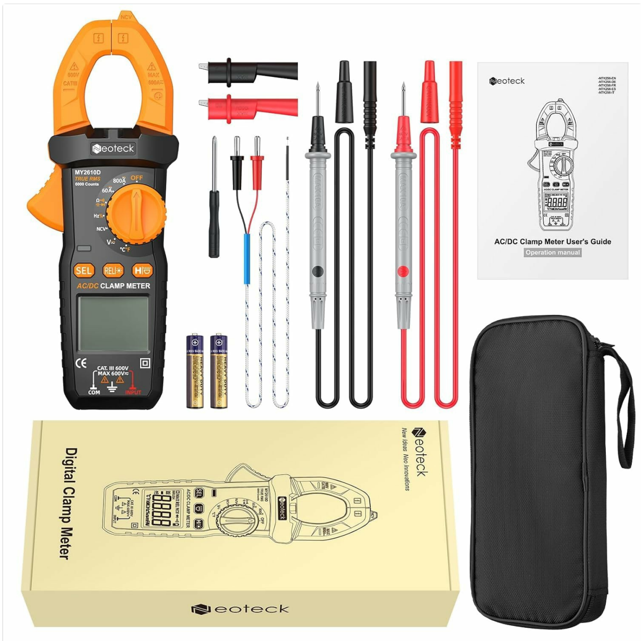
Image: The complete professional kit for the Neoteck Clamp Meter, ready for immediate use.