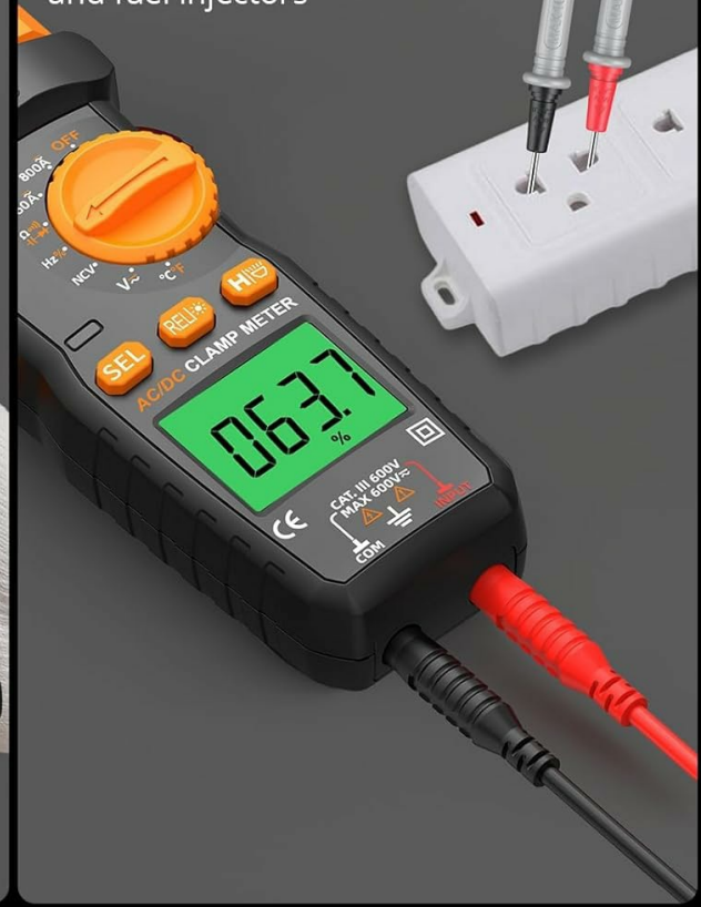
Image: The NCV function in use, detecting AC voltage near an electrical outlet. Also shown is the meter measuring frequency and duty cycle.

Test speed control systems and fuel injectors