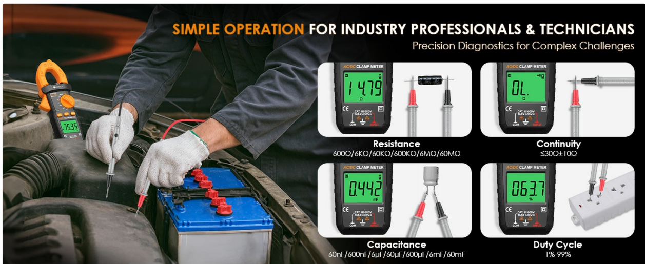
Image: The clamp meter performing various measurements including resistance, diode test, capacitance, and continuity on a test circuit board.