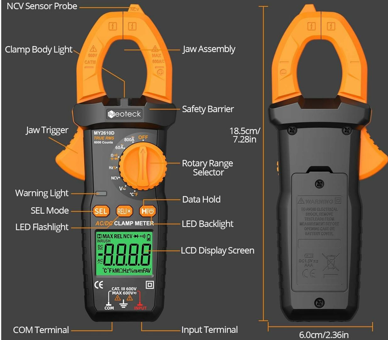
Image: Labeled diagram of the Neoteck Clamp Meter, showing its various components and controls.