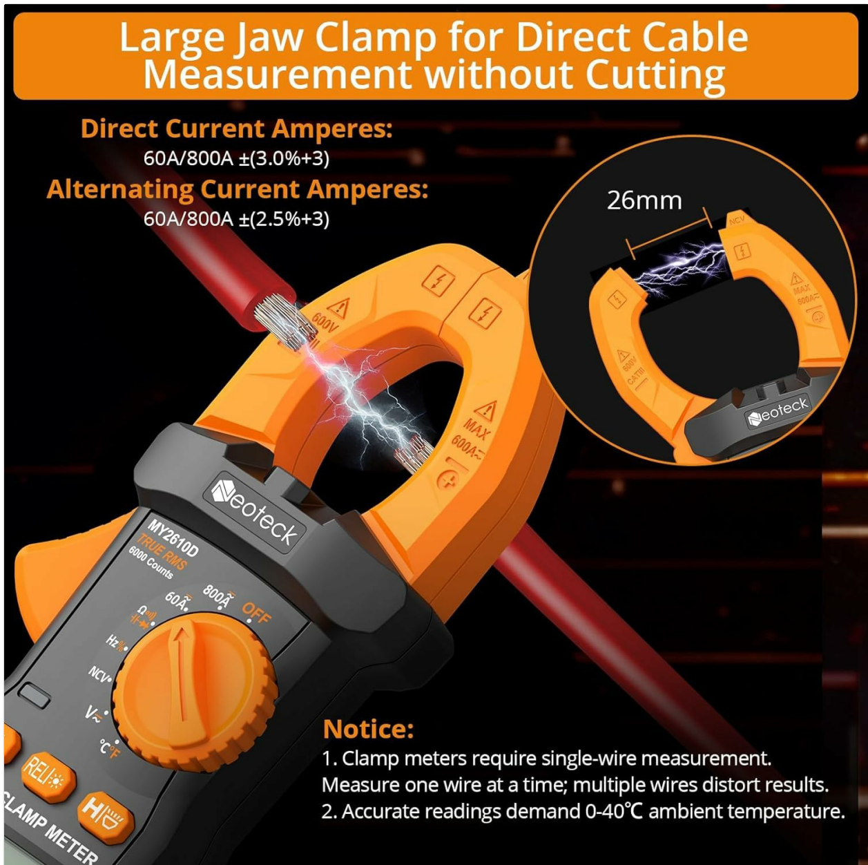
Image: The clamp meter in use, measuring current on a single electrical wire. The 26mm jaw allows for direct cable measurement without cutting.