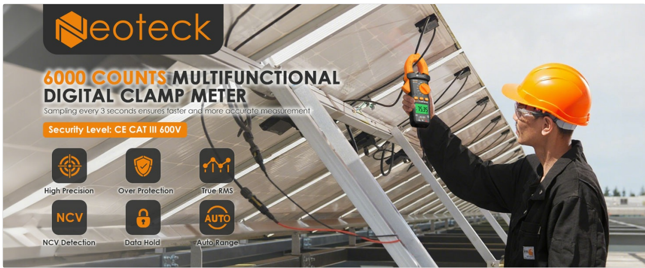
Image: Internal view of the Neoteck Clamp Meter, highlighting double safety protection and overload protection features. The device complies with CAT III 600V security level standards.