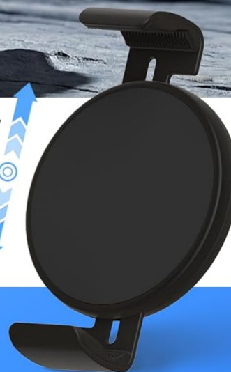
Figure 3.3: Magnetic and clamp attachment methods for smartphones.