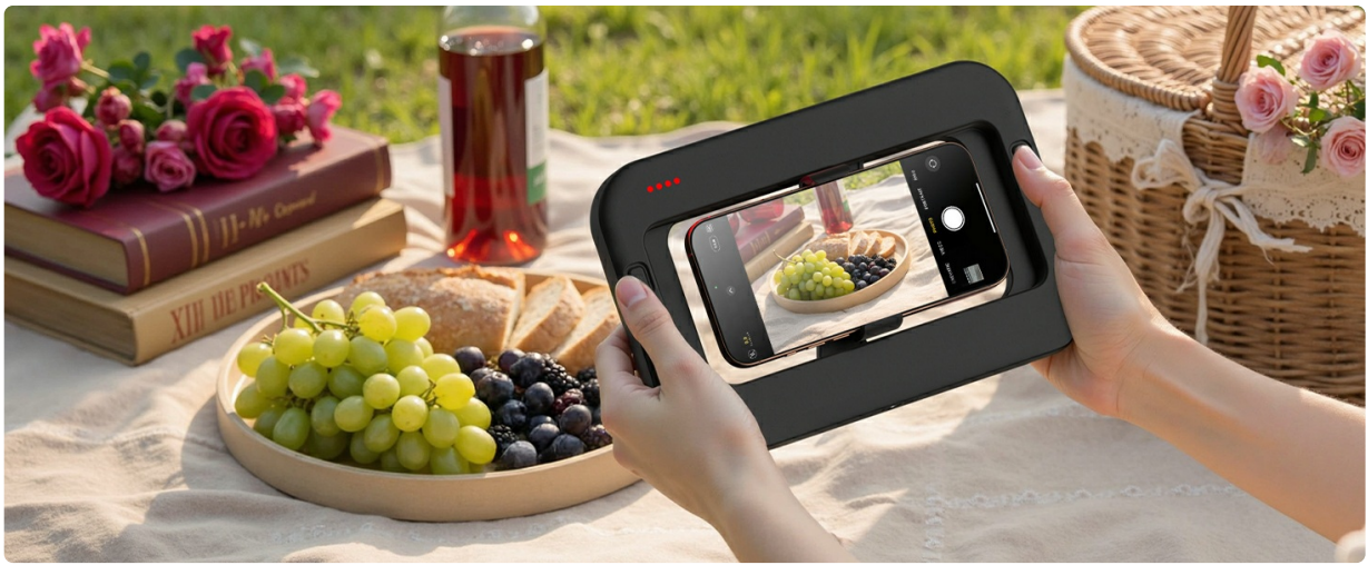
Figure 4.3: Customizable dual-zone lighting in action.