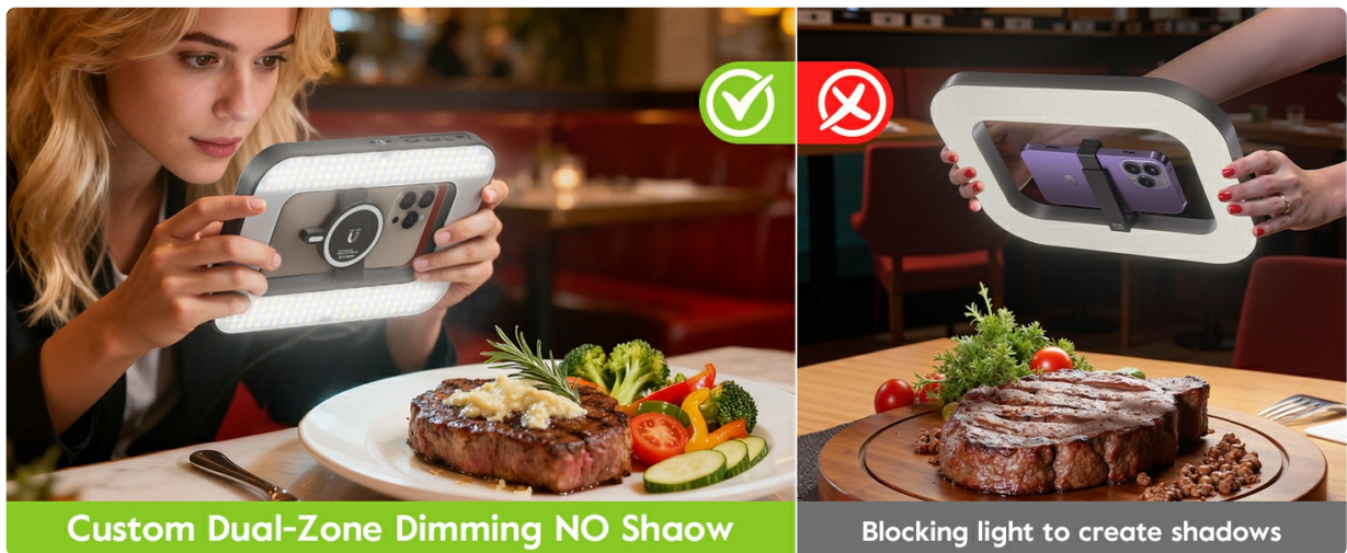
Figure 4.4: Dual-zone dimming prevents unwanted shadows.