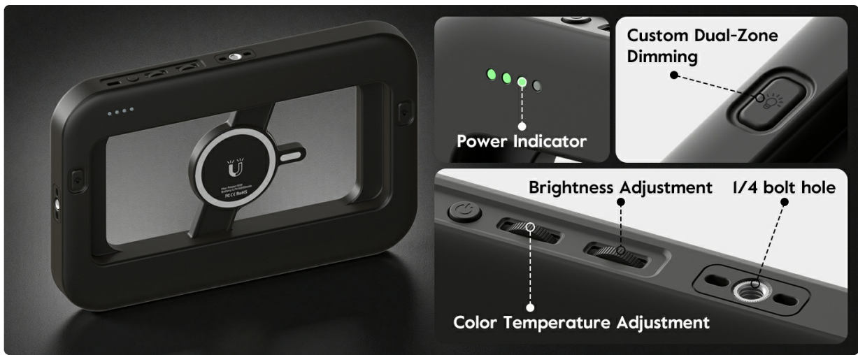
Figure 3.4: Power indicator lights on the ring light.