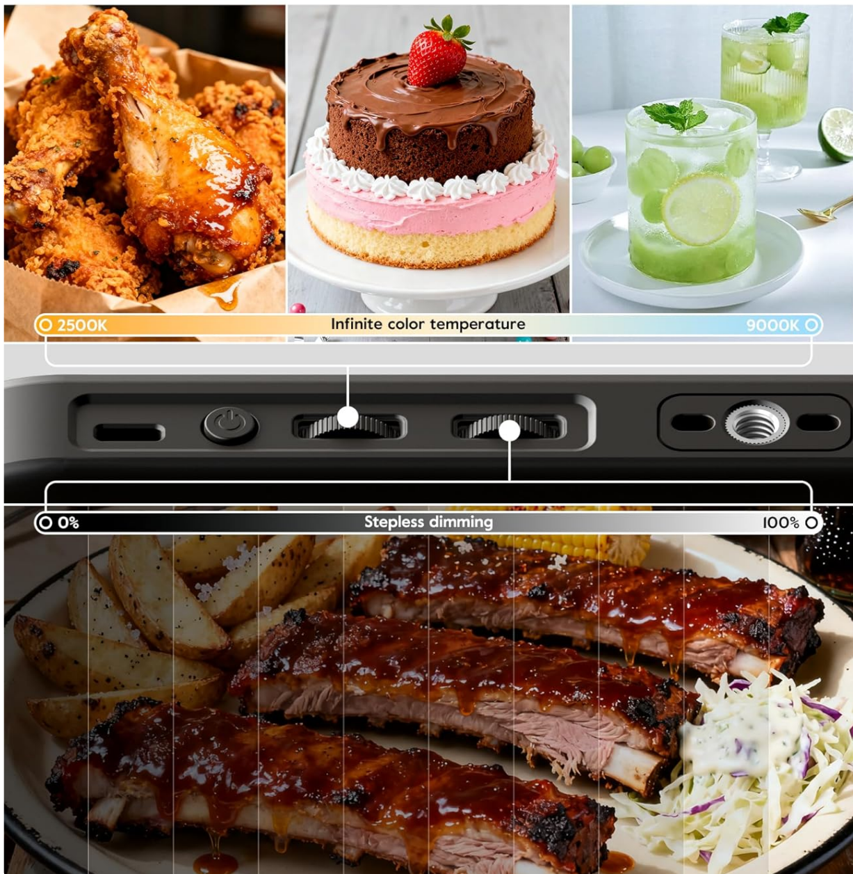
Figure 4.2: Visual representation of infinite dimming and color temperature options.