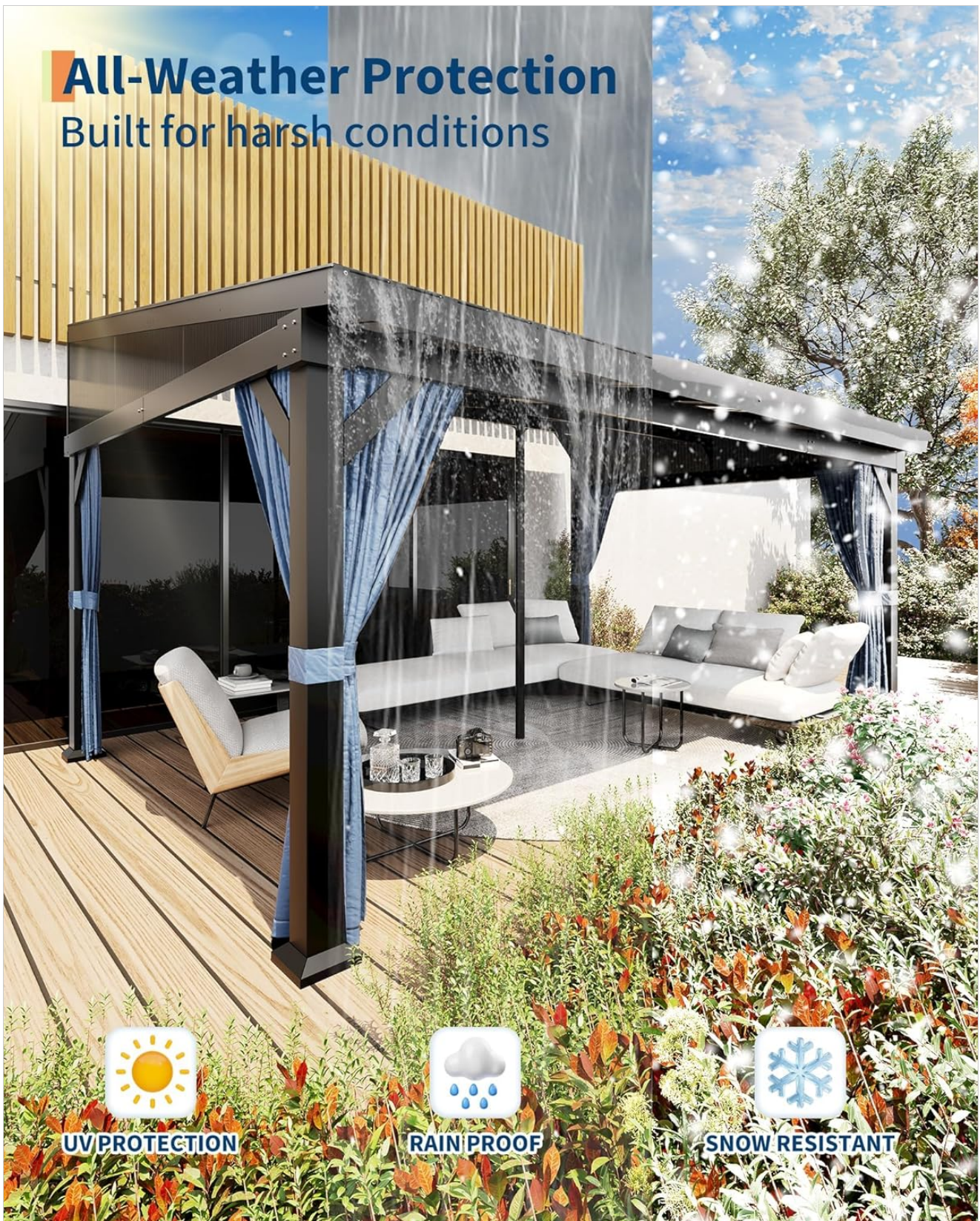
Image 5.2: The gazebo's roof demonstrating its all-weather protection capabilities, including rain resistance.