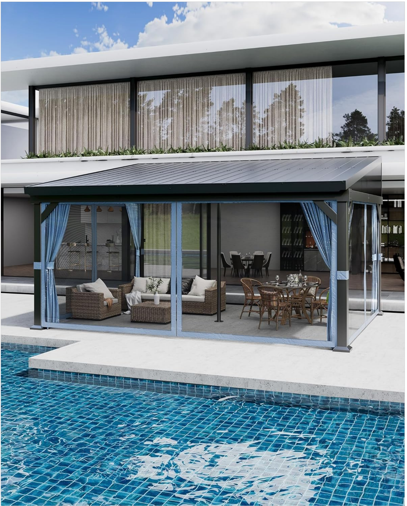
Image 1.1: The GAOMON 10'X14' Wall-Mounted Lean-to Gazebo providing a shaded outdoor area next to a modern home and pool.