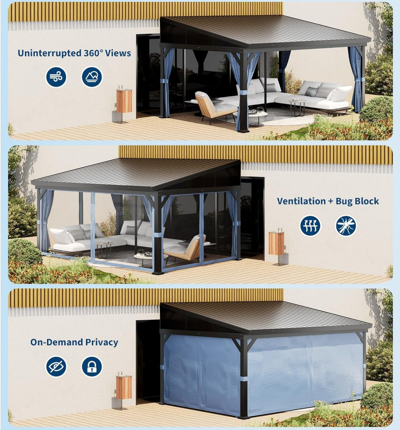
Image 5.1: Demonstrating the flexible options for privacy, ventilation, and bug protection using the detachable netting and curtains.