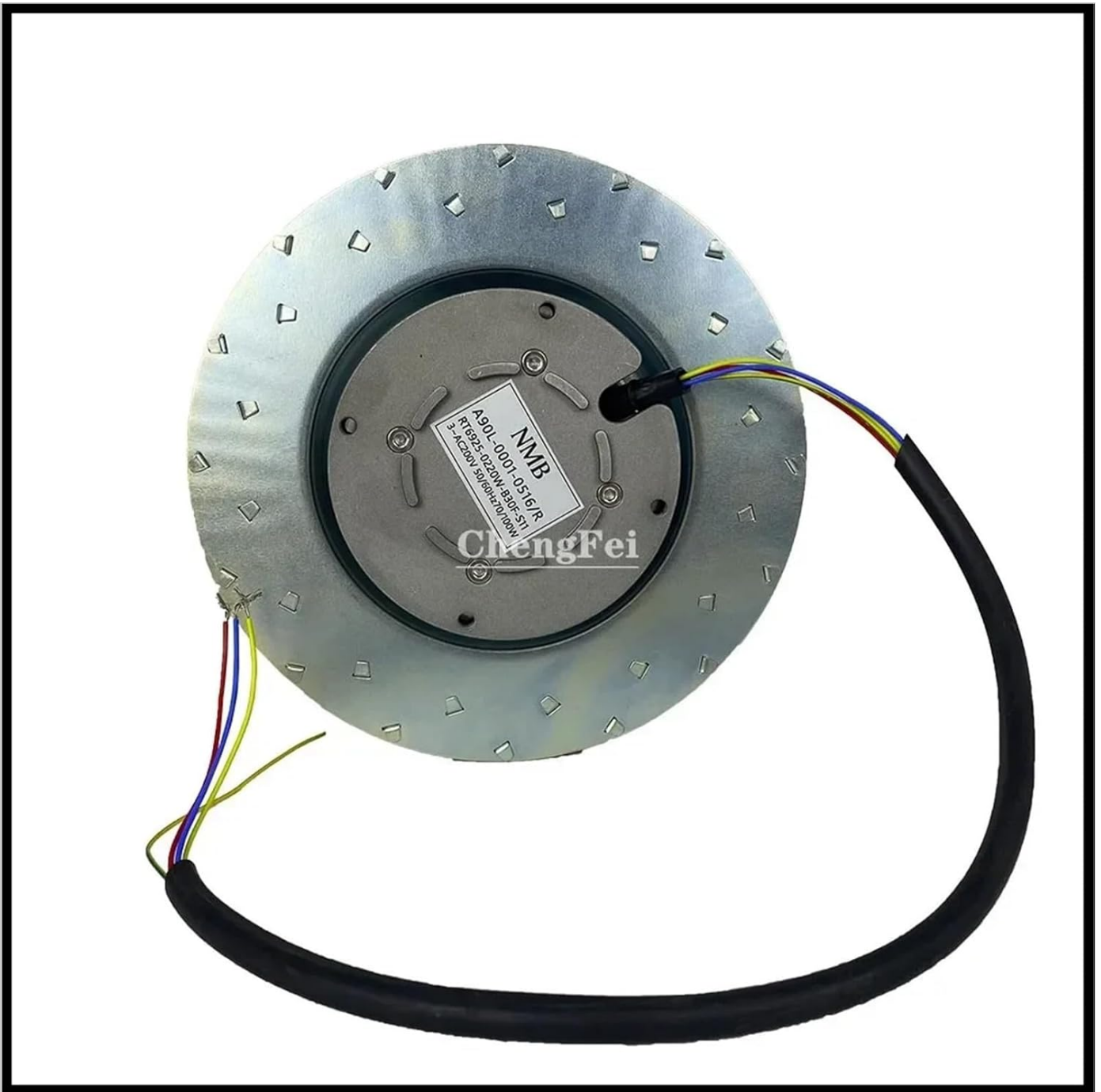
Figure 3.2: Close-up of the fan's rear label, indicating model number A90L-0001-0516/R, power requirements, and operational frequency. This label provides critical electrical specifications.