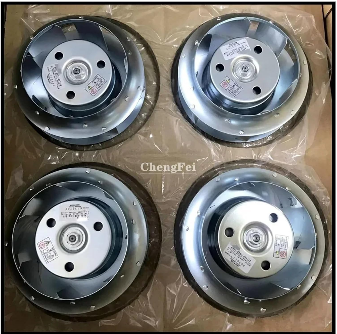
Figure 5.1: Multiple cooling fans as received in packaging. Ensure all components are present and undamaged upon unboxing.