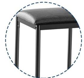
Sturdy Base Support