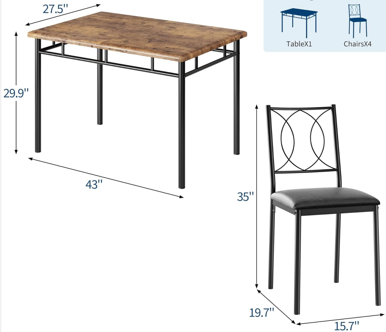
Figure 2.1: Product dimensions and package contents. The table measures approximately 43 inches long, 27.5 inches wide, and 29.9 inches high. Each chair is approximately 15.7 inches wide, 19.7 inches deep, and 35 inches high.