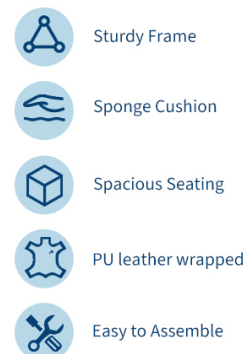
Figure 4.3: Features of the PU Leather Upholstered Dining Chair.