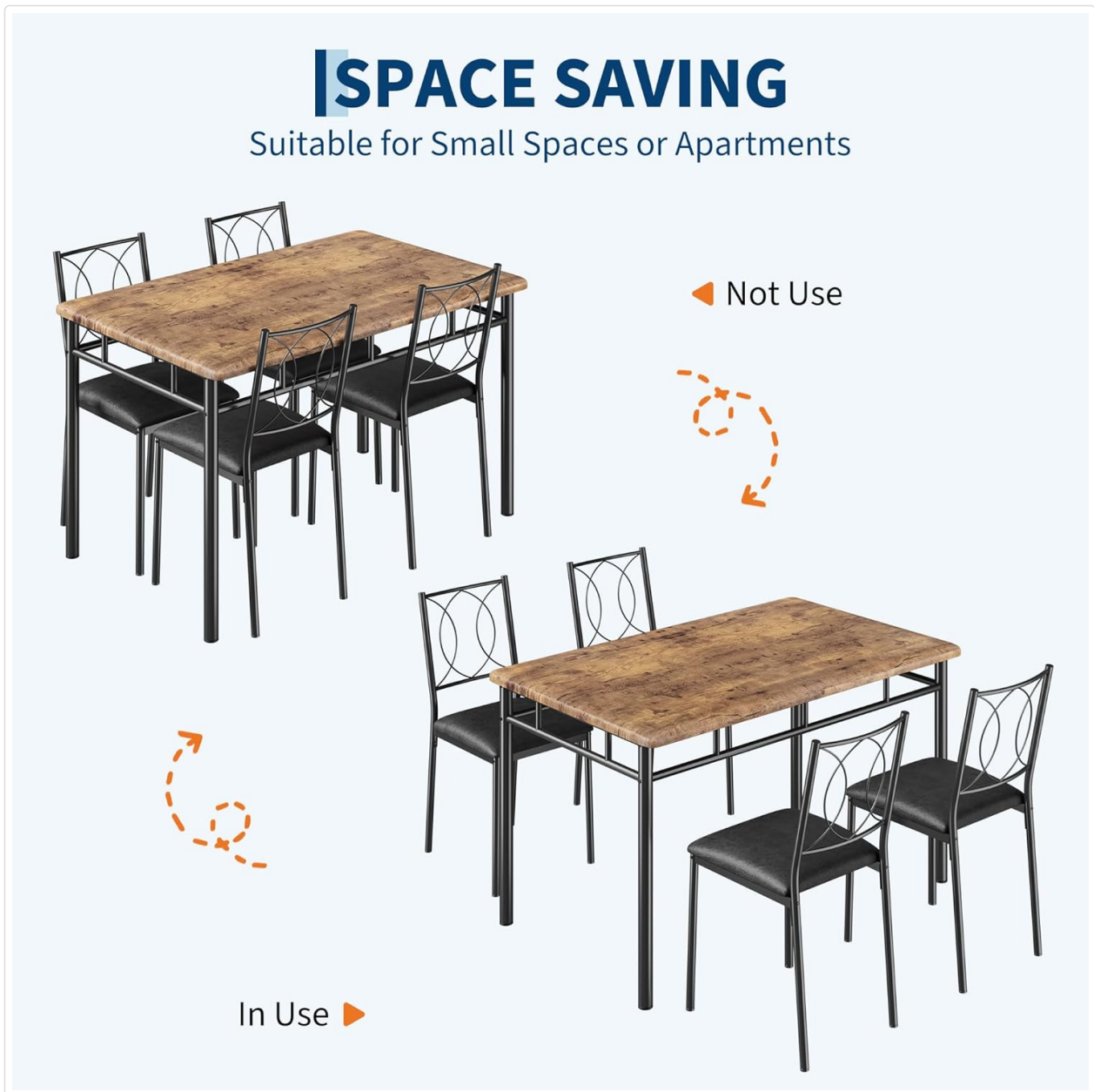
Figure 4.1: Space-saving design with chairs stored under the table.

not in use, maximizing your floor space. The table measures 43.3"L x 27.5"W x 29.9"H, comfortably seating four without occupying excessive room.