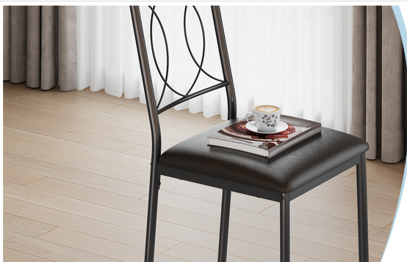
Figure 4.2: Detail of the comfortable and sturdy chair design.