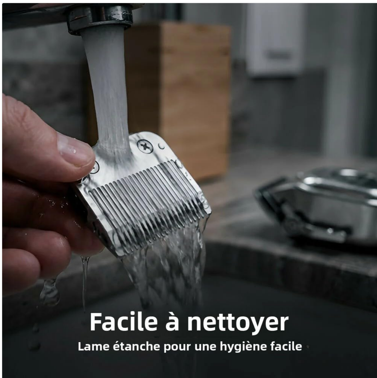
Figure 6.1: Easy to Clean: The water-resistant blade allows for quick and hygienic cleaning under running water.