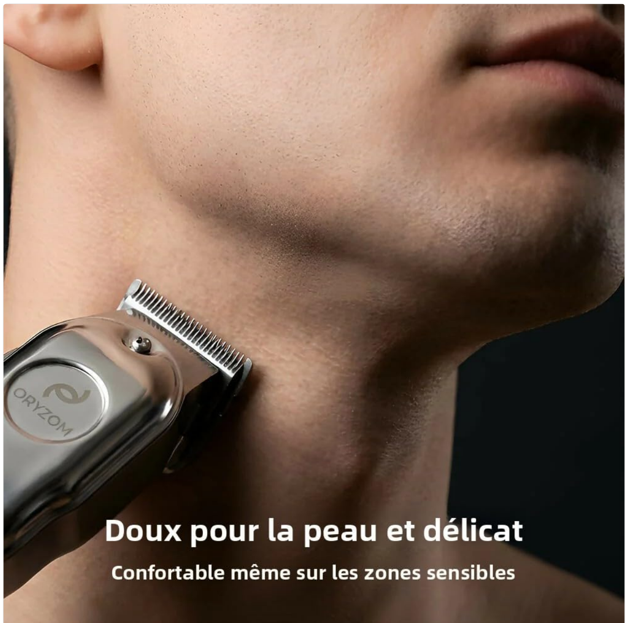
Figure 5.2: Gentle and Delicate on Skin: Designed for comfort, the trimmer is suitable for use even on sensitive areas like the neck.