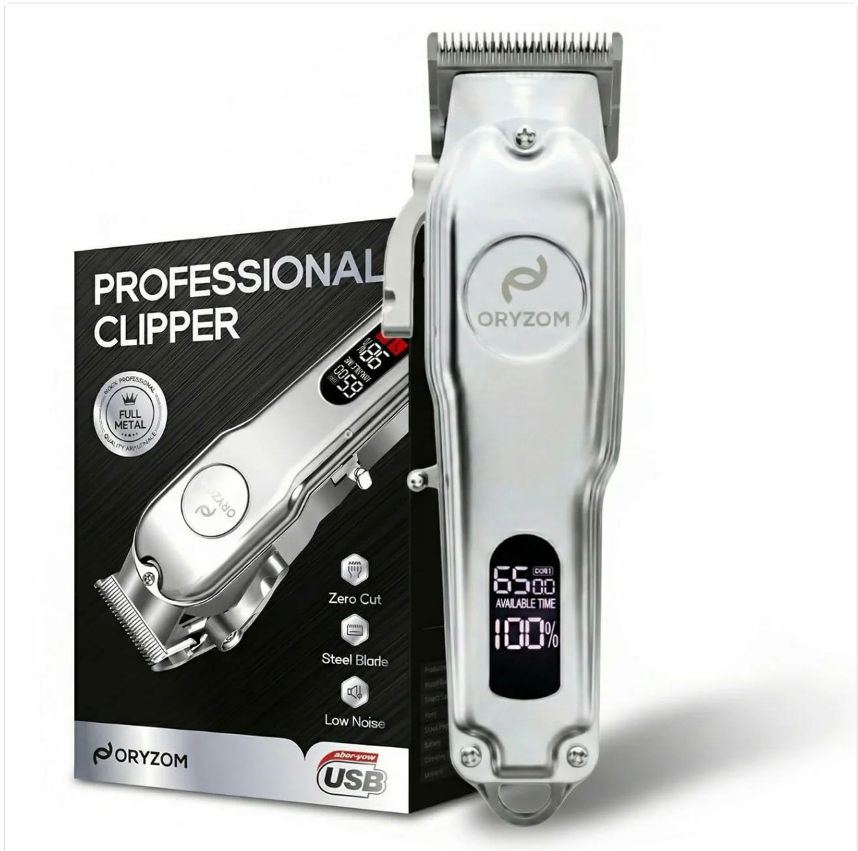
Figure 3.1: Overview of the SWZEC Oryzom ProTrim 2.0 Trimmer.