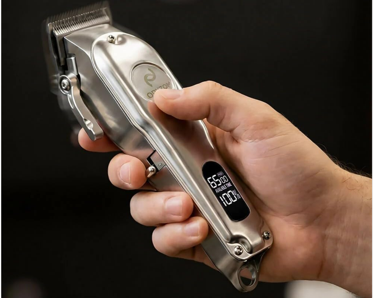
Figure 3.3: High-Performance Motor: A powerful motor ensures efficient trimming, even through thick hair, with the LCD displaying battery and RPM.

Performance puissante, même sur les cheveux épais.