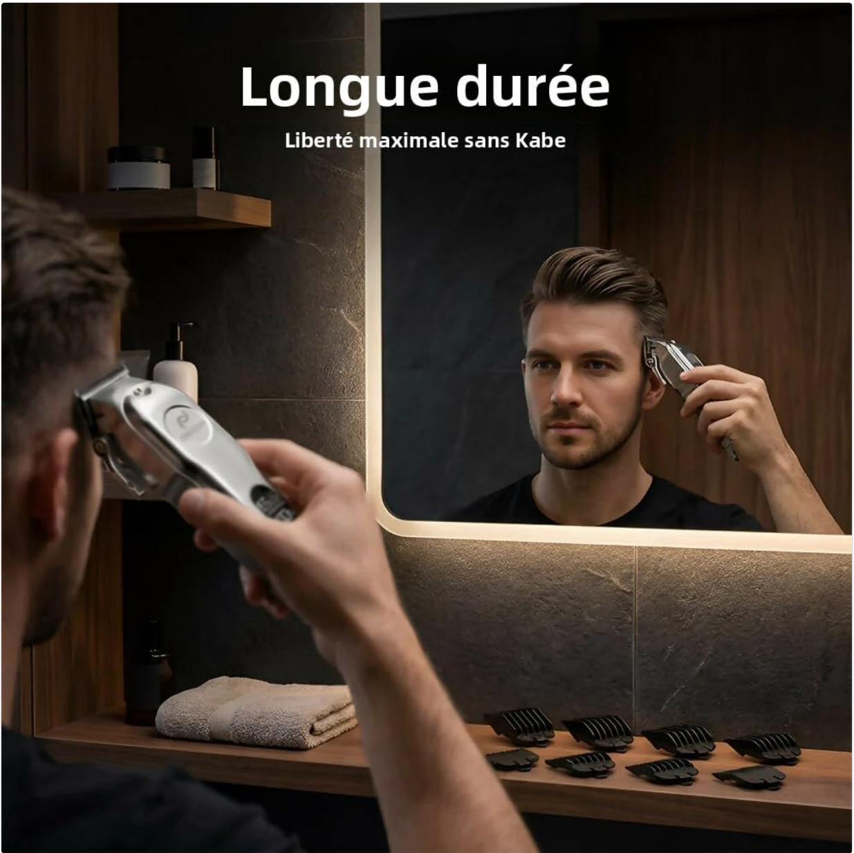
Figure 5.1: Long-lasting: The trimmer offers extended cordless operation, providing freedom and flexibility during use.