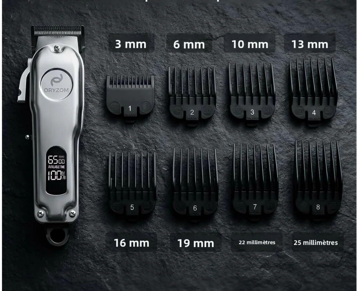
Figure 3.2: Precise Length Adjustment: The trimmer comes with 8 comb guides, offering cutting lengths from 3mm to 25mm for versatile styling.