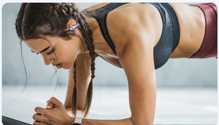
Figure 3: Earbuds seamlessly connected to multiple devices via Bluetooth 5.3.

Fits Perfectly, Moves with You—No Slips, No Distractions Perfect for Running, Yoga, or Strength Training Designed for Active Lifestyles, Built for Comfort