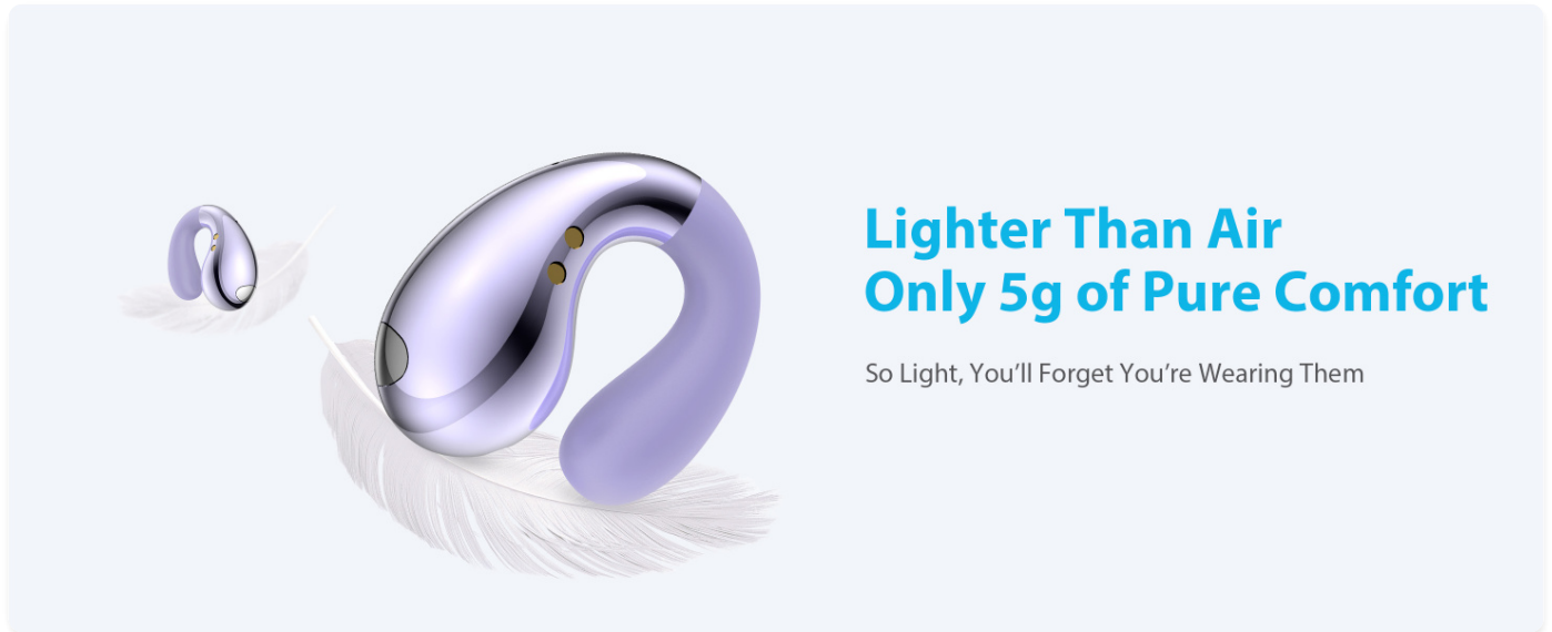
Figure 4: Illustration of the flexible clip-on design for a comfortable and secure fit.

The S30i earbuds feature an open-ear, clip-on design for comfort and situational awareness. Gently clip each earbud onto your ear, ensuring the audio driver is positioned near your ear canal without entering it. The flexible design allows for a secure and comfortable fit for various ear shapes.