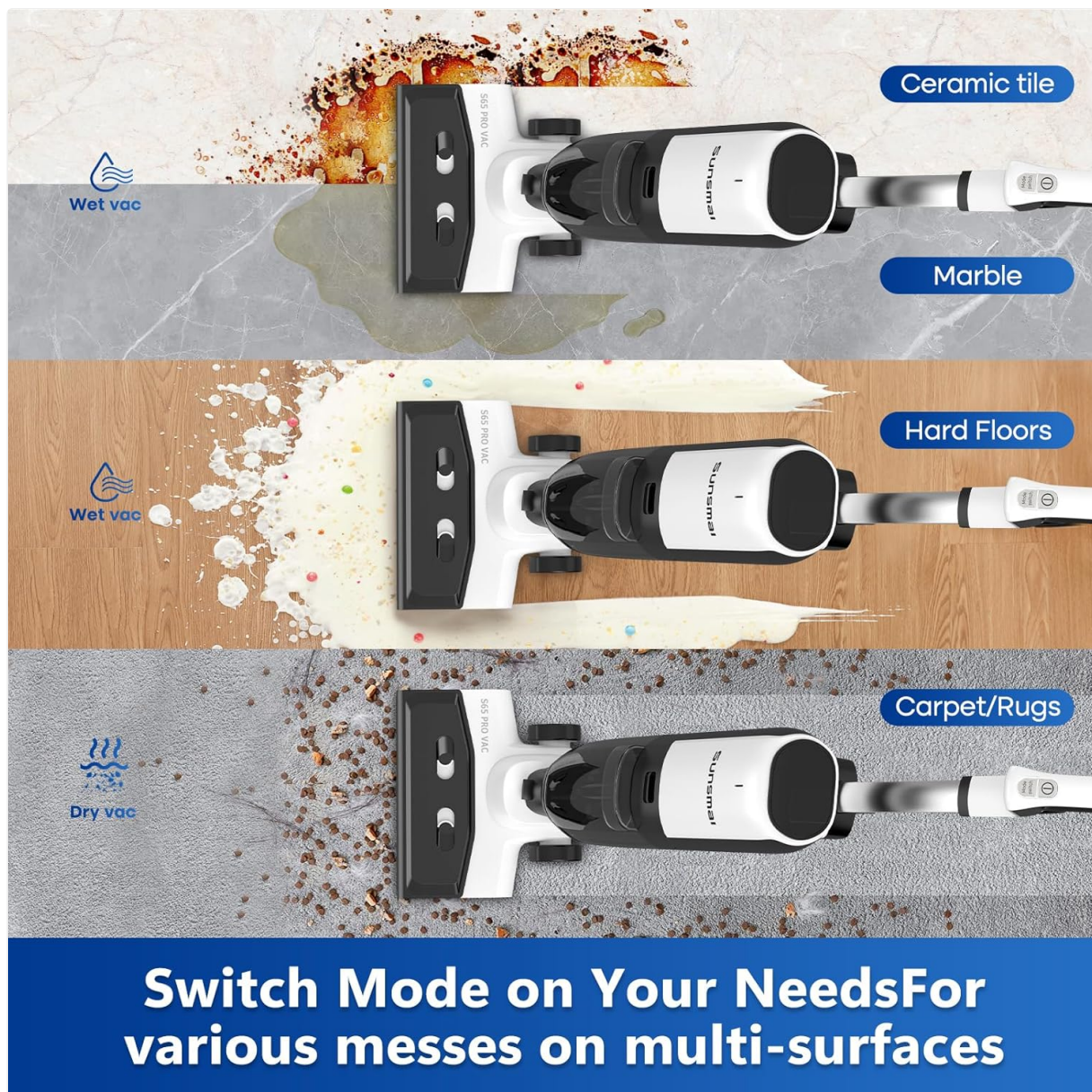
Figure 3: Multi-Surface Cleaning Modes