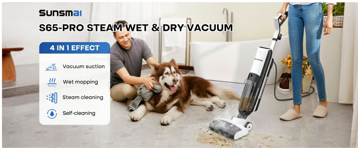
Figure 8: Automatic Self-Cleaning Program