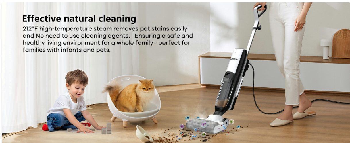
Figure 9: Real Fresh Water Cleaning System

The device features a real-time water circulation system that continuously delivers fresh water while capturing wastewater. This prevents the use of dirty water for cleaning. Regularly check and clean both the clean and dirty water tanks.