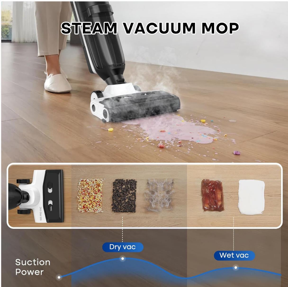
Figure 5: High-Temperature Steam Cleaning

In Steam Mode, the mop heats water to 212°F (100°C) to effectively dissolve stubborn stains and eliminate 99.9% of germs and bacteria. Allow 15-20 seconds for steam to generate before use. This feature is ideal for tough messes on hard floors.