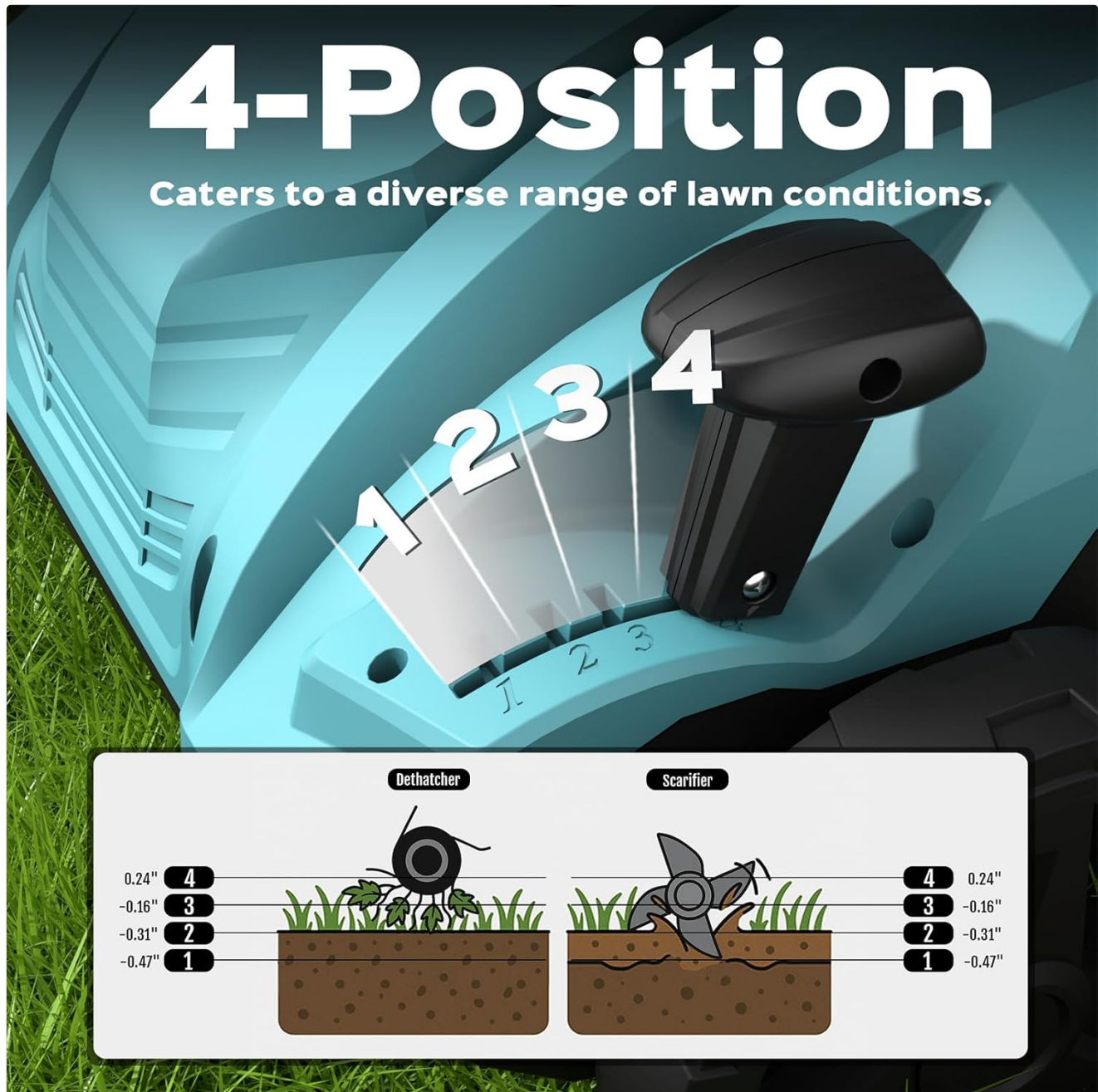
Figure 4: 4-Position depth adjustment for varied lawn conditions.

The unit features a depth adjustment lever, typically located near the wheels, allowing you to select from 4 different positions. Choose a shallow setting for light dethatching or a deeper setting for scarifying to stimulate root growth.