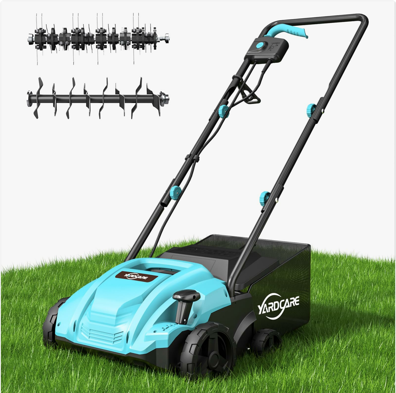
Figure 1: YARDCARE 13-Inch 2-in-1 Electric Dethatcher and Scarifier.