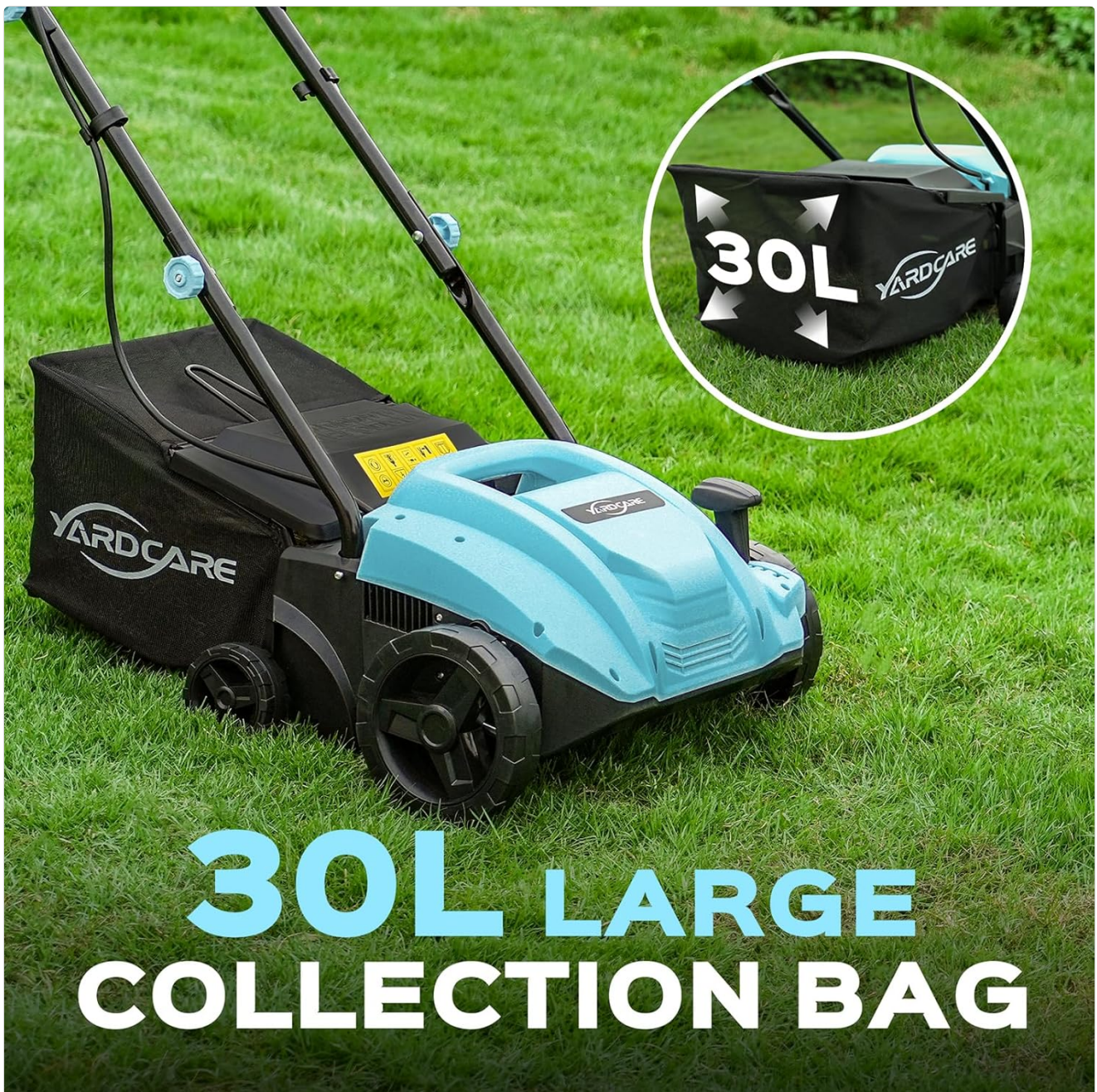
Figure 5: YARDCARE dethatcher with 30L collection bag in operation.