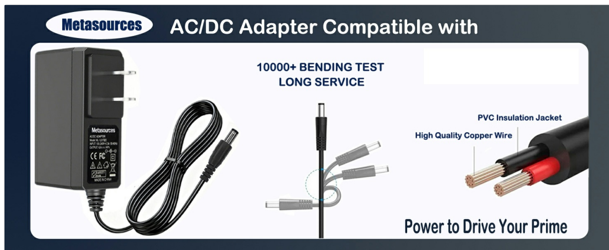
Image: The adapter's compact design ensures it occupies only one outlet, leaving adjacent outlets free for other devices.

The adapter is designed for a space-saving fit, allowing other outlets to remain accessible.