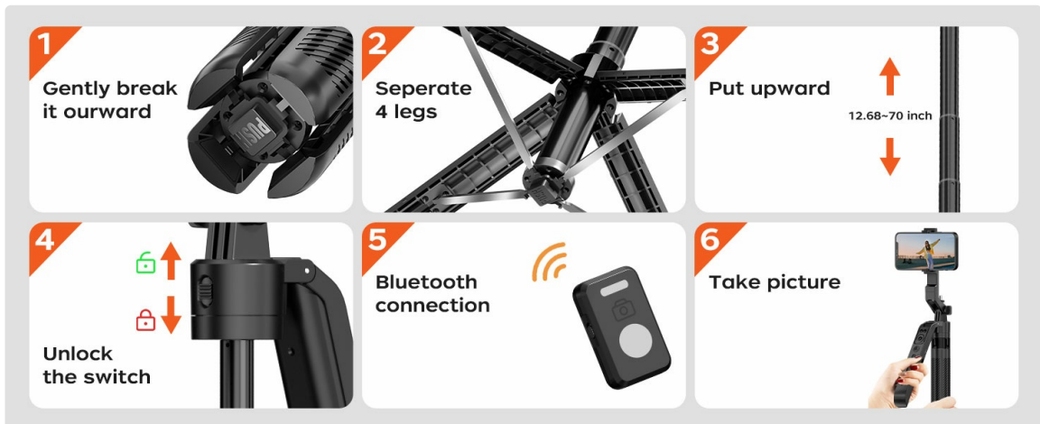
Image: Visual guide for unfolding the tripod, extending the pole, and unlocking the gimbal switch.