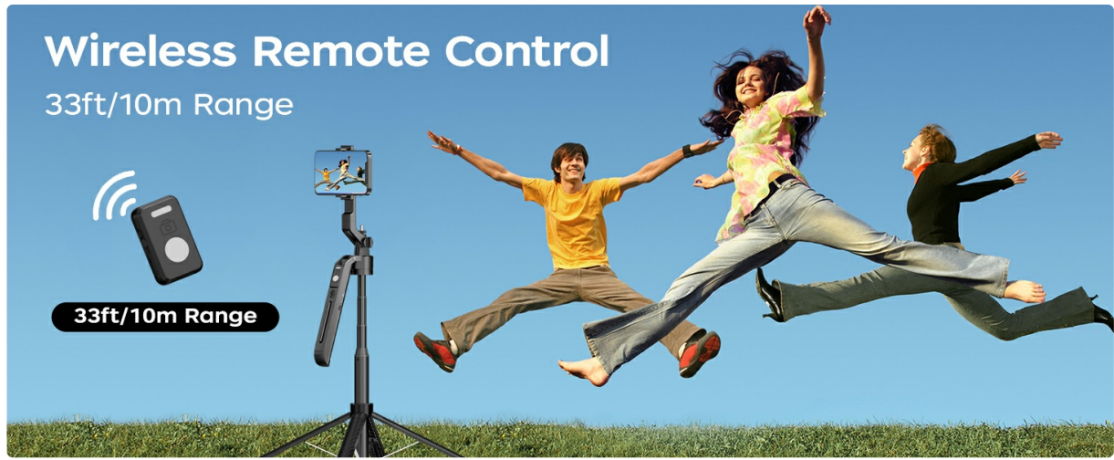
Image: The wireless remote control for capturing photos and videos.