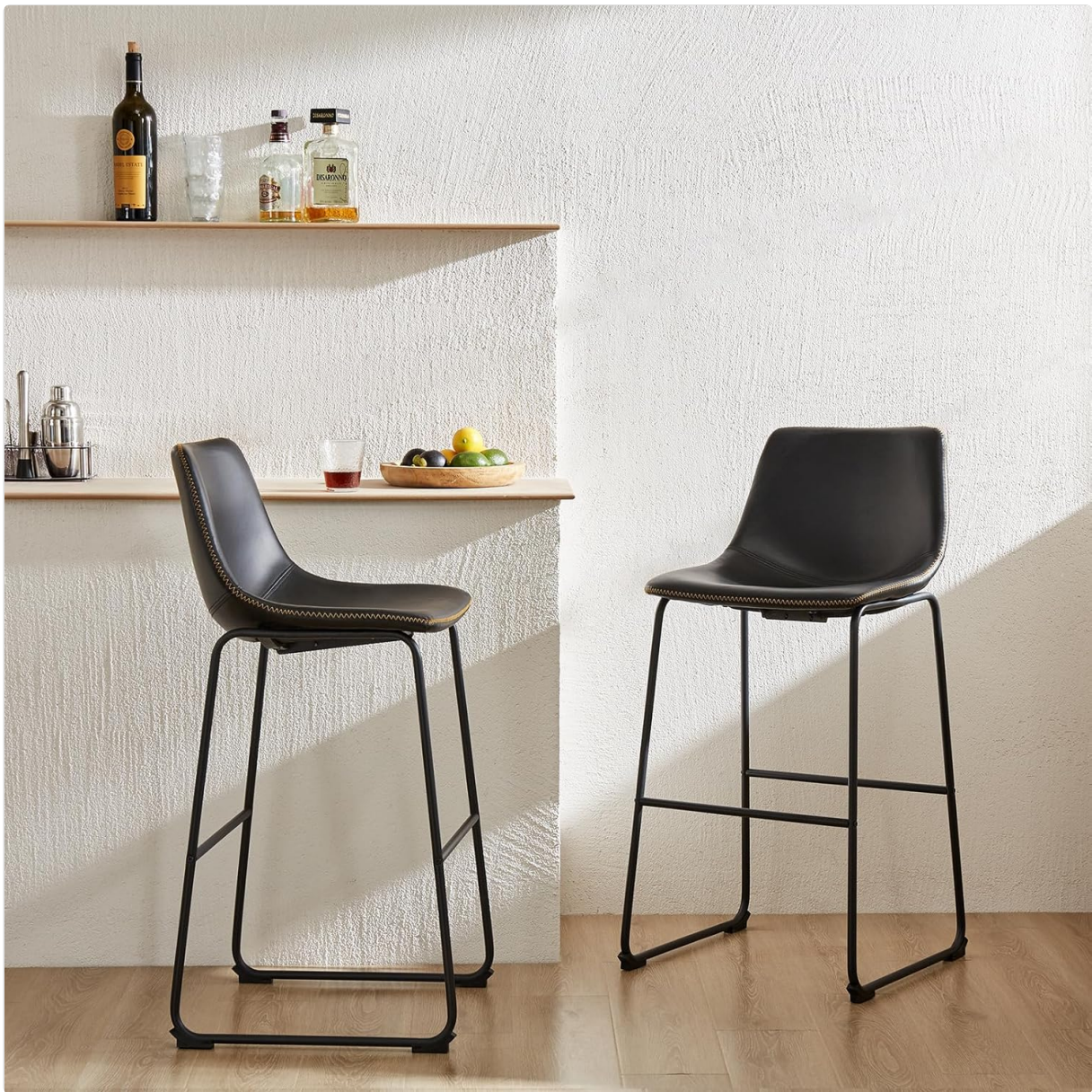
Image: Two DUMOS 26-inch counter height bar stools in a kitchen setting.