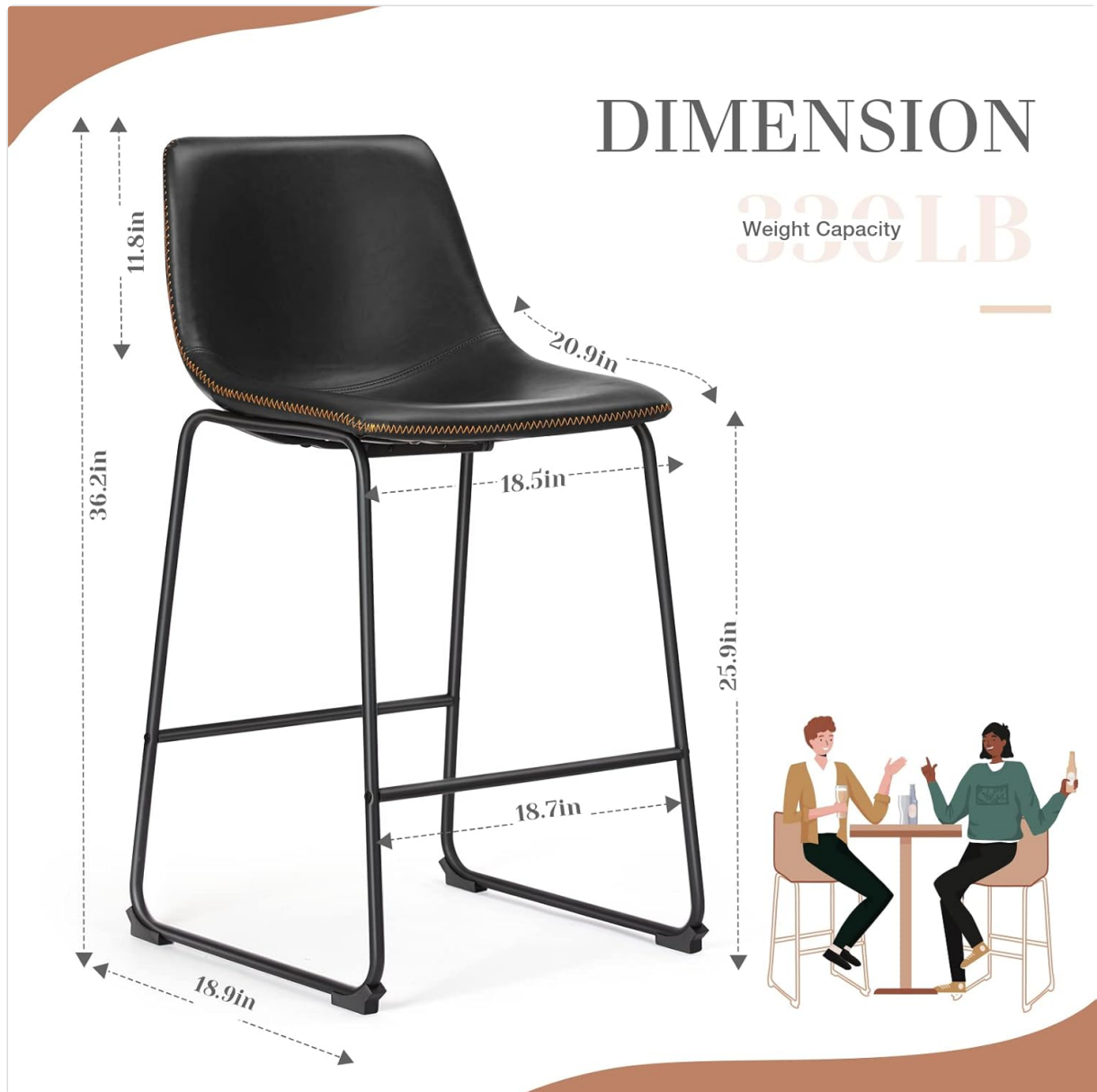
Image: Detailed dimensions and weight capacity of the bar stool.