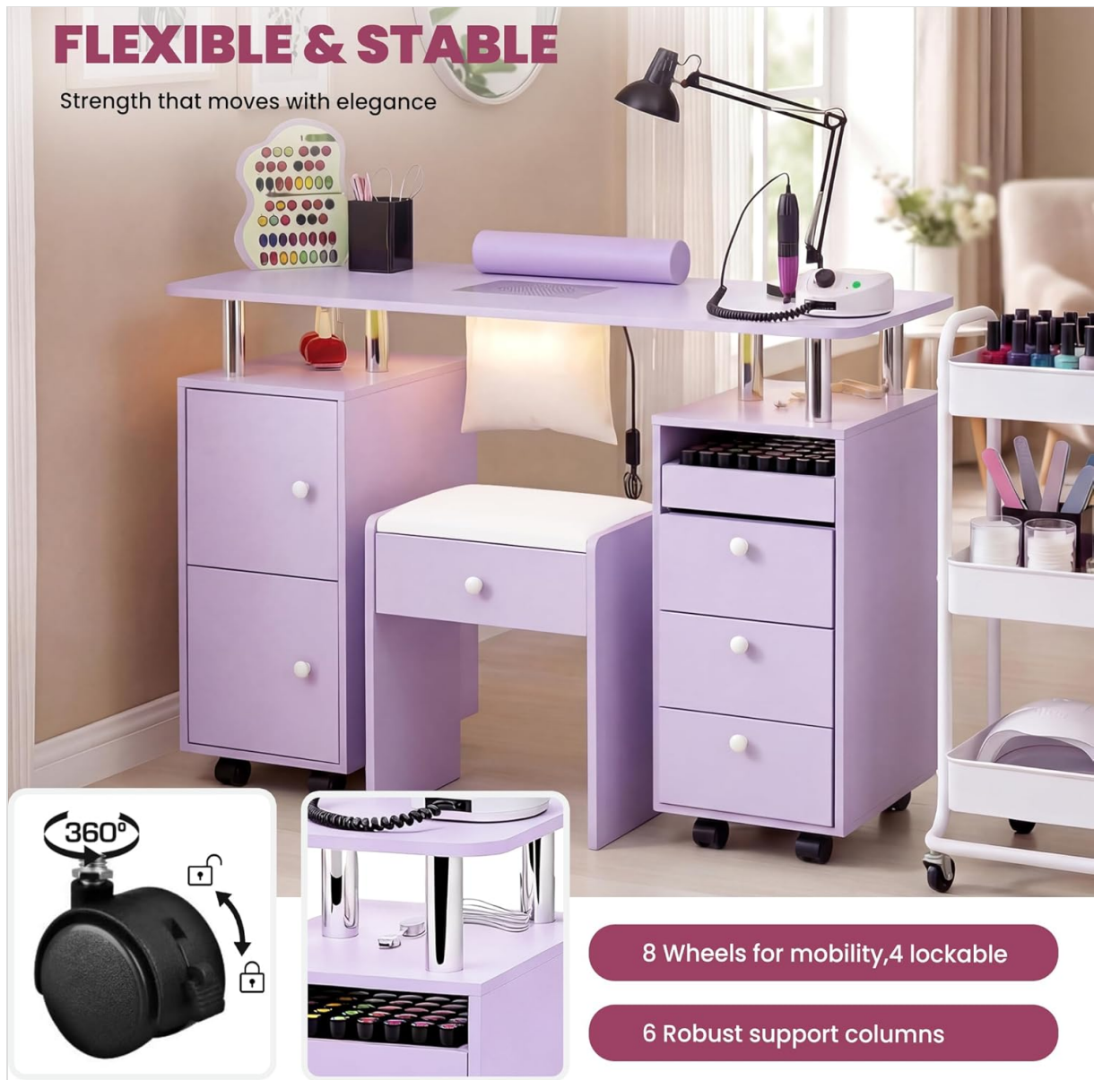
Figure 2: Illustration of the rolling wheels and support columns for stability and mobility.