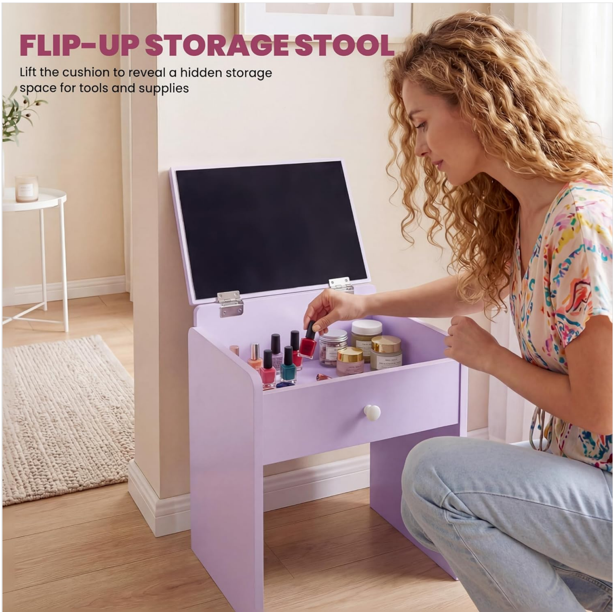
Figure 6: The flip-up storage stool with hidden compartment.

Lift the cushion to reveal a hidden storage space for tools and supplies