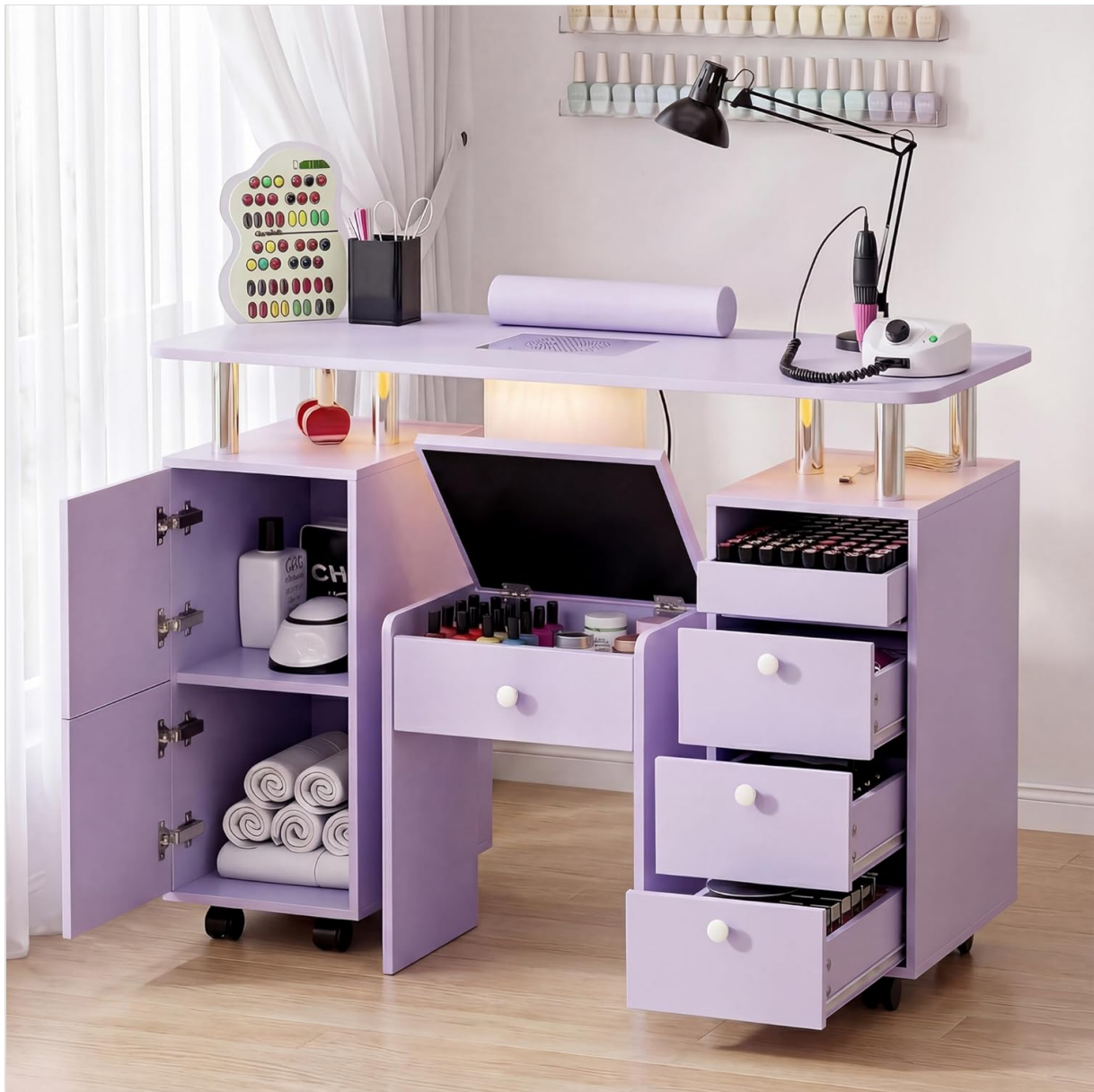
Figure 1: Overview of the HolaiNail Nail Desk and Storage Stool Set.