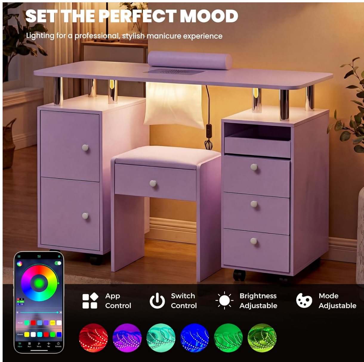
Figure 4: LED lighting features with app control options.