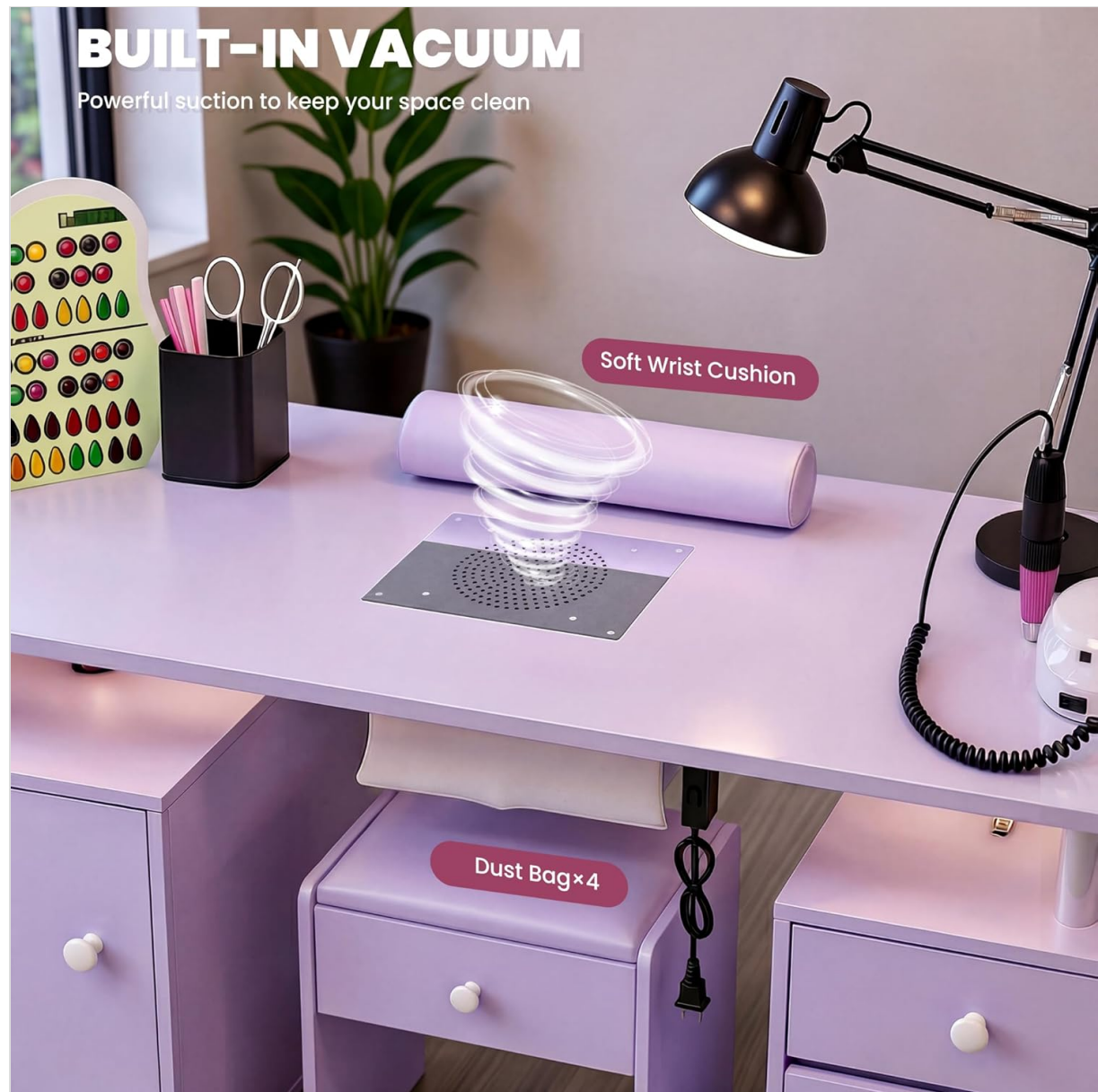
Figure 3: The electric dust collector with wrist cushion and dust bag.