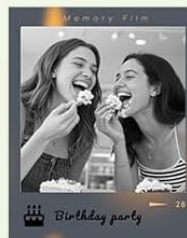
Best Day 54*74mm