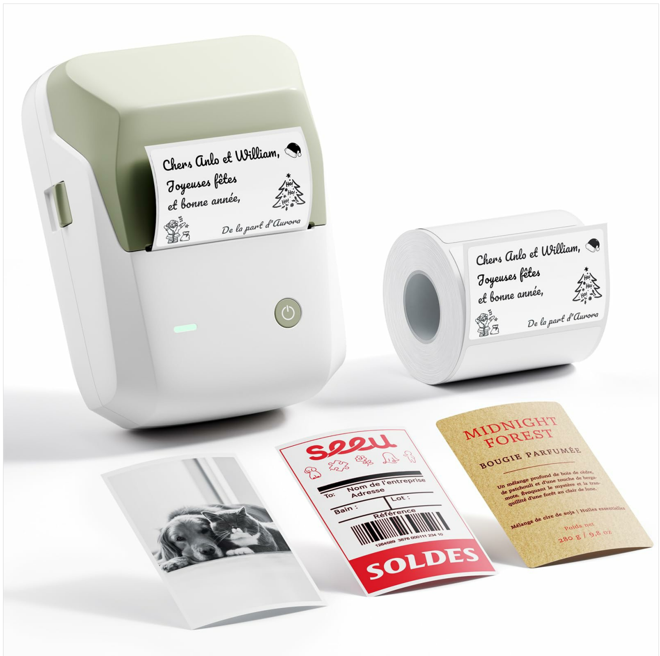
Image 1.1: The NIIMBOT B1Pro Label Printer, a compact and portable thermal printer.