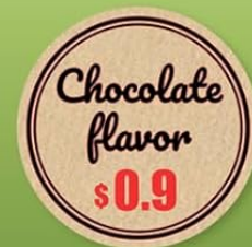
Image 6.3: Examples of the B1Pro in various settings, including kitchen organization, personal photo displays, and small business product labeling.