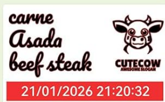
Red&Black Dual-Color 50*80mm