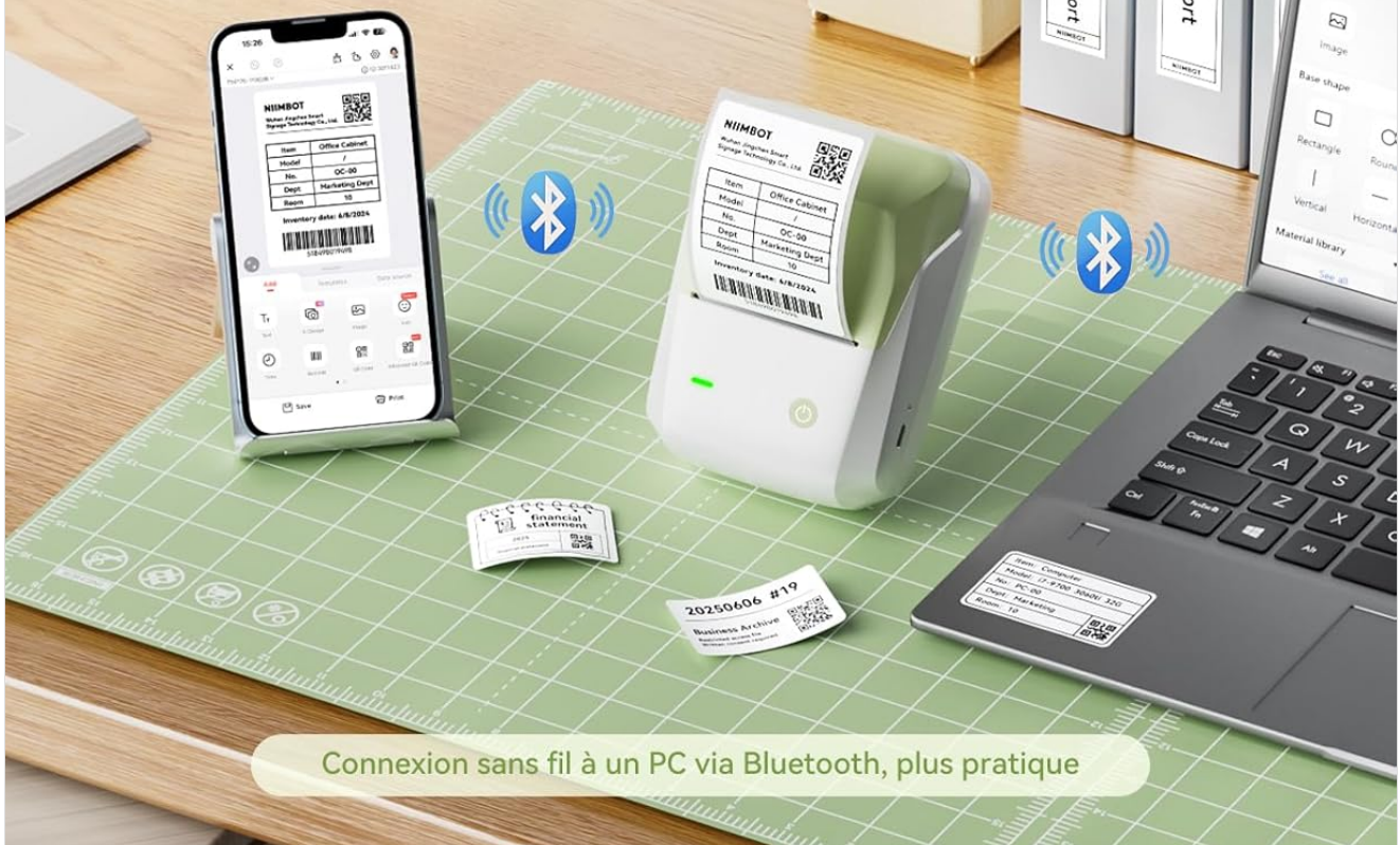
Image 4.2: The NIIMBOT B1Pro supports wireless Bluetooth connection with both smartphones and PCs, allowing simultaneous connections.