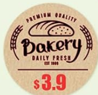
DualColor Kraft Rnd 34*34mm