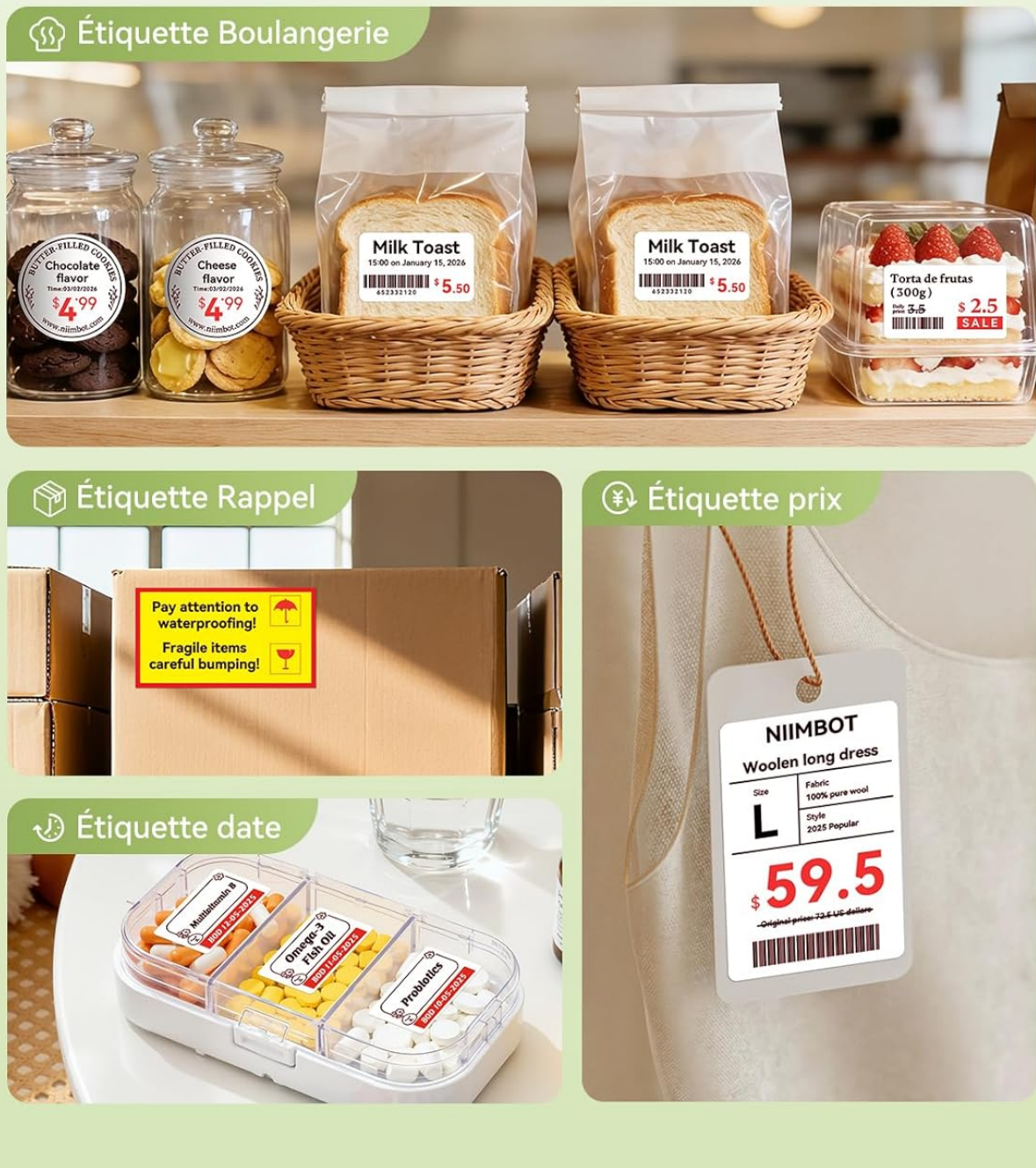
Image 5.2: Various applications of two-color red and black labels, including bakery pricing, reminder tags, product prices, and date labels.