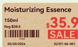
Red&Black Kraft Paper 50*80mm