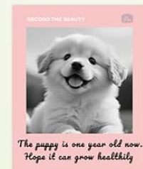
Spring Time 54*66mm