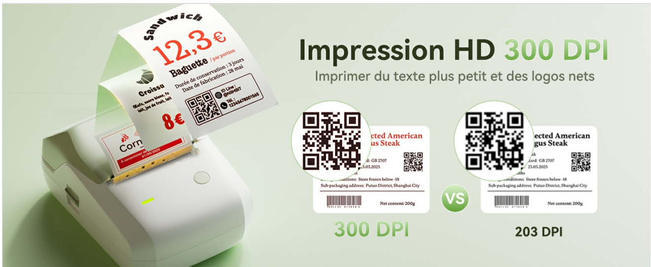
Image 3.2: Visual demonstration of 300 DPI print clarity versus 203 DPI, showing sharper text and QR codes.