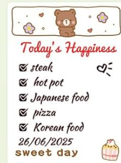
Red&Black Sunny Day 50*80mm