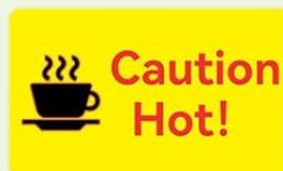
Dual-Color Yellow 50*30mm