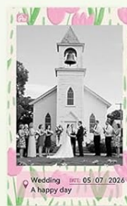
Impression Garden 50*80mm