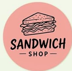
Milk powder fog 41*41mm