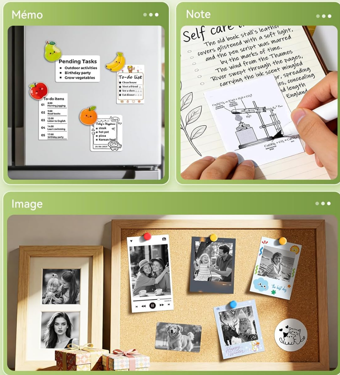
Image 5.1: Examples of photo labels for memos, notes, and personal images, demonstrating the B1Pro's photo printing capability.