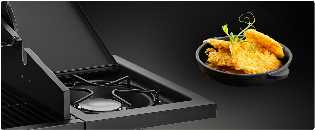
Image: The side burner in use, with a pan placed on its grate, highlighting its functionality for cooking side dishes.