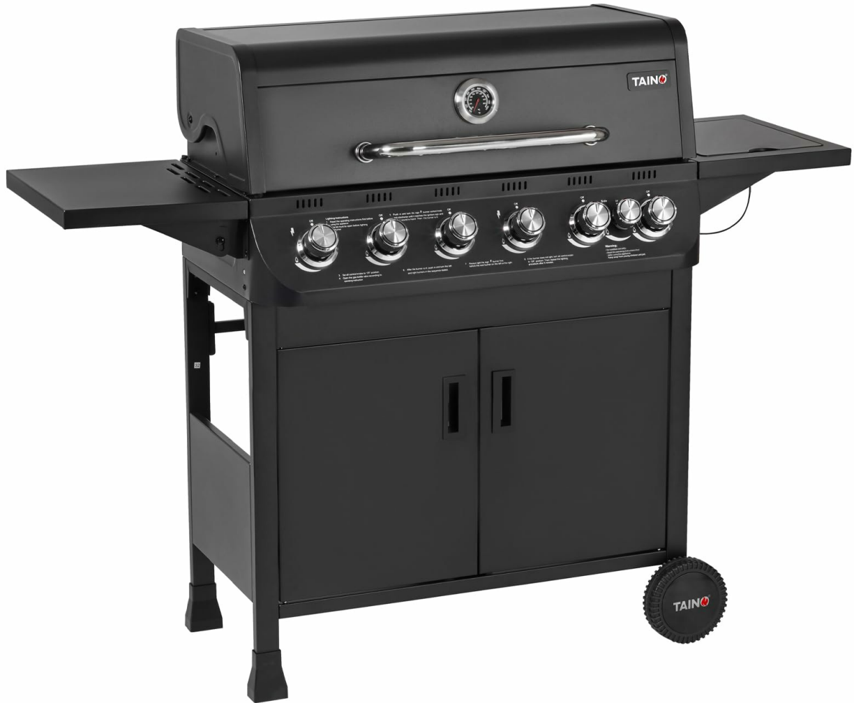
Image: The TAINO Brando 6+1 Gas Barbecue with its lid closed, showcasing its sleek black design and control panel.