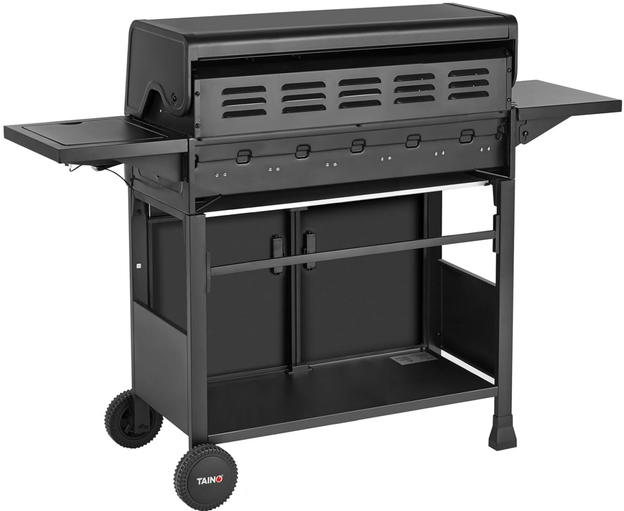
Image: The control panel with burner knobs and printed lighting instructions for the TAINO Brando 6+1 Gas Barbecue.