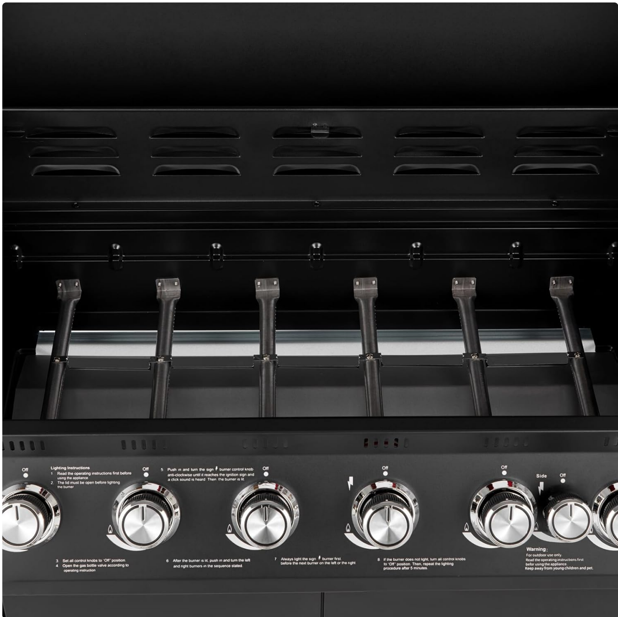
Image: Internal view of the barbecue, showing the six main burners and their heat distribution system.