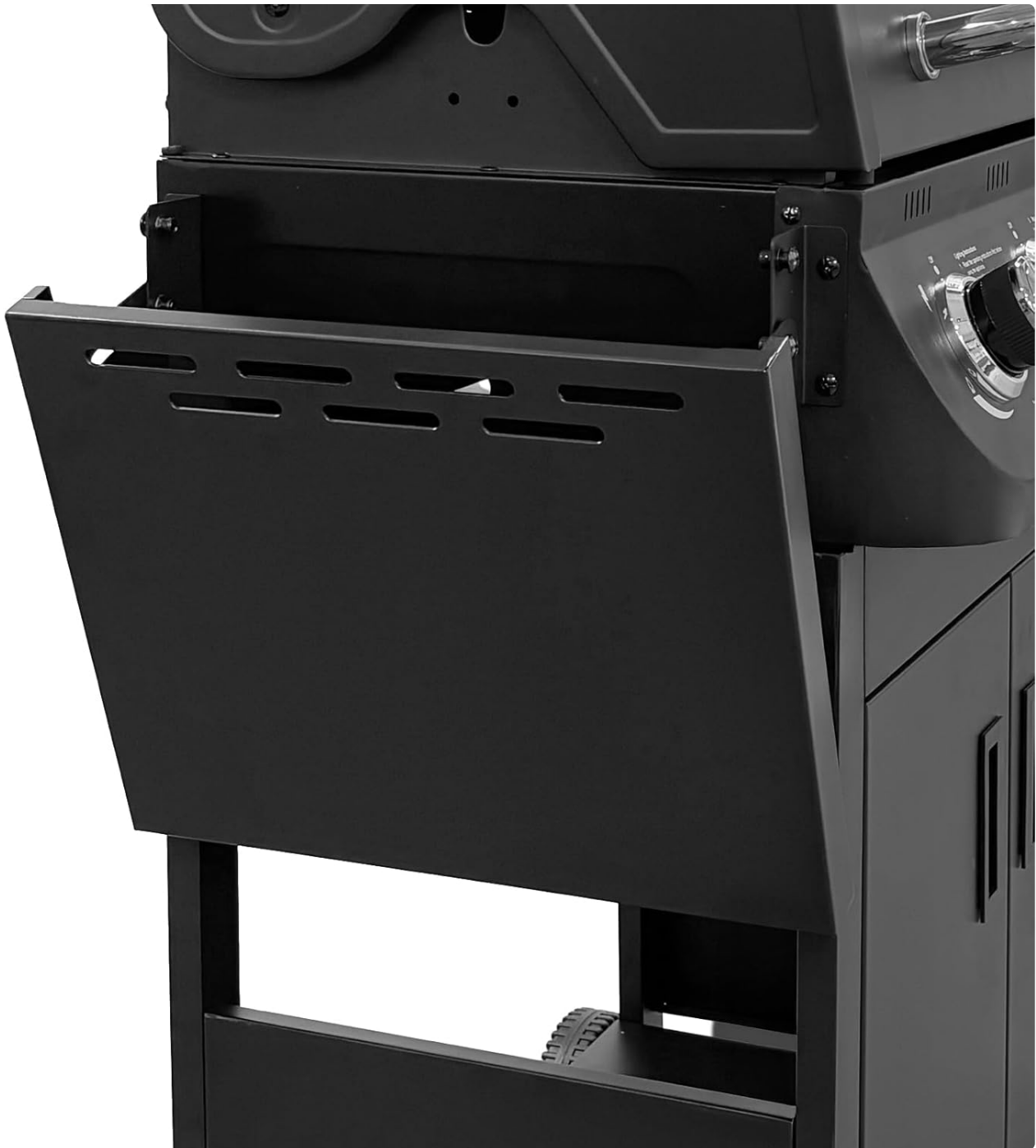
Image: Side view of the barbecue, indicating the location of the removable grease tray for cleaning.