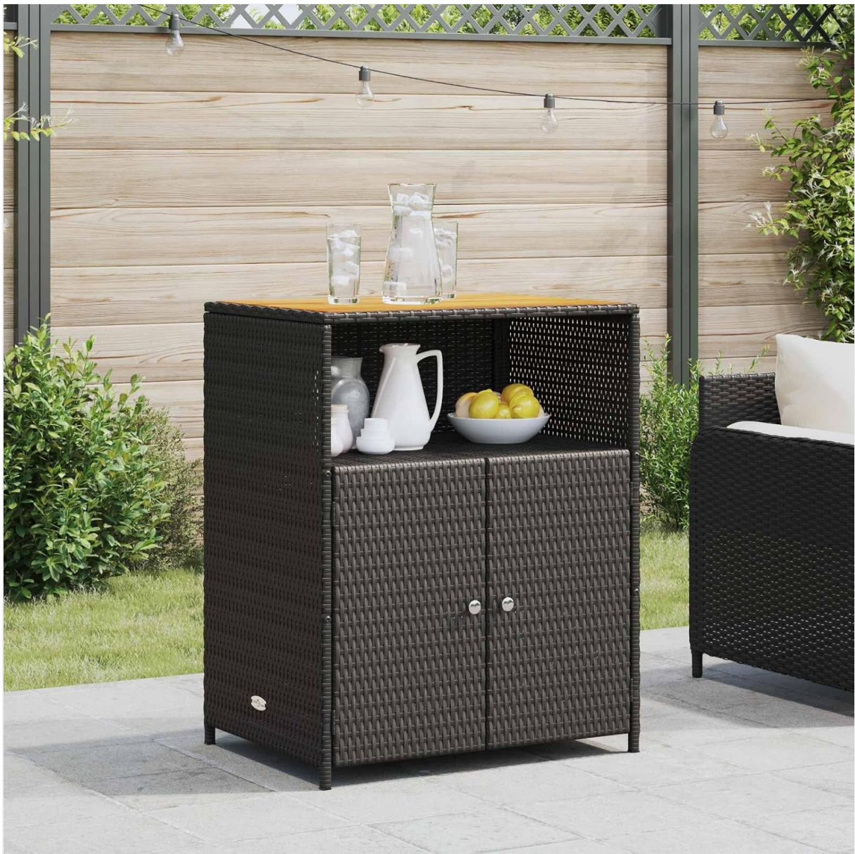
Image: The vidaXL Black Cabinet with Shelf, showcasing its design and functionality in an outdoor patio setting.