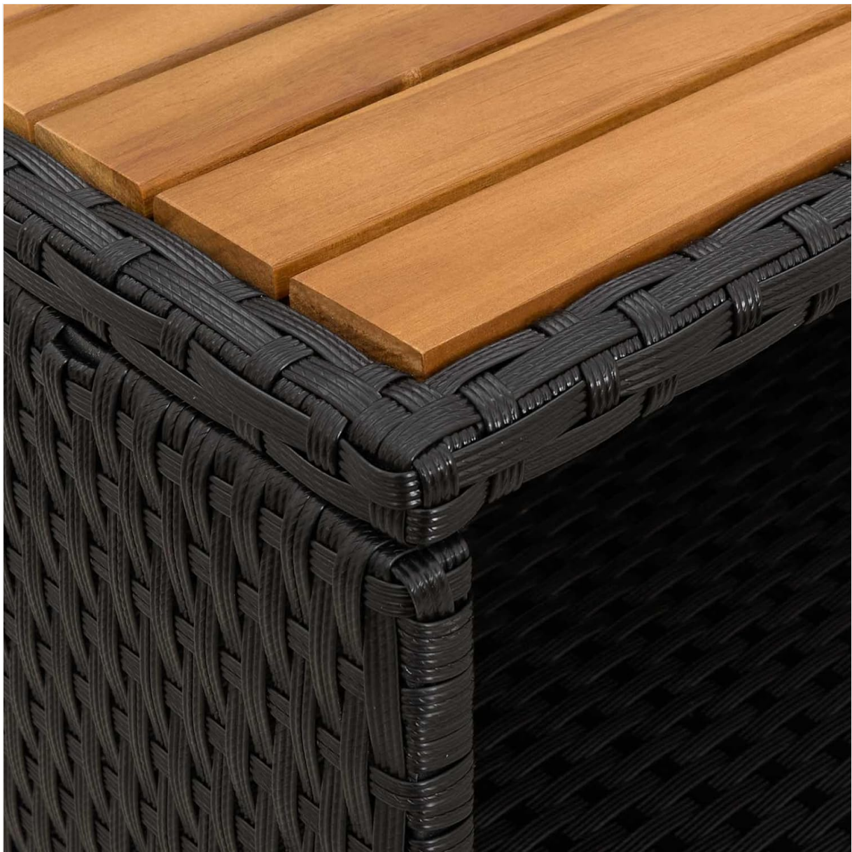
Image: A detailed view of the acacia wood top and the surrounding rattan, showing the craftsmanship.