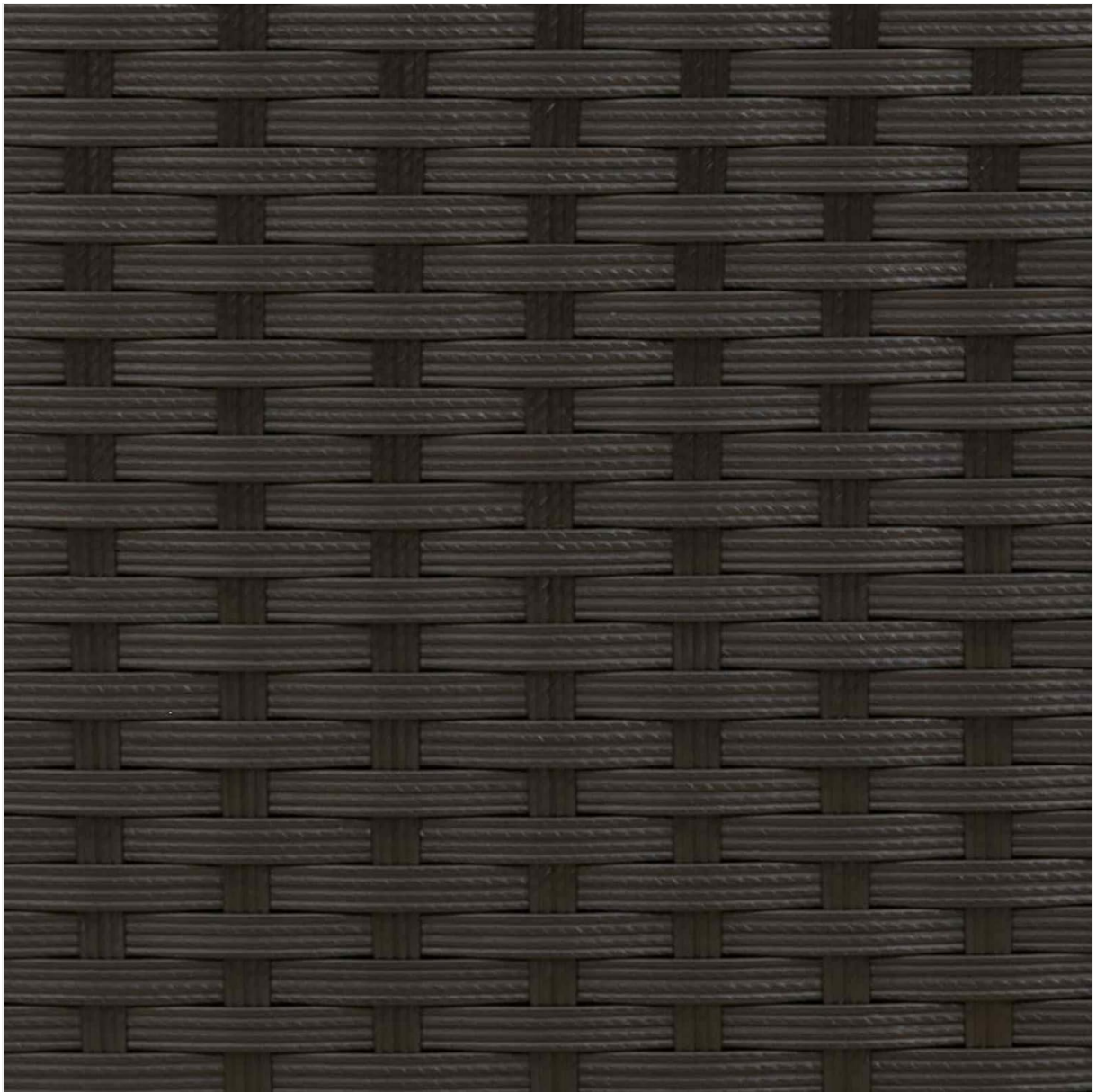
Image: Detail of the woven PE rattan, illustrating the material's texture and quality.