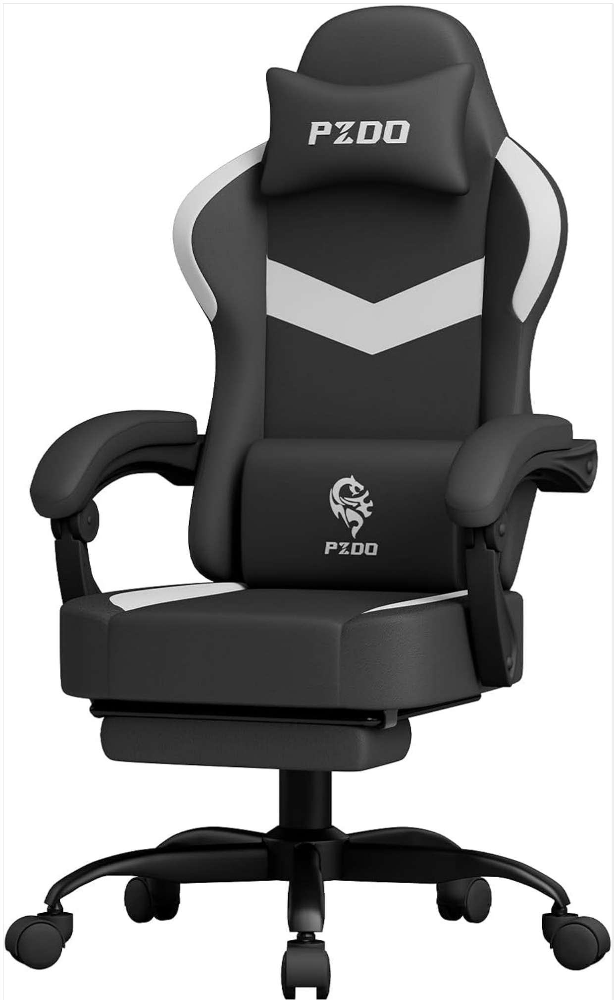
This image shows the PZDO Gaming Chair in a black and white color scheme, positioned in a modern gaming setup. The