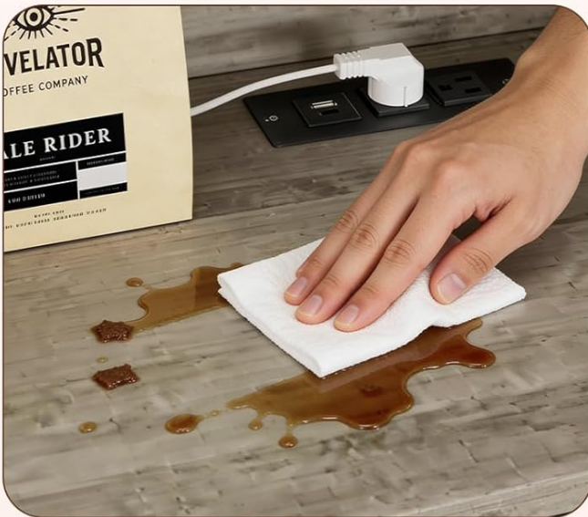
Oil-resistant and stain-resistant