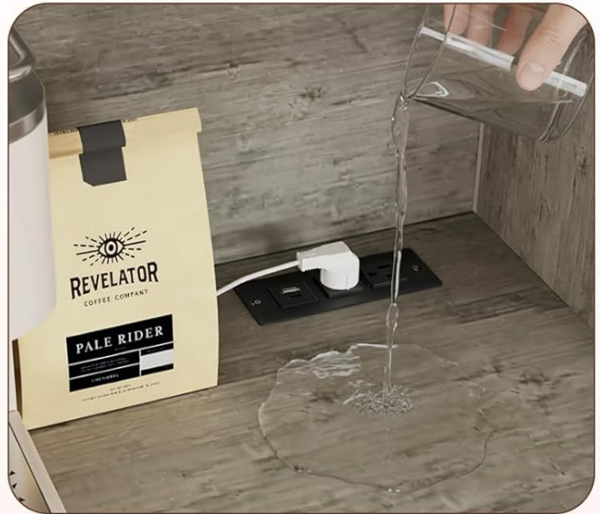
Waterproof and anti-corrosion