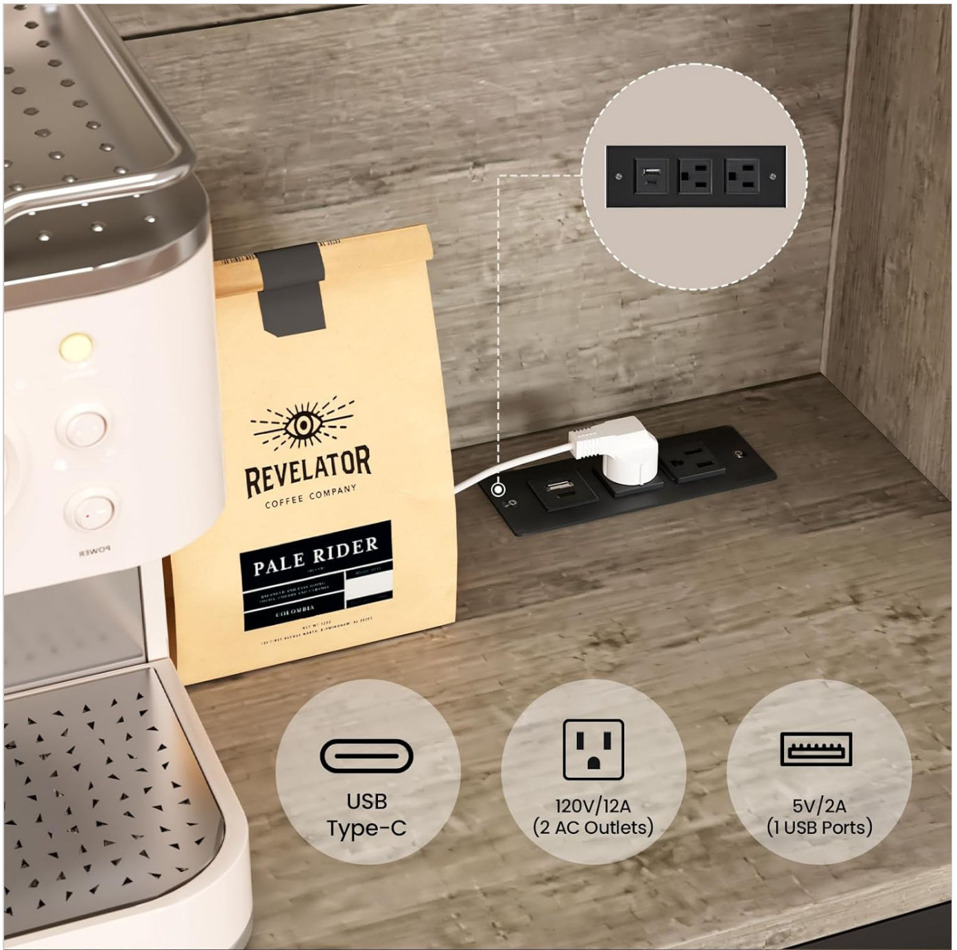
Image: Close-up view of the integrated charging station, detailing the AC, USB, and Type-C ports.