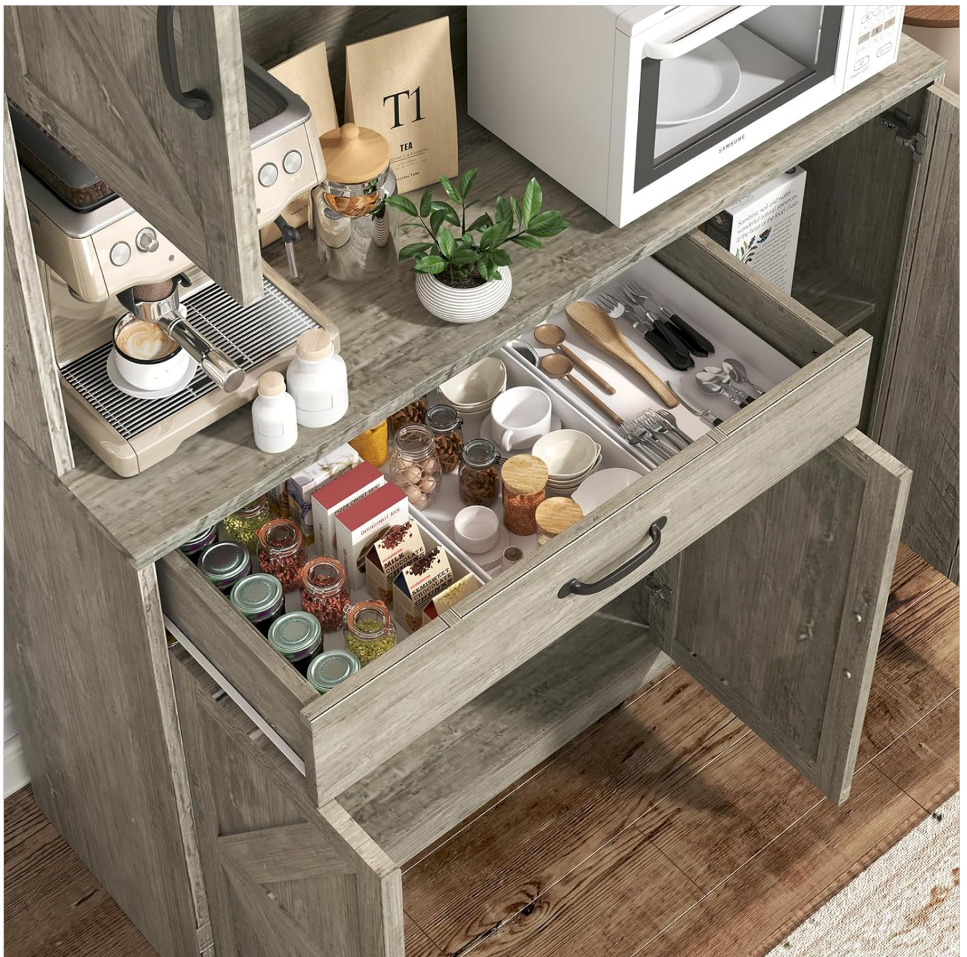
Image: An open drawer showcasing its capacity for organizing kitchen utensils and small items.