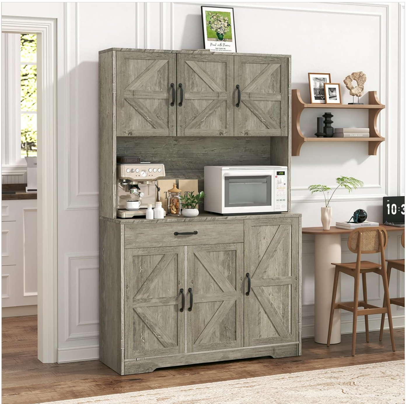
Image: Overview of the GRUSIGN 71-inch Pantry Cabinet, showing its full structure and design.