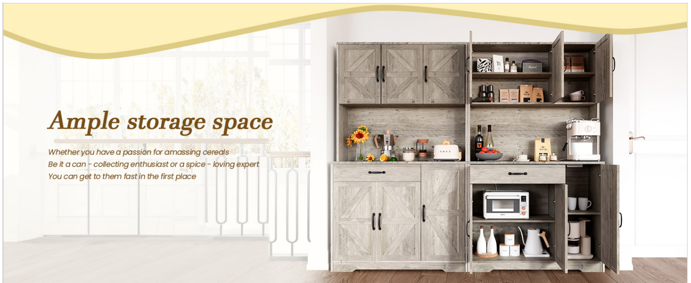
Image: Pantry cabinet with doors open, illustrating the adjustable shelves for customized storage.

The cabinet features customizable 3-level shelving in both upper and lower sections. To adjust a shelf, carefully remove it from its current position and reinsert it into the desired peg holes. Ensure the shelf is level and securely seated before placing items on it.