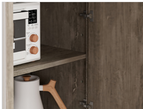
Image: Reinforced wood panels, highlighting the sturdy construction of the cabinet.