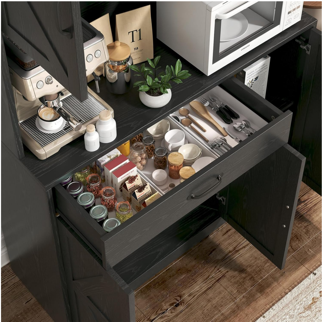
Figure 5: Smooth-Gliding Storage Drawer.