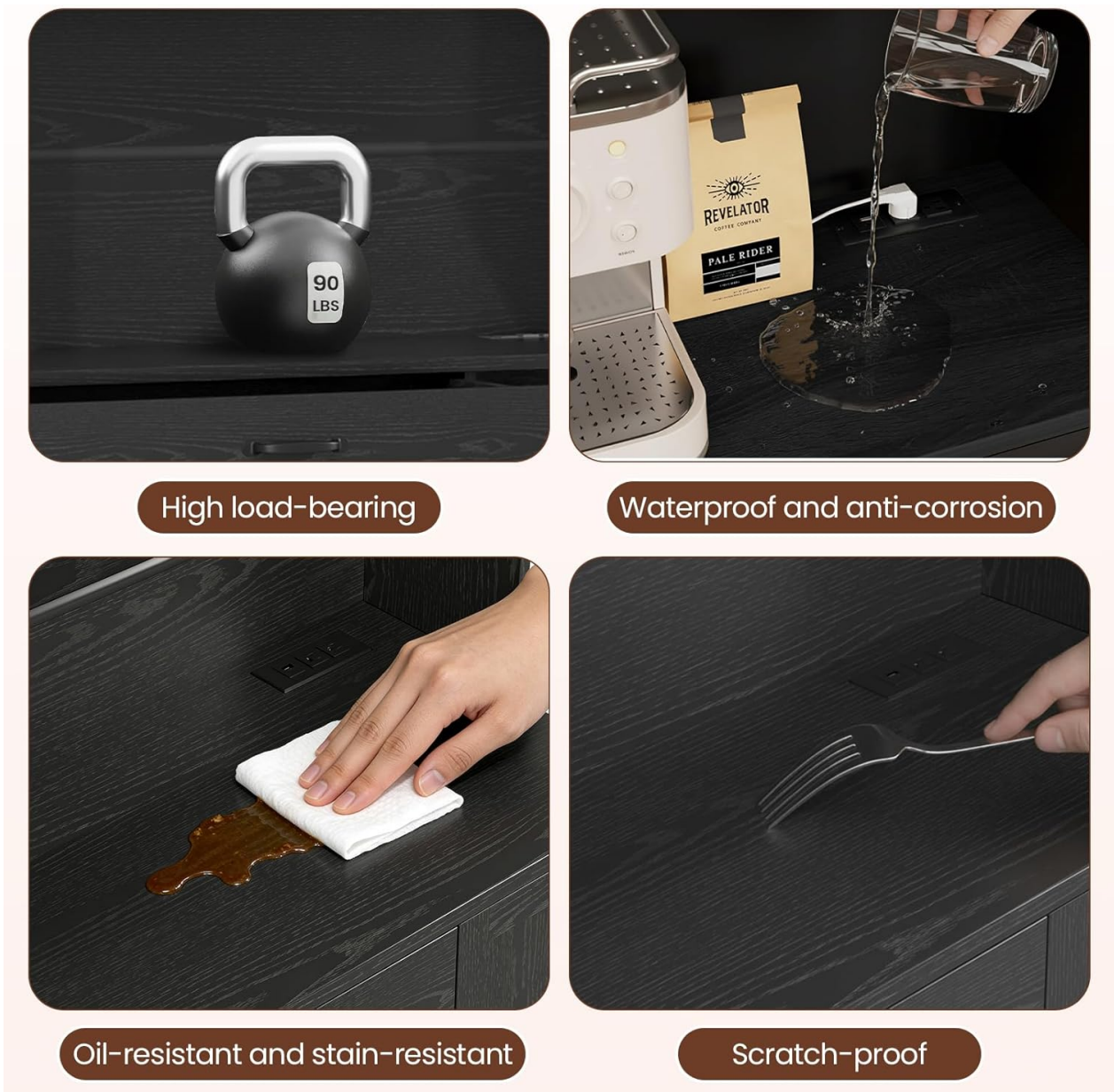
Figure 7: Cabinet Durability Features.