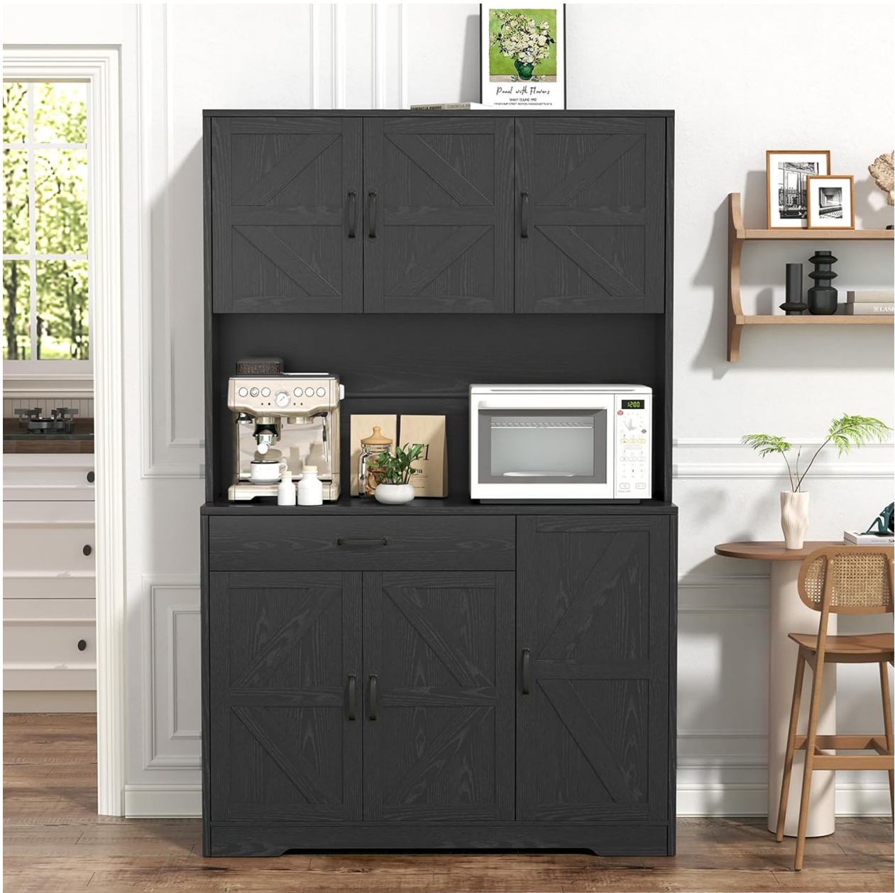
Figure 4: Adjustable Shelves for Customized Storage.