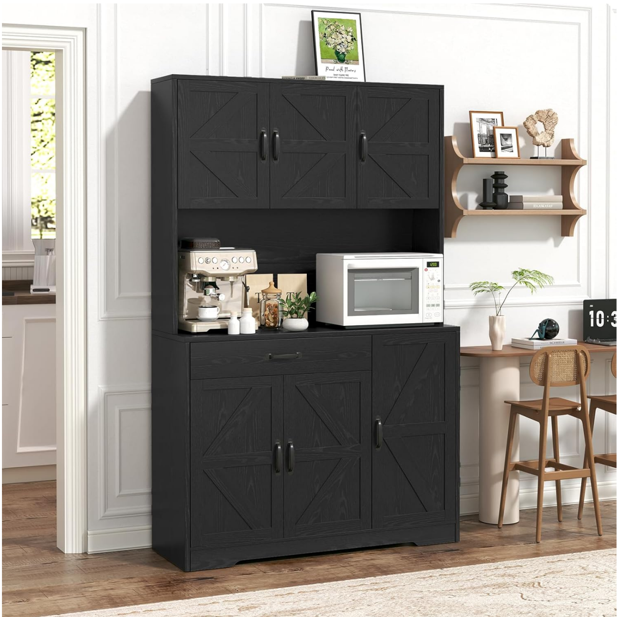
Figure 1: GRUSIGN 71" Pantry Cabinet with Charging Station.