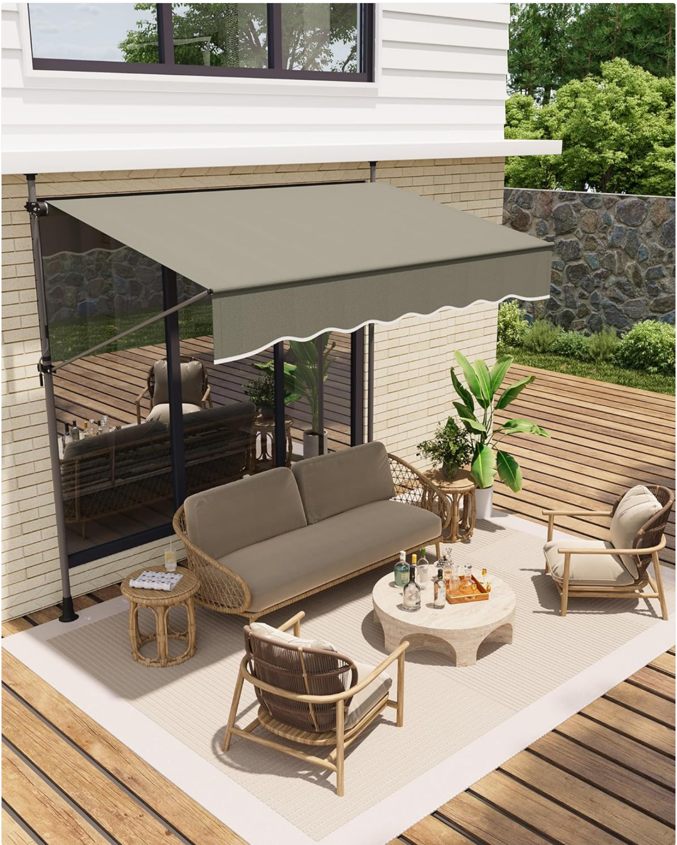
Figure 4.2: Example of a fully installed Garvee awning on a patio.