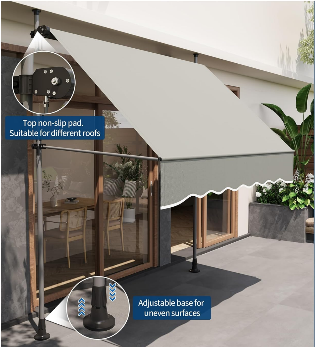
Figure 7.1: Awning fabric features: waterproof, windproof, and UV protection.