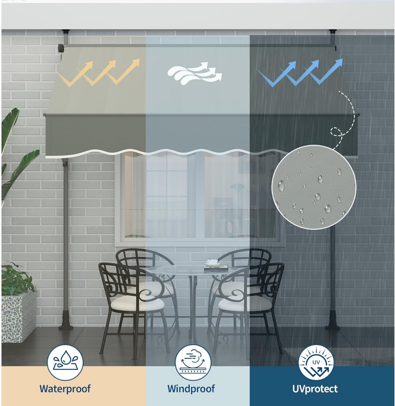
Figure 3.1: Key components of the Garvee Manual Retractable Awning.