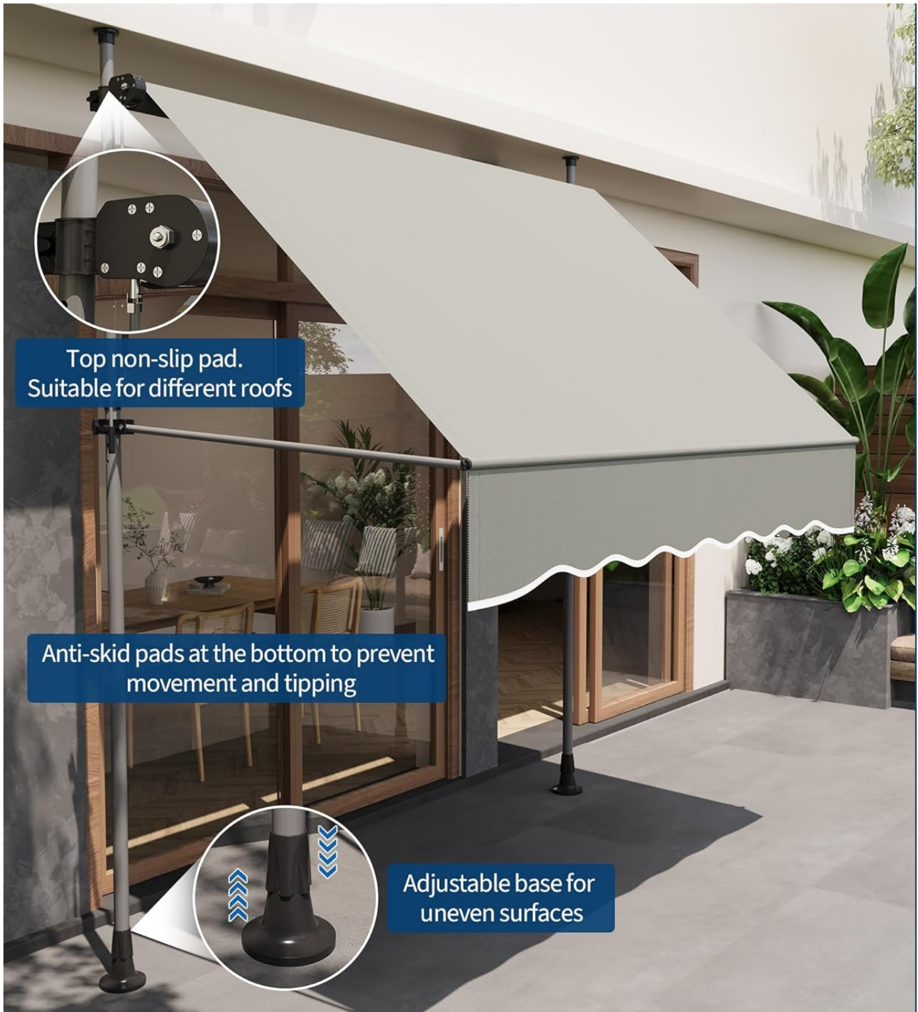
Figure 4.1: Thoughtful design elements for stability and adaptability.