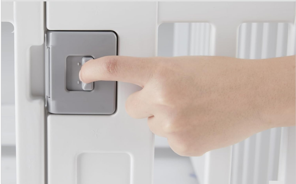
Figure 4: Detail of the secure sliding lock on the playpen door.

Enables easy opening and closing, while securely preventing pets from unlocking it.