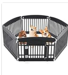
Figure 3: Example of a 6-panel playpen configuration.

Video 1: Sweetcrispy Plastic Dog Pen Assembly Guide. This video demonstrates the assembly process and features of the playpen.