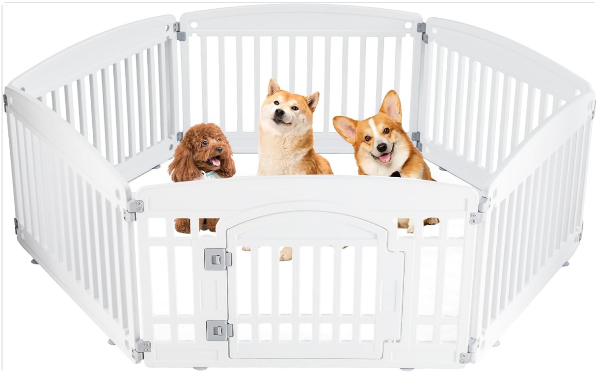
Figure 1: Sweetcrispy Plastic Dog Playpen in a typical indoor setup.