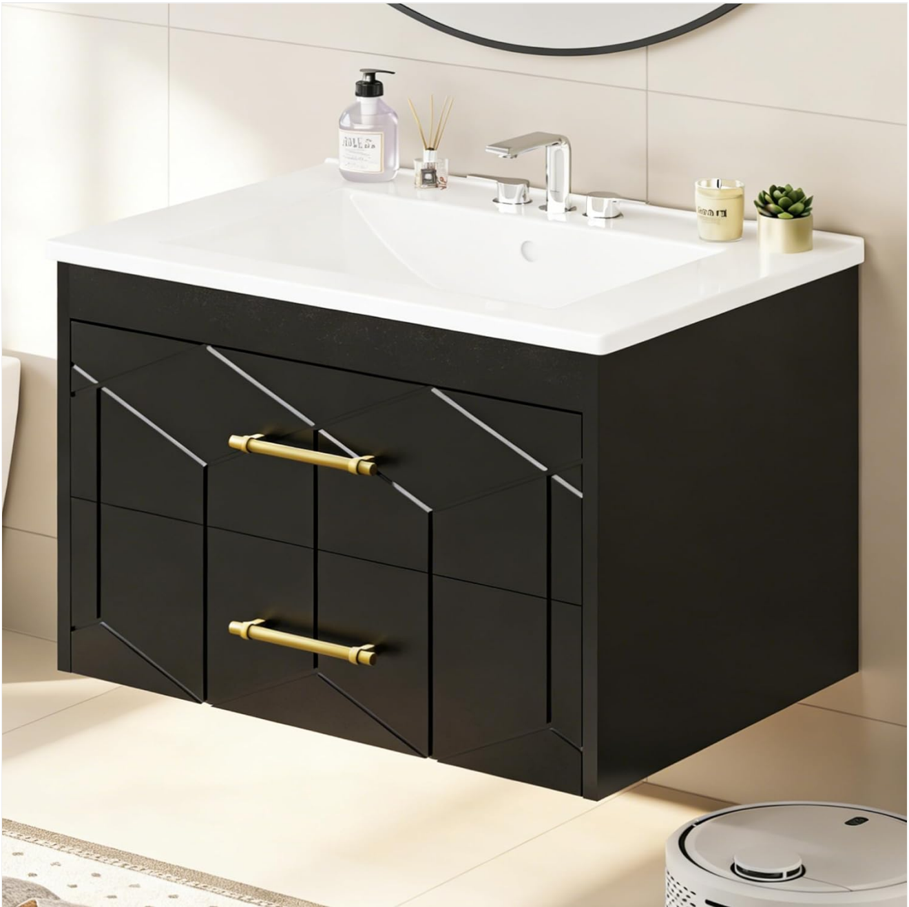
Figure 2.1: IDEALHOUSE Floating Bathroom Vanity with Sink (30 inch, Black).