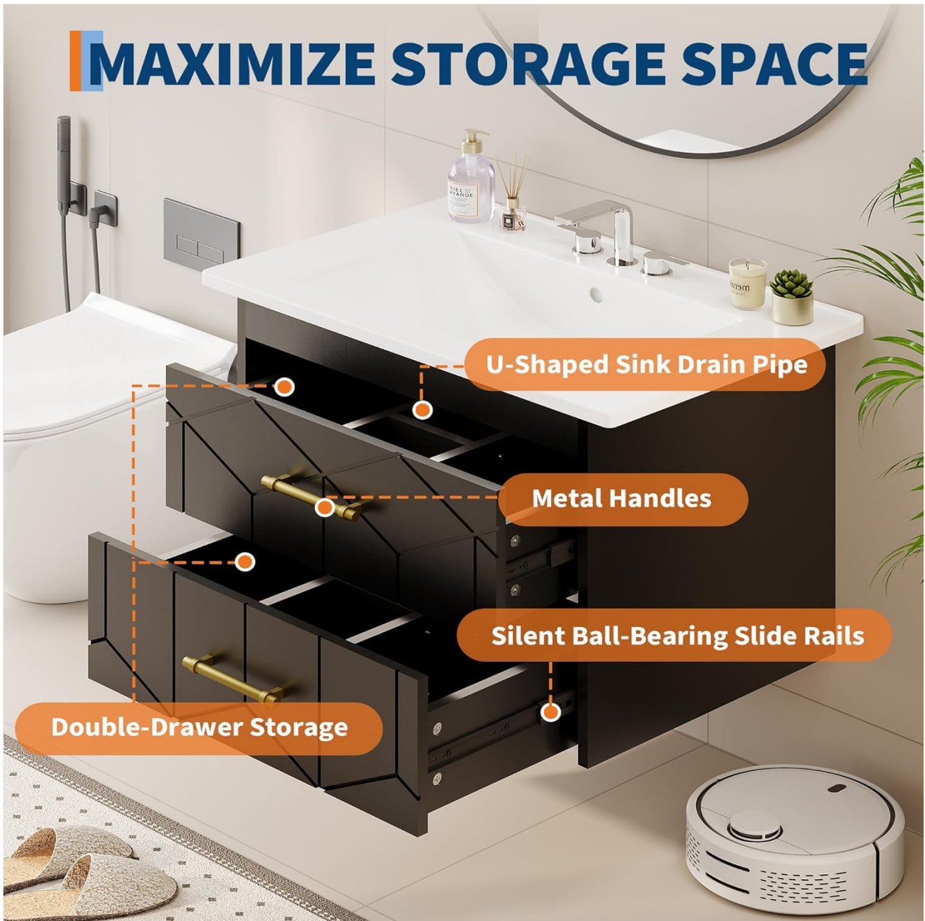
Figure 5.1: Maximizing Storage Space. The dual-drawer design provides ample room for bathroom items.