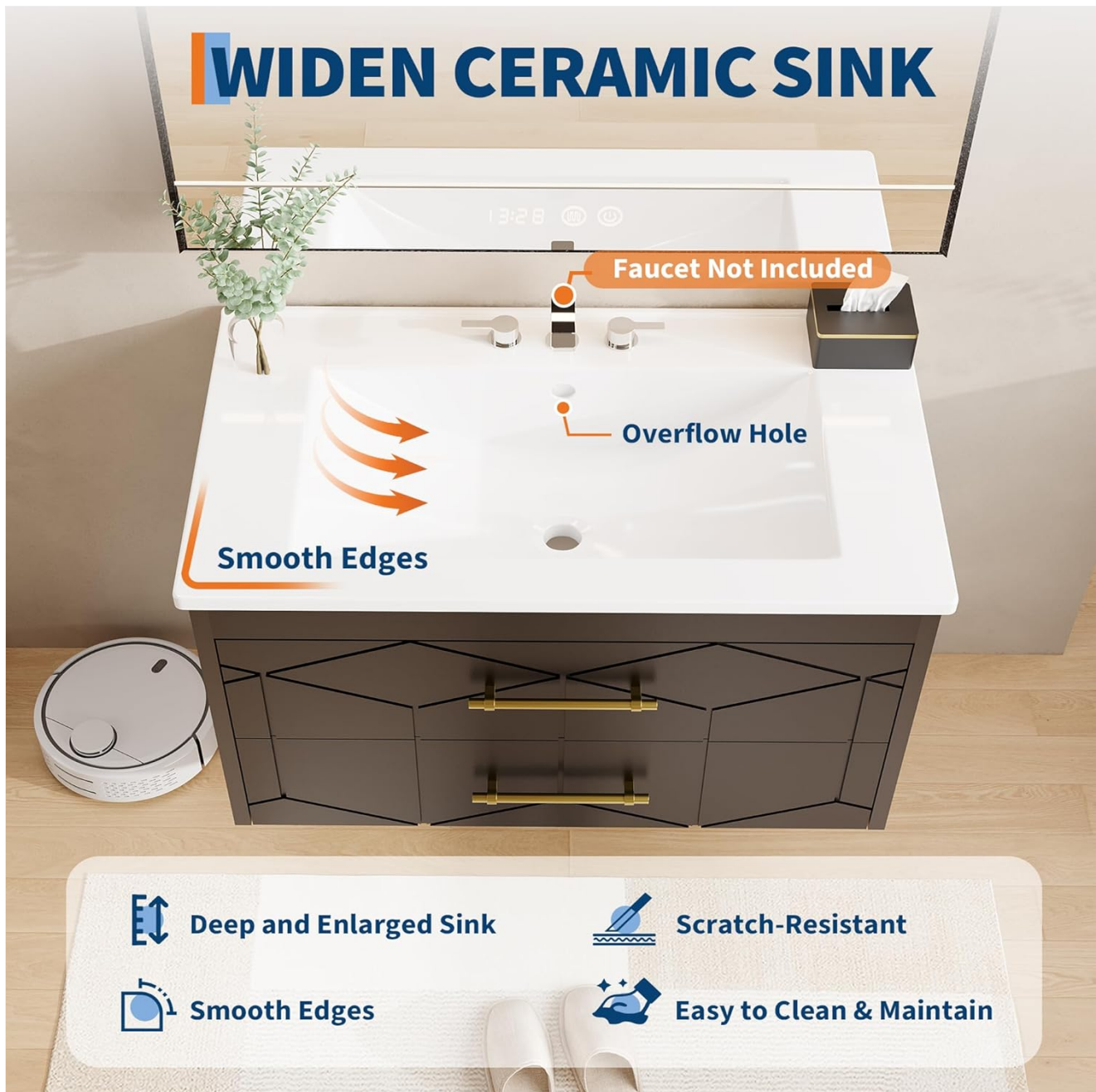
Figure 4.2: Ceramic Sink Installation. Note the overflow hole and smooth edges. Faucet is not included.