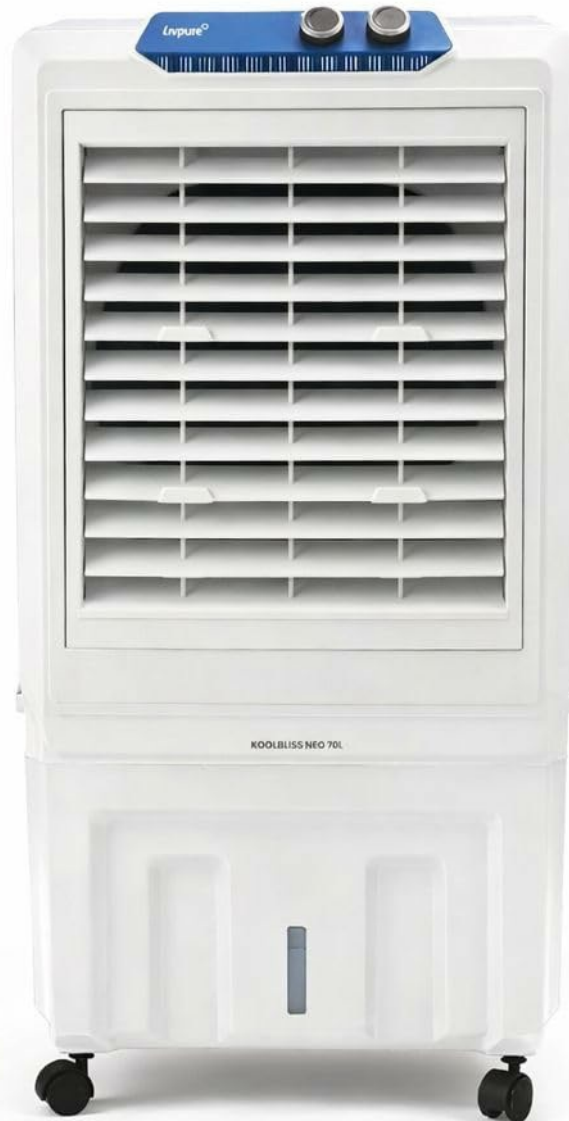
Image 1.1: Livpure KoolBliss Neo Desert Cooler 70L. This image shows the front view of the white desert cooler with its control panel and air vents.