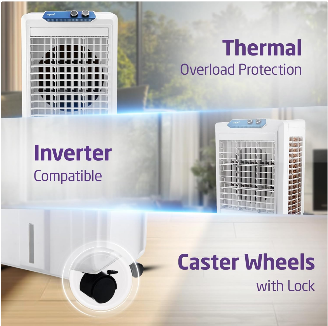
Image 3.1: Detail of the caster wheels with lock mechanism, highlighting the ease of mobility and secure placement.