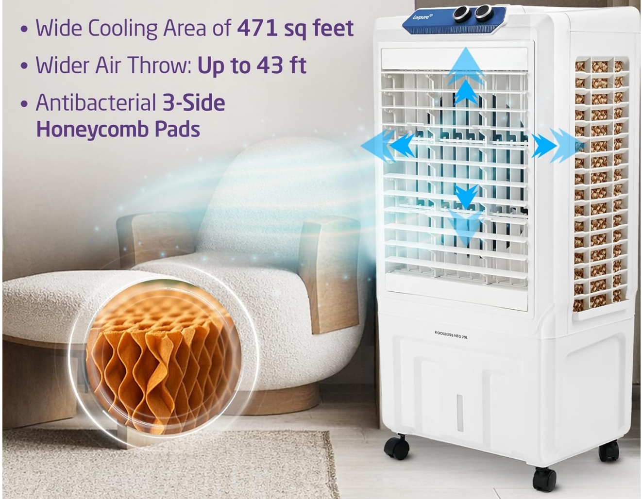
Image 2.1: Airflow diagram illustrating wide cooling area and air throw. The image highlights the cooler's ability to distribute cool air across a large space.