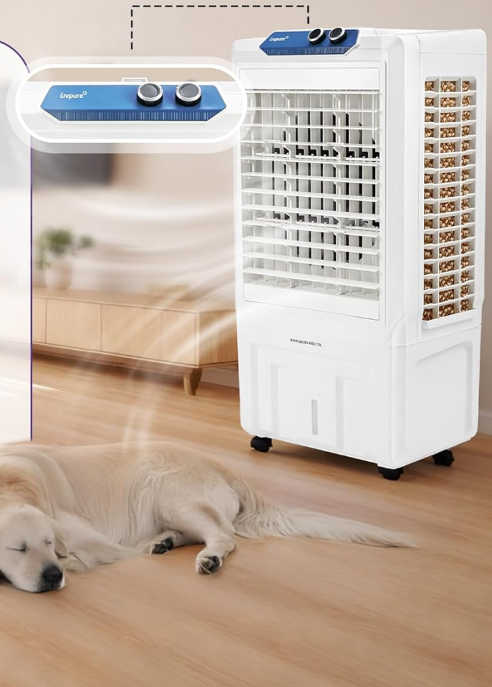
Image 2.2: Close-up of the cooler's fan and control panel, emphasizing axial fan technology and custom air control.