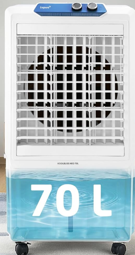
Image 4.1: The 70-liter water tank capacity of the cooler, indicating its large volume for extended cooling.