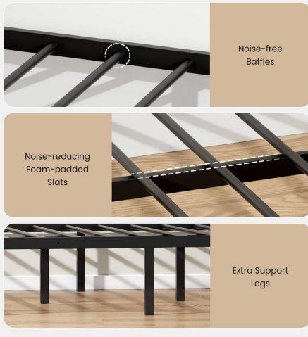
Image: Detailed view of the heavy-duty construction, highlighting noise-free baffles, noise-reducing foam-padded slats, and extra support legs for stability.