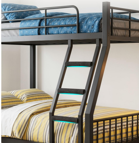
Image: The ladder featuring EVA non-slip padding on each step, designed for safe and comfortable climbing.

The EVA non-slip design adds safety and comfort, keeping you stable and secure while climbing