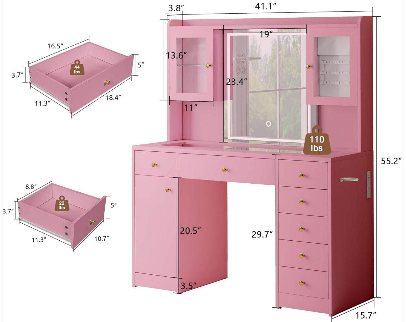
Figure 2.1: Overall Product Dimensions. The vanity measures approximately 15.7 inches deep, 41.1 inches wide, and 55.2 inches high.