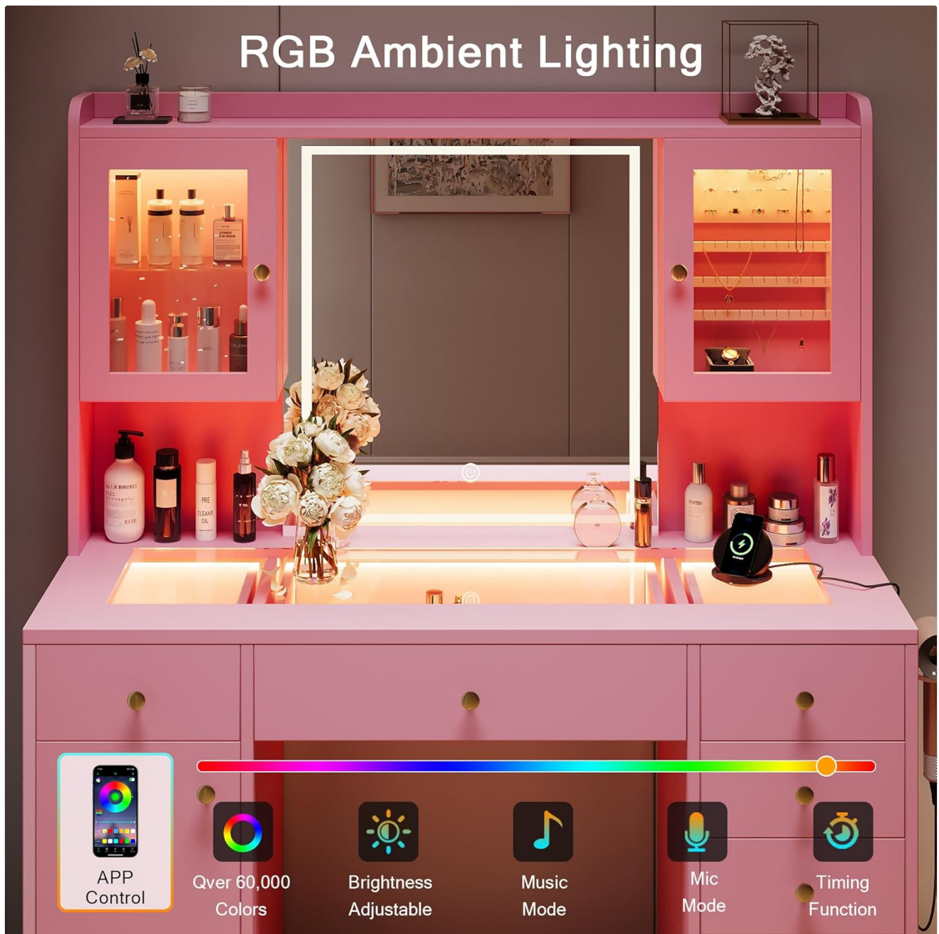
Figure 4.2: RGB Ambient Lighting Control. Customize your lighting experience via the mobile application.