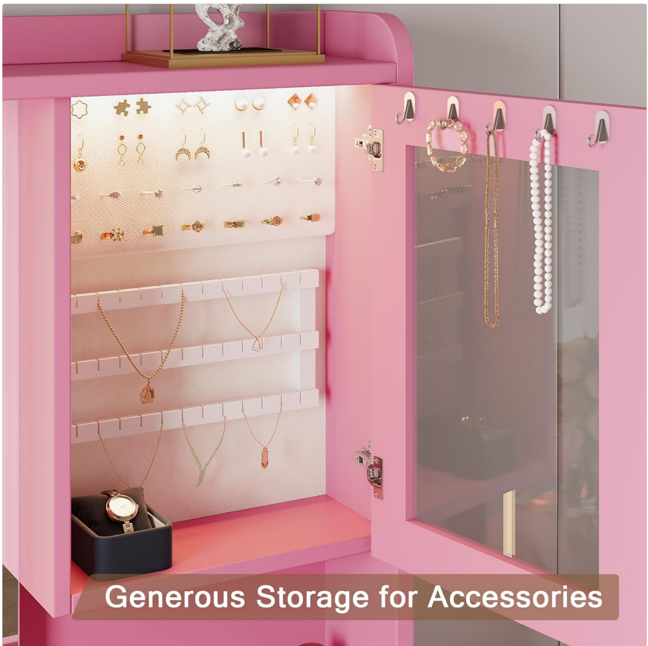
Figure 4.5: Jewelry Storage Sanctuary. Organized storage for various jewelry items.