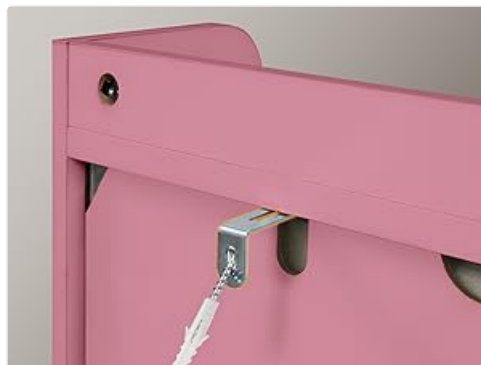
Figure 1.1: Anti-Tipping Device Installation. This device must be secured to a wall stud to prevent the vanity from tipping over.

CAUTION: This product requires assembly. Be aware of sharp edges and pinch points during assembly. Always follow the assembly instructions carefully to prevent injury. Ensure all fasteners are securely tightened before use. Do not overload drawers or shelves. This product includes an anti-tipping device; ensure it is properly installed to prevent accidental tipping, especially in households with children or pets.