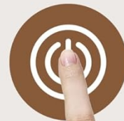
Figure 4.1: Mirror Lighting Modes. Adjust light color and brightness for optimal makeup application.