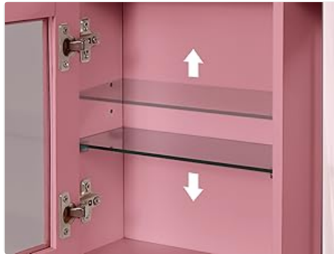
Figure 3.1: Adjustable Shelves. Note that some shelves are adjustable to accommodate items of various heights.