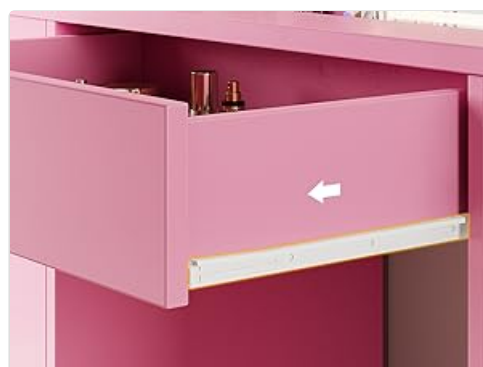
Figure 4.6: Smooth Drawer Operation. Drawers are designed for easy opening and closing.