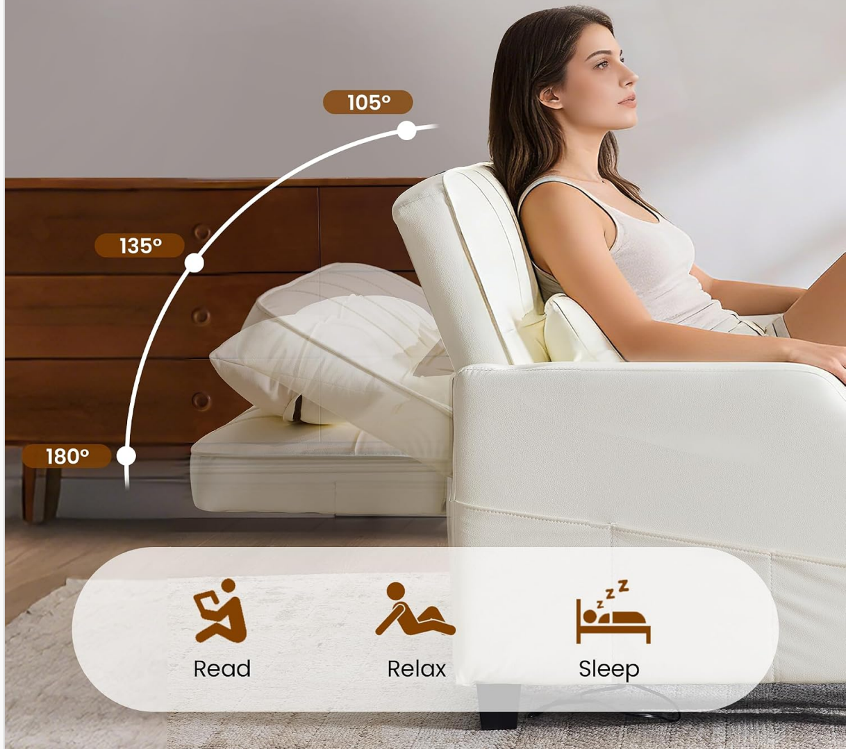
Image: Illustration of the 3-level adjustable backrest, showing 105°, 135°, and 180° positions for reading, relaxing, and sleeping.