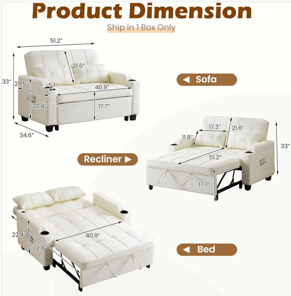
Image: The MELLCOM 51" Pull Out Sofa Bed in its standard sofa configuration, ready for use after assembly.