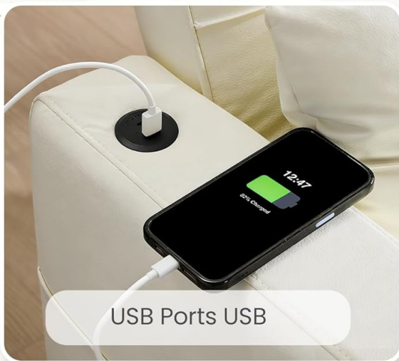
USB Ports USB