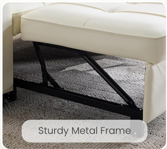
Sturdy Metal Frame

Image: Detailed view highlighting the practical features: cup holders, side storage pockets, USB charging ports, and the robust metal frame supporting the pull-out mechanism.