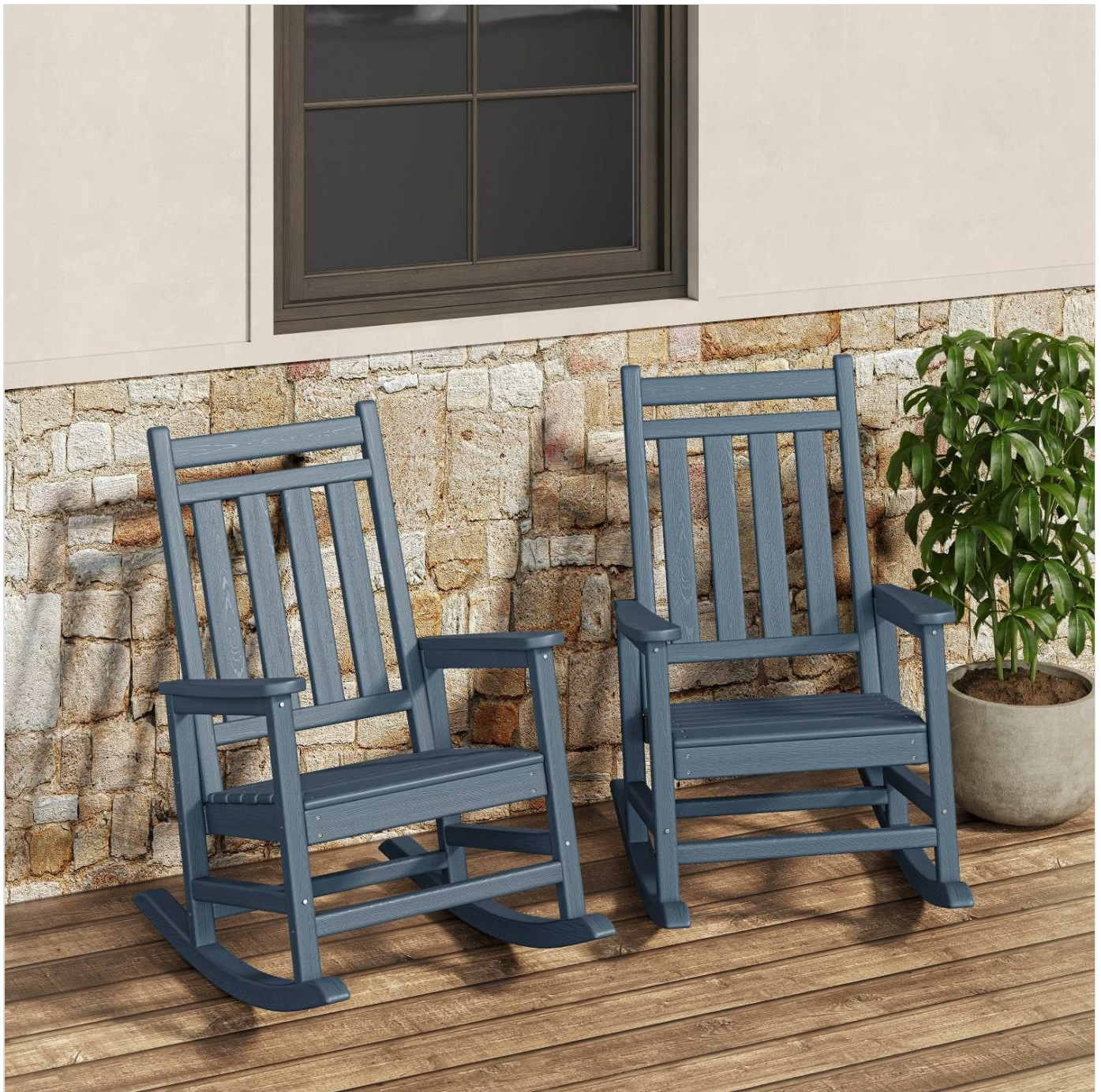
Image: The Garvee HDPE Rocking Chair Outdoor Set of 2 in Navy Blue, showcasing its design and suitability for outdoor spaces.