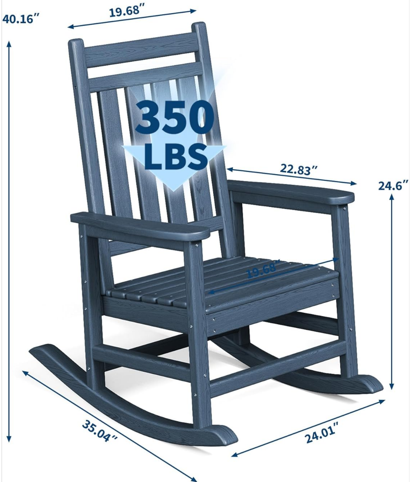
Image: A diagram illustrating the precise dimensions of the rocking chair.