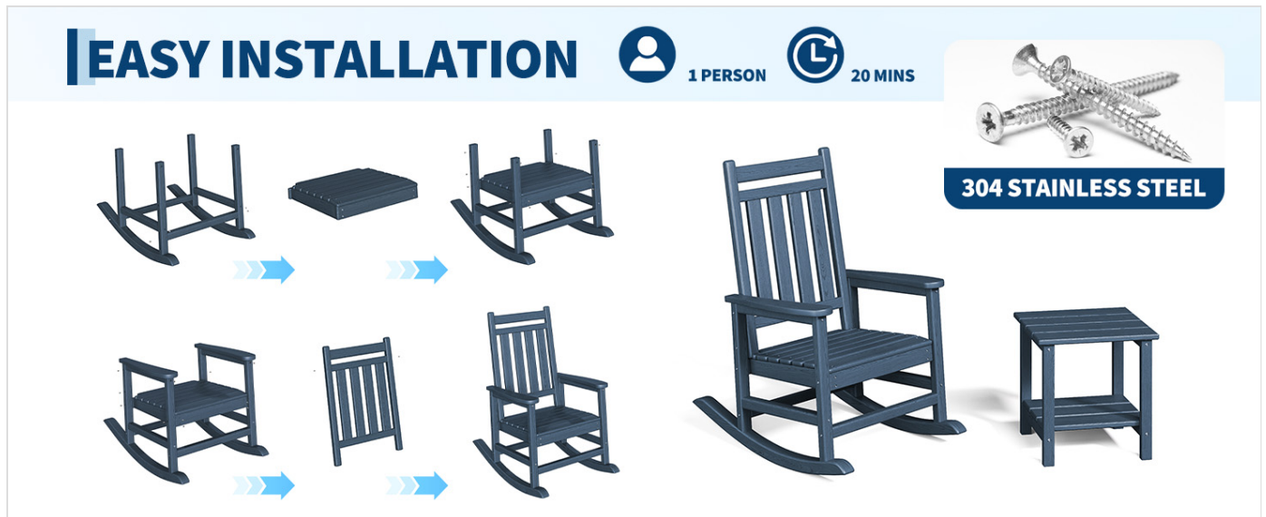
Image: A visual guide illustrating the easy installation process for the rocking chair.