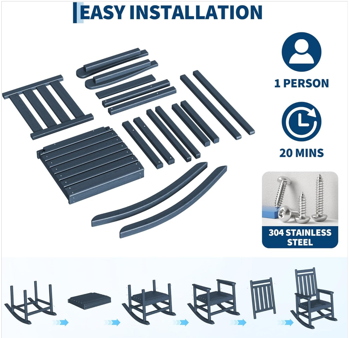
Image: A visual representation of the chair components and a step-by-step assembly guide.