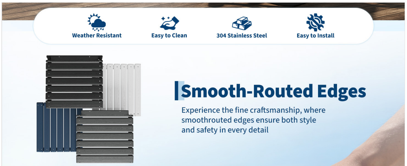
Image: Explains the benefits of HDPE material, including durability and eco-friendliness.

Image: Illustrates the waterproof nature and easy maintenance of the HDPE material.