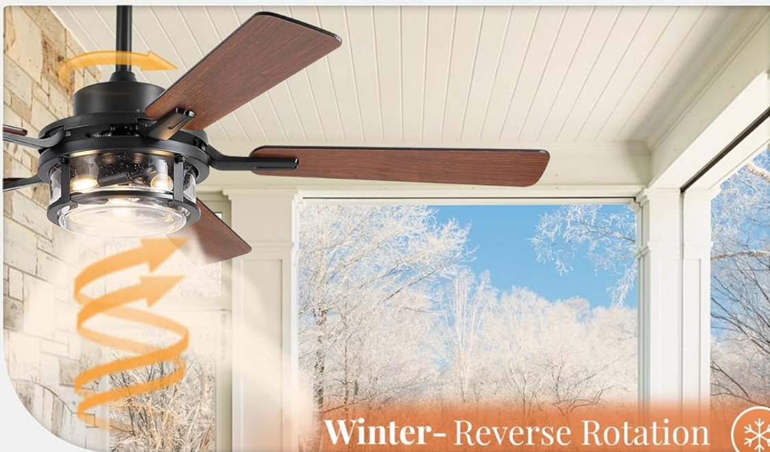
Image: Reversible DC Motor function. Summer mode pushes air down for cooling, while winter mode circulates warm air upwards.