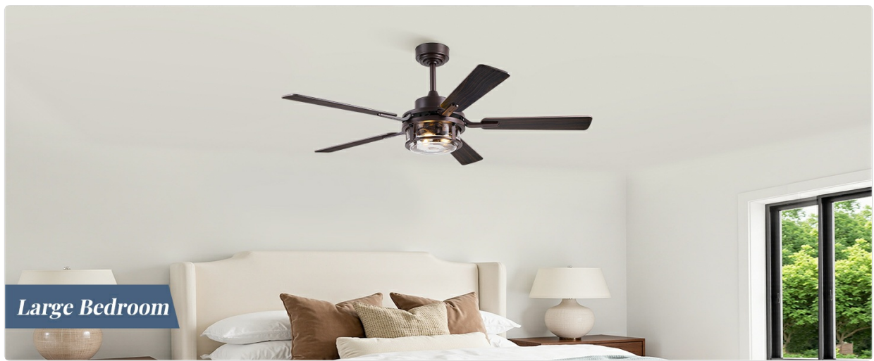
Image: Dual-mount options. The fan supports standard downrod mounting and angled mounting for sloped ceilings up to 15 degrees.