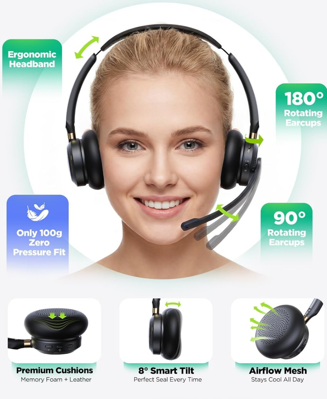
Image 1.1: The Acer OHR689 Wireless Headset with its charging stand.

The OHR689 headset is engineered for comfort during extended use, featuring an ergonomic design and lightweight construction. Its multi-function charging dock simplifies storage and ensures your headset is always ready for use.