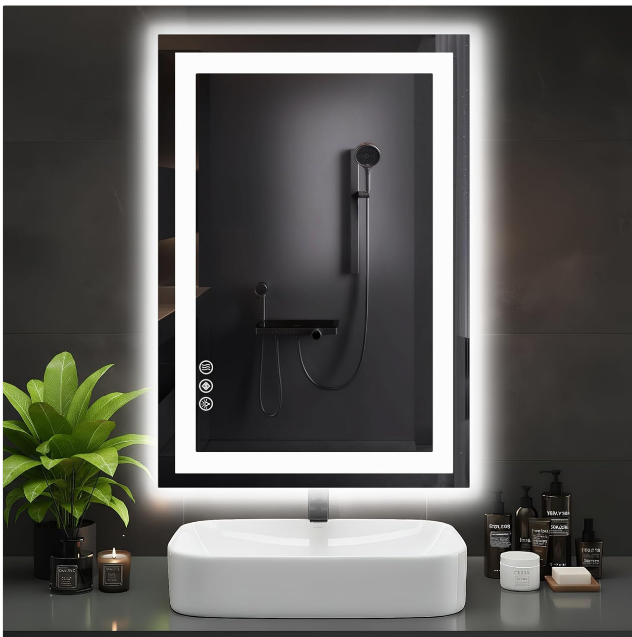
The main product image of the DUMOS Smart LED Bathroom Mirror, showcasing its rectangular design and integrated lighting, ready for power connection.

Connect the mirror's power cord to a standard electrical outlet. For a cleaner installation, the mirror can be hardwired by a qualified electrician, ensuring all local electrical codes are followed.