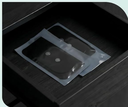
4 Stick pads back on the plastic film and store in a cool, dry place.

This visual guide provides clear instructions for the proper use and care of your Medcursor TENS unit electrode pads. It demonstrates how to prepare your skin, apply the pads, clean them after use, and store them correctly to maximize their lifespan and performance.