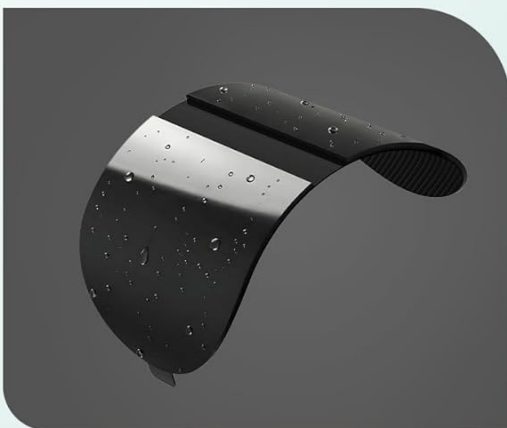
3 After use, rinse pads with water and let them air dry.