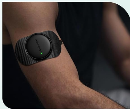
2 Attach pads firmly to flat skin.