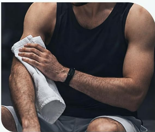
1 Clean and dry your skin before use.